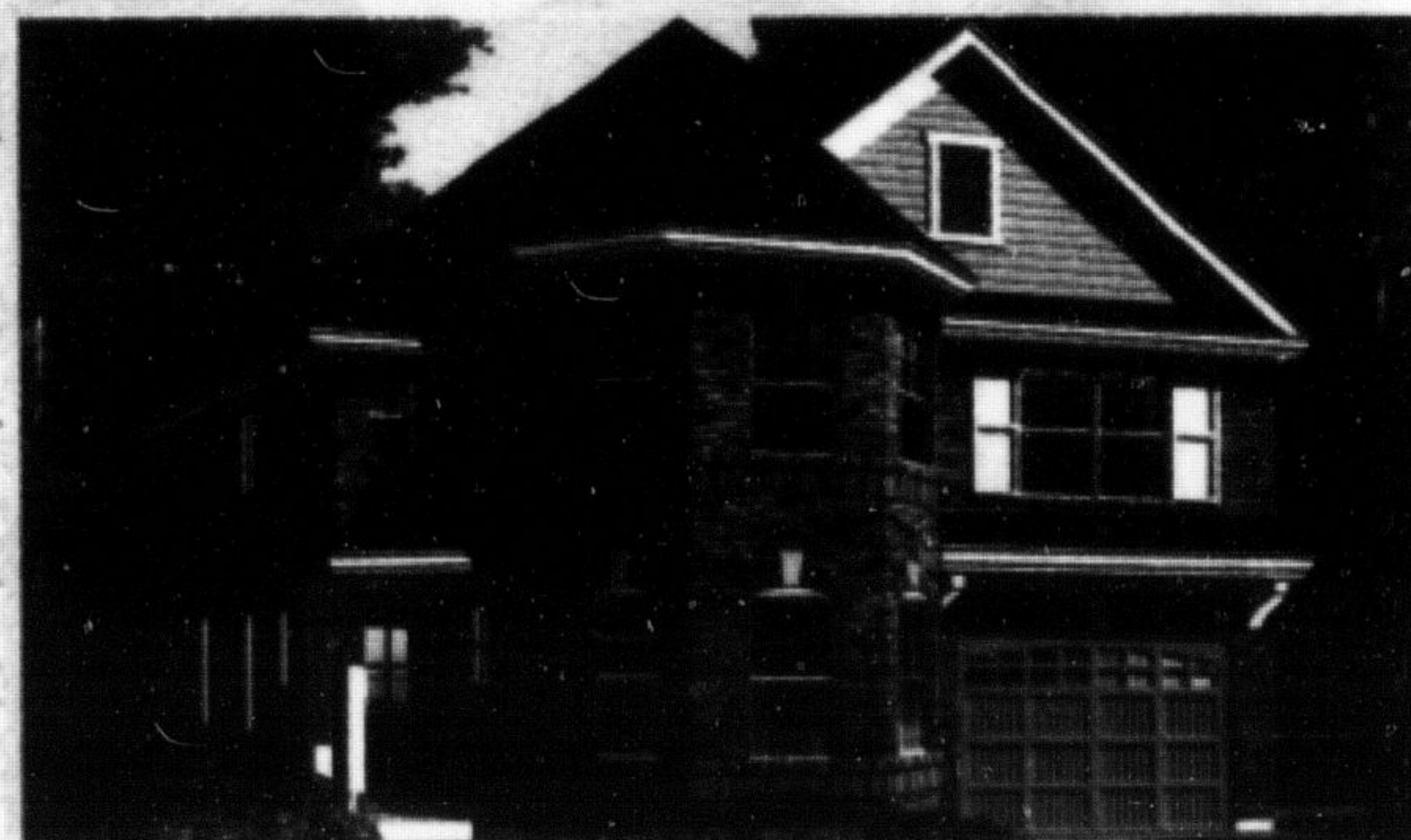
30' WideLot™, Plan 9, Elev. 'B', 2,127 Sq.Ft., $423,990

Presentation Centre Hours: Monday to Thursday 1pm-8pm; Friday 1pm-6pm; Saturday, Sunday and Holidays 11am-6pm.