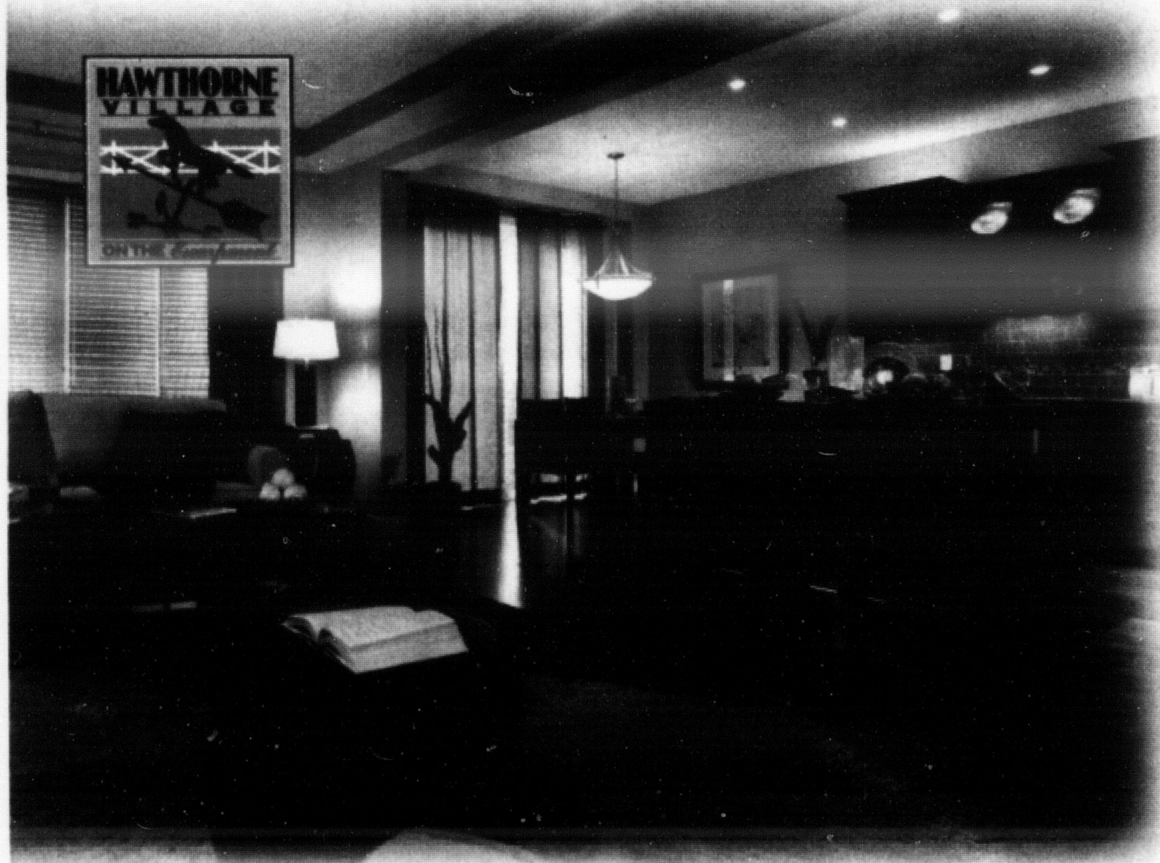
Relax In Your Large Kitchen/Family Room

New Release Of Village Homes, WideLot™ Townhomes, 30' & 34' Detached Homes.