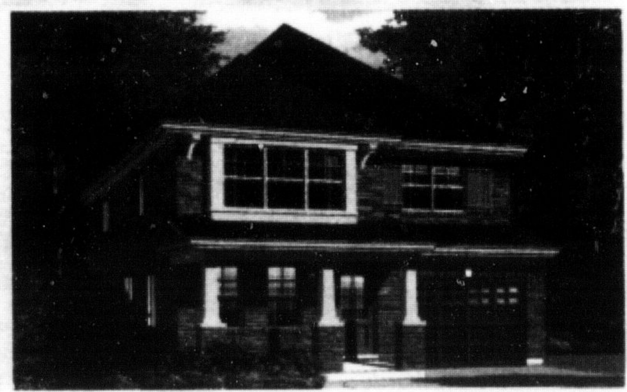
30' WideLot™, Plan 8, Elev. 'E', 1,948 Sq.Ft., $406,990

Presentation Centre Hours: Monday to Thursday 1pm-8pm; Friday 1pm-6pm; Saturday, Sunday and Holidays 11am-6pm.