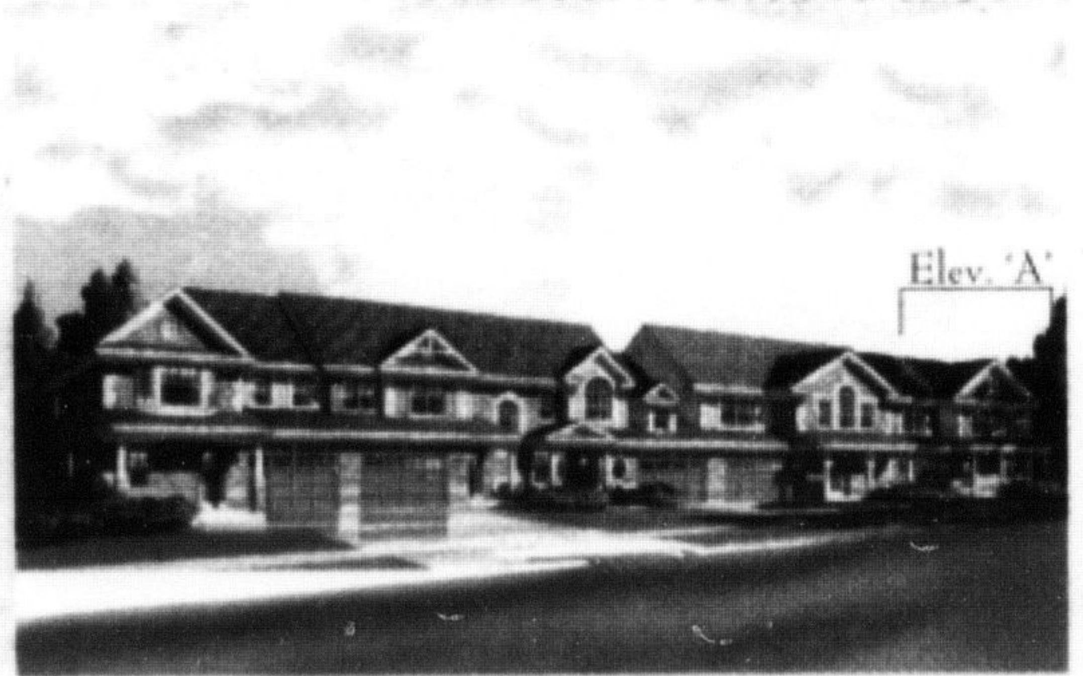
WideLot™ Townhome, The Hillview, Elev. 'A', 1,510 Sq.Ft., $328,990