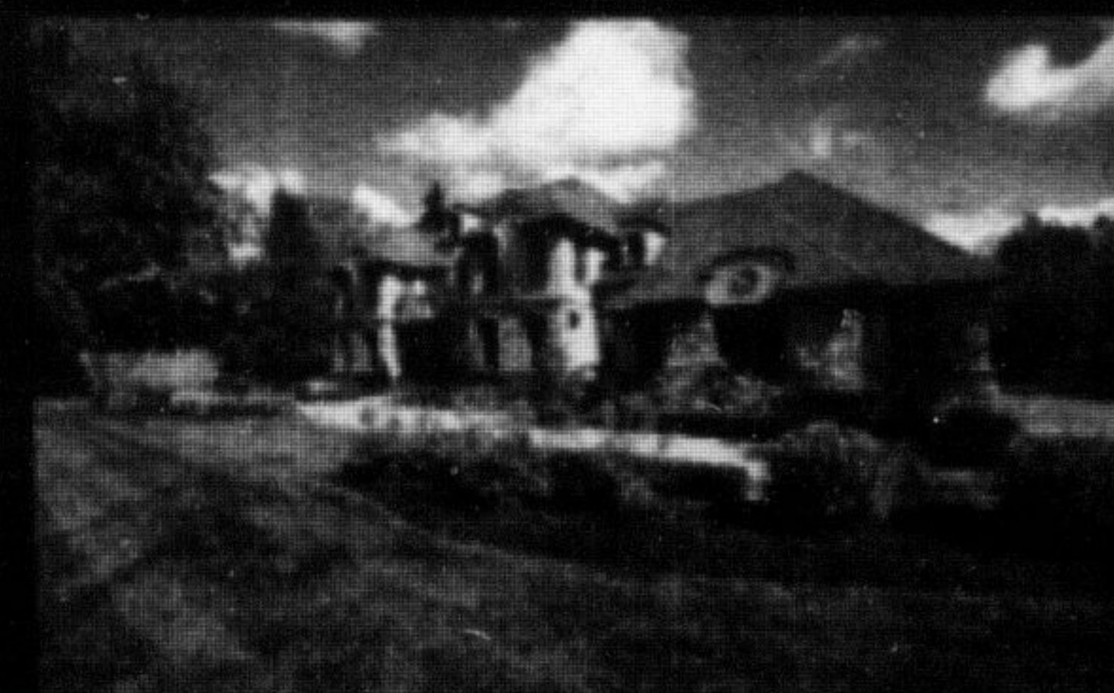
THE BEST OF BOTH WORLDS – $2,195,000

Situated in a rural setting yet minutes from all amenities and offering quick Hwy. access for commuters. Recently custom built with soaring ceilings and oversized windows to showcase the natural surroundings. Main level master bedroom with walkout to the patio and in-ground pool. Fully finished lower level with 5th bedroom and bath, perfect as a nanny/ guest suite.