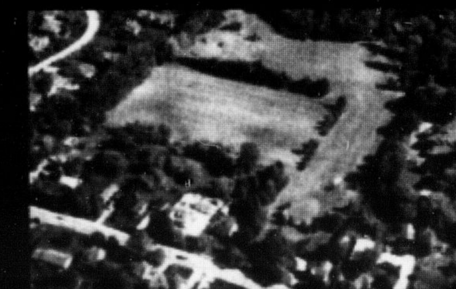
DEVELOPMENT POTENTIAL – $1,498,000

Gated and very private custom built country estate on over 13.6 acres of professionally landscaped natural grounds. Just minutes from Kilbride! Live the rural lifestyle, minutes to city! Incredibly landscaped with breathtaking pool, hot tub jets & Bunker and auto retractable cover. Sand beach, volleyball, basketball courts, inside & out! Golf on your own pitching green & hole! Over 13,000 SF of luxury fin living space!