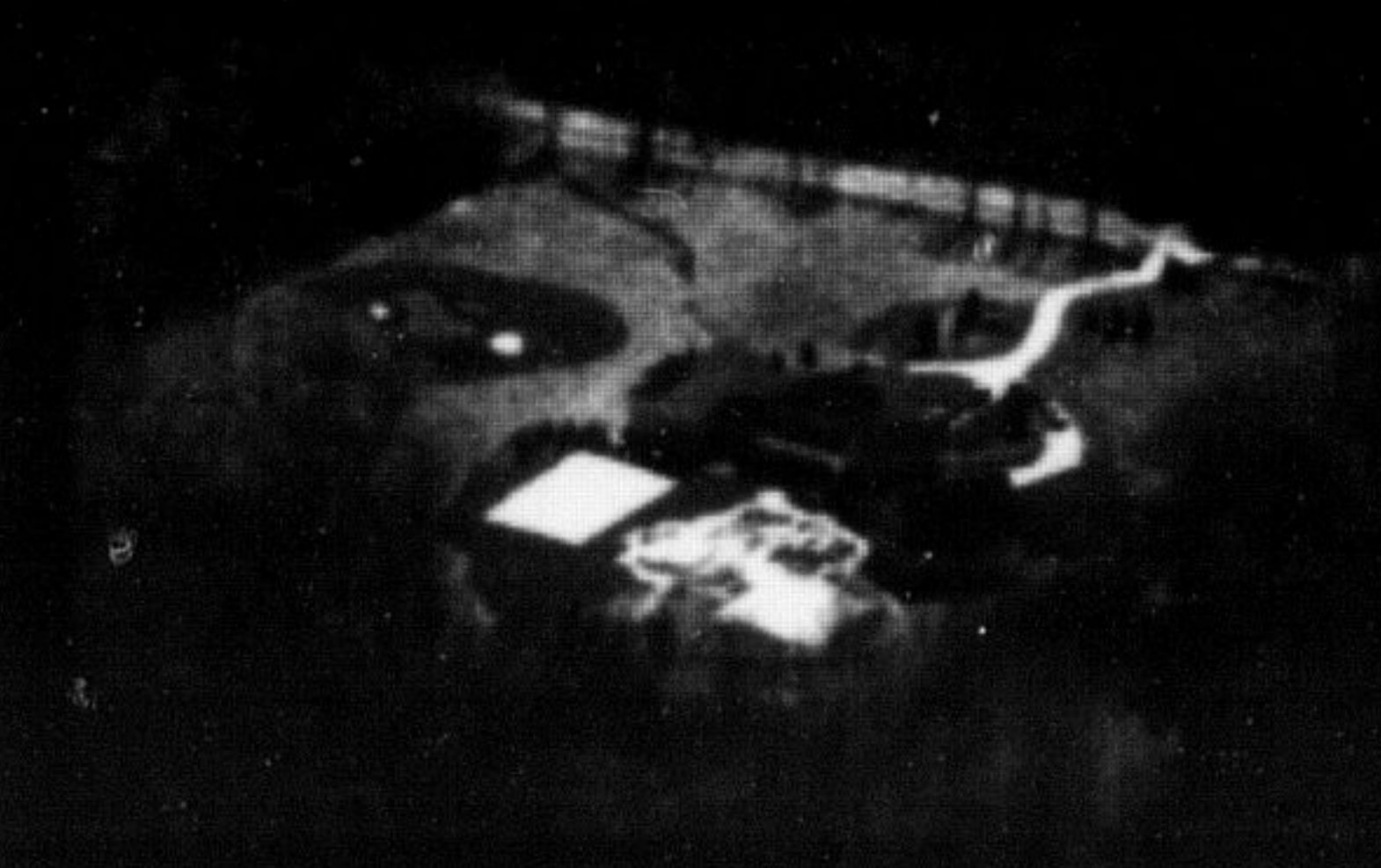
LIVE THE RURAL LIFESTYLE – $3,750,000

Spacious 3+1 bed, 3 bath bungalow backing onto green space on a large estate lot. Fully landscaped, with impeccable gardens, interlock patios & large custom F&O cedar deck, walkout lower level. Open concept, hardwood floors, 10'-14' ceilings, custom maple kitchen, 6 pc ensuite, large walk in closets.