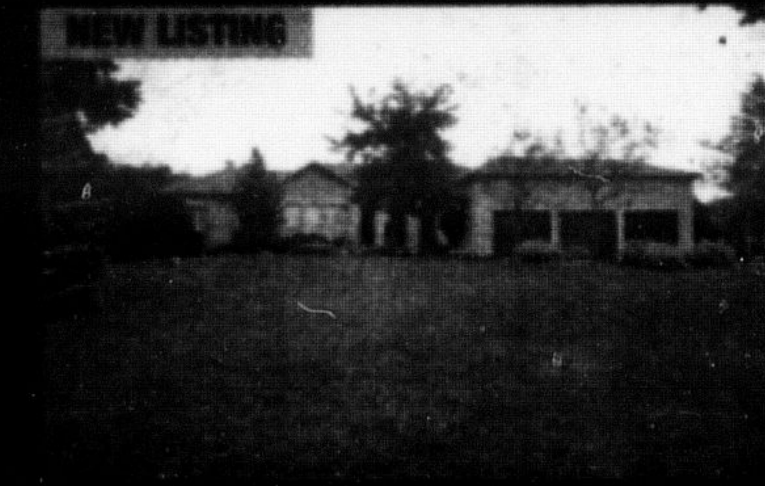
CHURCHILL ESTATES – $1,179,000