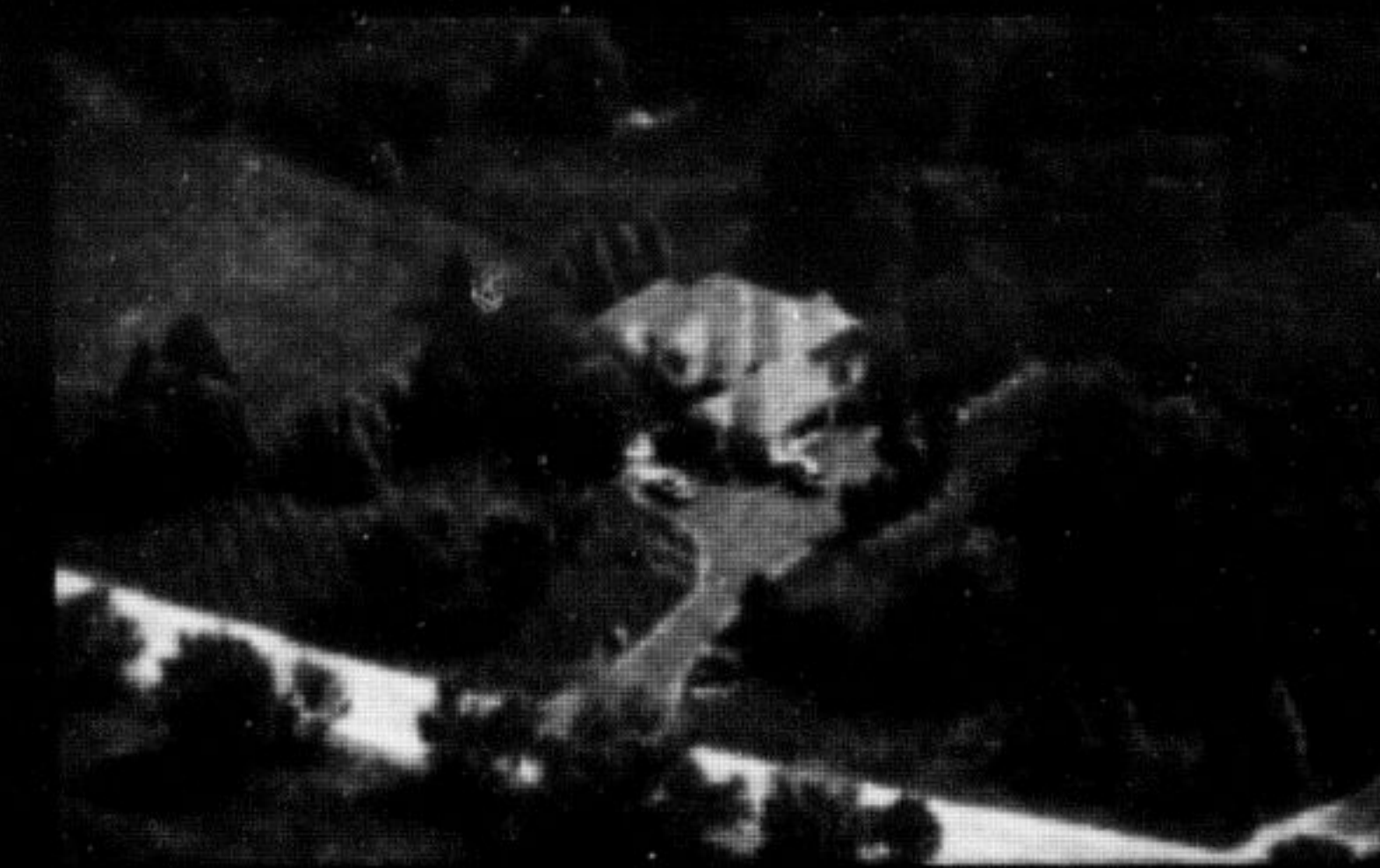
STUNNING RURAL SETTING – $1,695,000