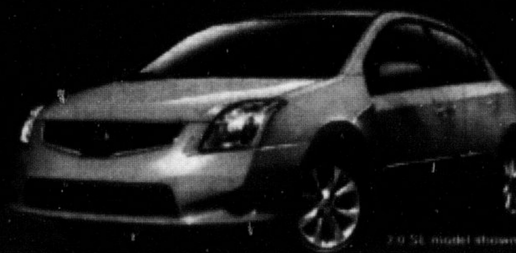
2.0 SE model shown*

148-hp, 2.0 L DOHC 16-valve 4-cylinder engine with available Xtronic CVT • Standard ABS, Vehicle Dynamic Control (VDC), Traction Control System (TCS) • Nissan Advanced Six Airbag System • Available Remote Keyless Entry • Available Power Windows and Heated Outside Mirrors • Standard Power Door Locks