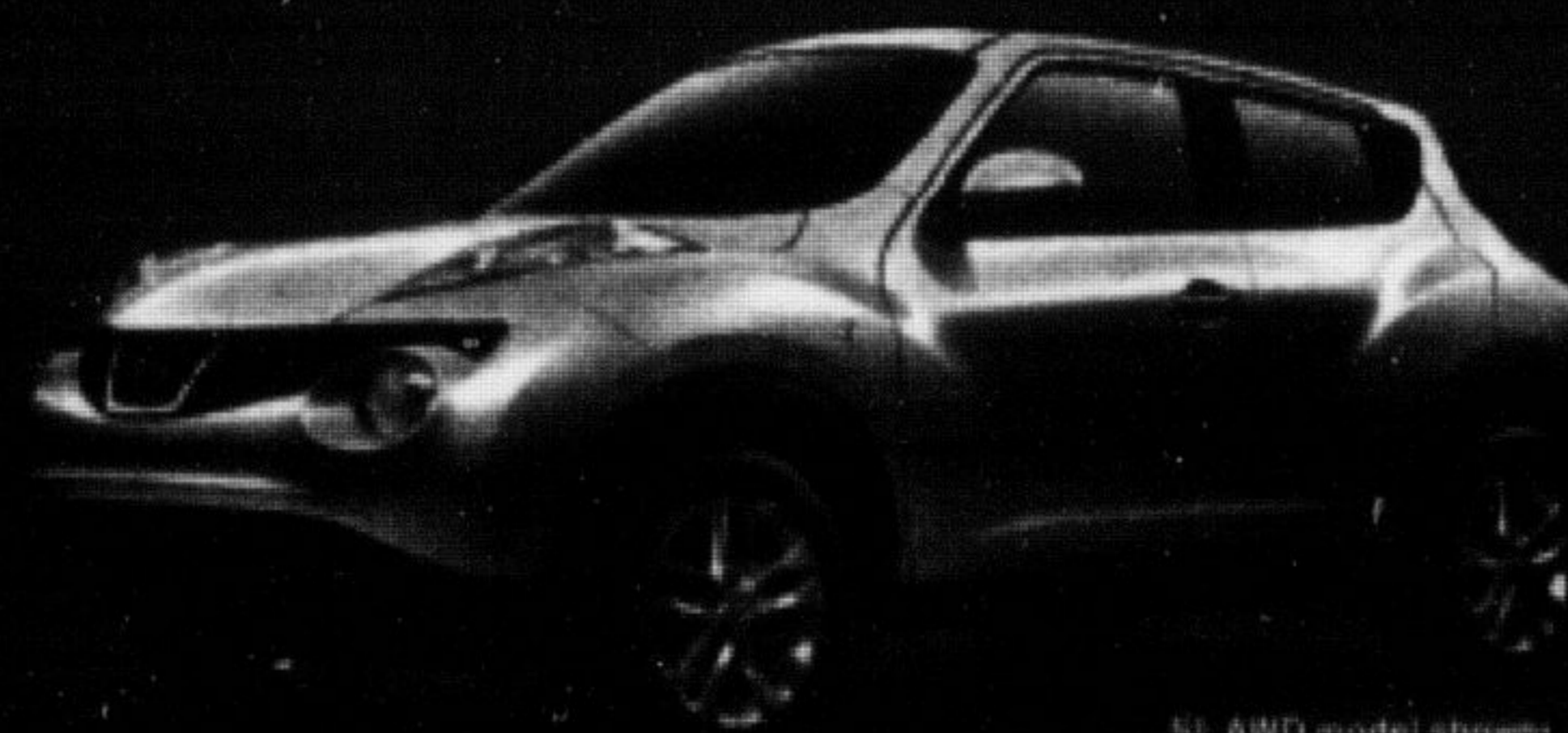
SL AWD model shown*