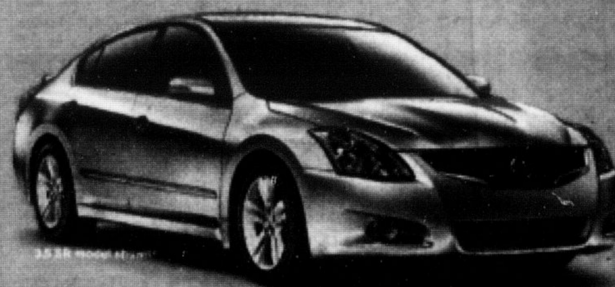
2.5 SE model shown*

175-hp, 2.5 L DOHC 16-valve 4-cylinder engine with available Xtronic CVT • Standard ABS, Vehicle Dynamic Control (VDC), and Traction Control System (TCS) • Nissan Advanced Six Airbag System • Standard Power Windows, Locks and Heated Outside Mirrors • Available Hands-Free Bluetooth™ System and Rearview Camera