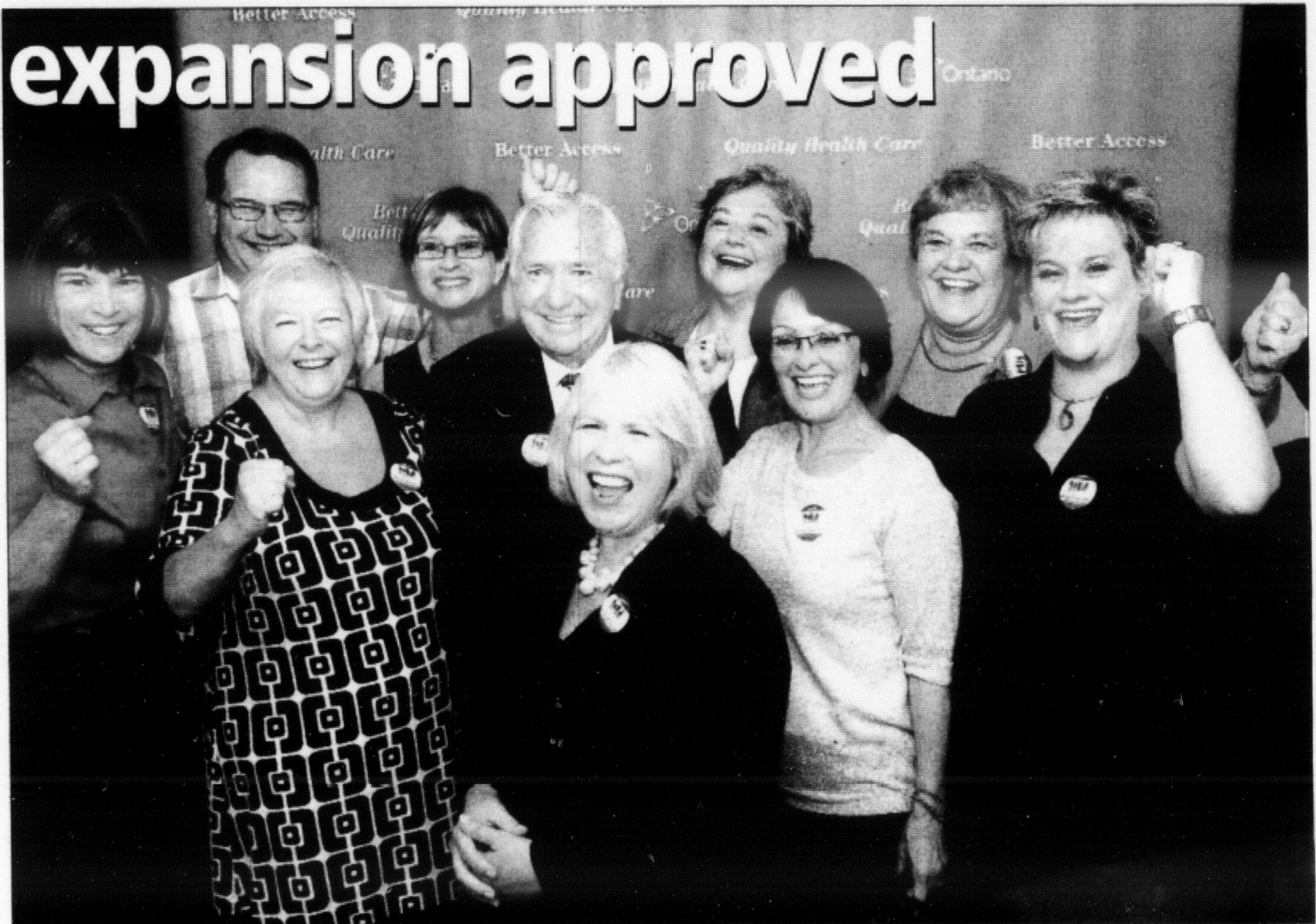
Members of citizens' group Friends of Milton Hospital, which led a campaign seeking approval for the hospital expansion, celebrate following the announcement by Ontario Health Minister Deb Matthews (front centre). The group gathered 35,000 signatures in support of the expansion in 2009.

The expansion will include a new emergency department to accommodate 45,500 visits a year. Currently the department can