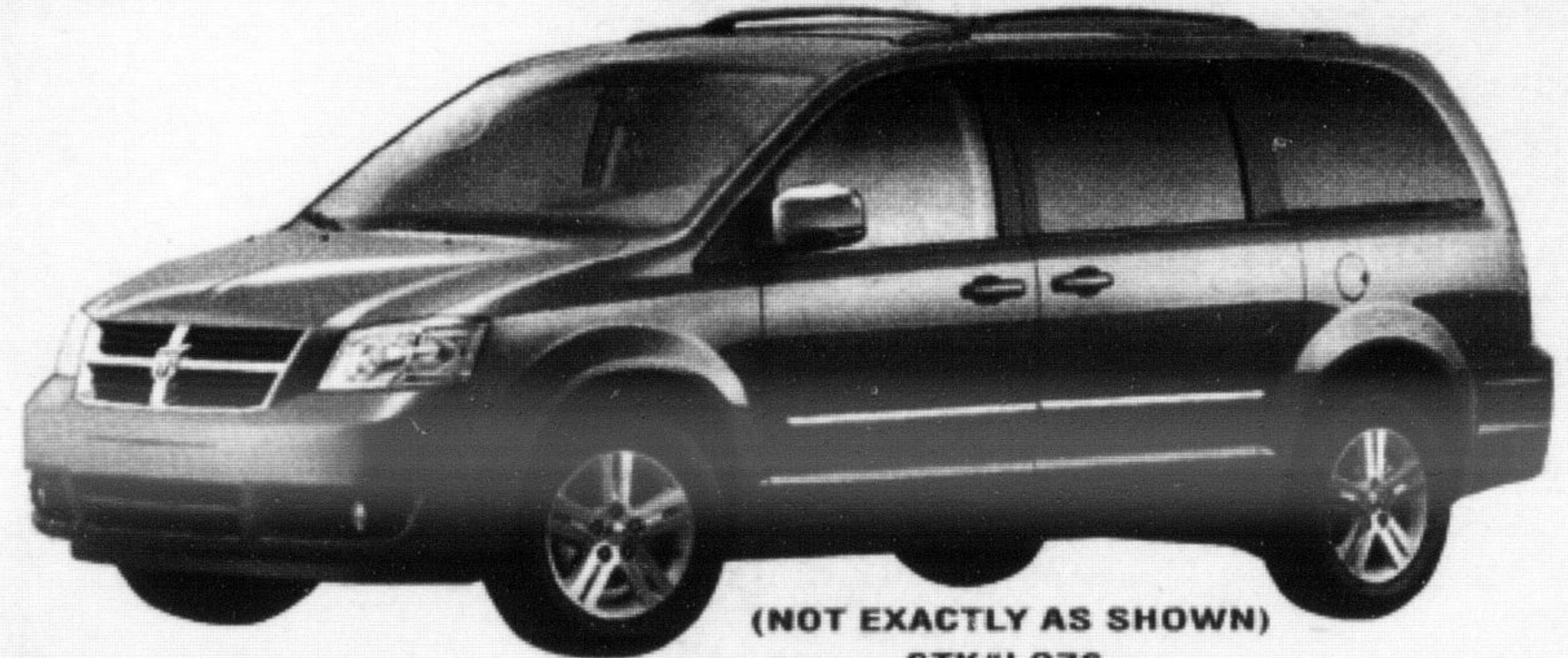
(NOT EXACTLY AS SHOWN) STK#LG76