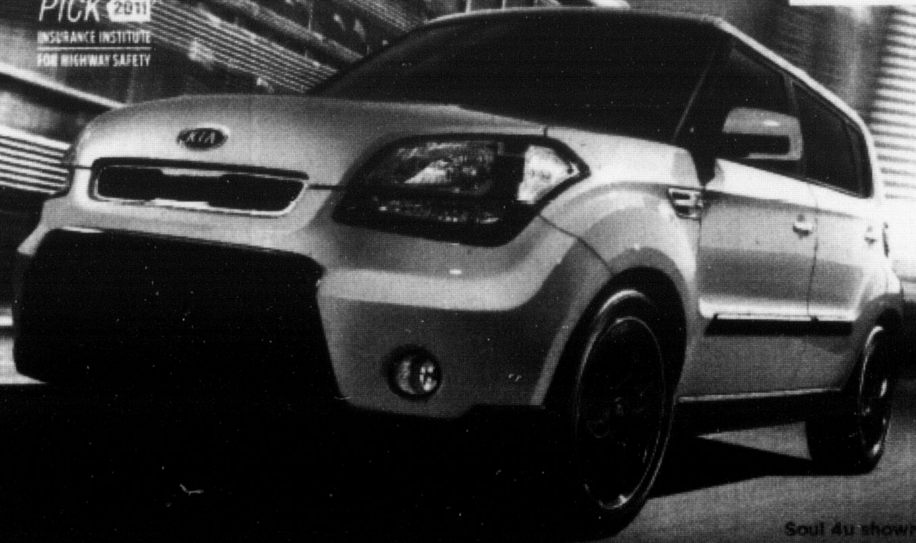
Soul 4x shown*