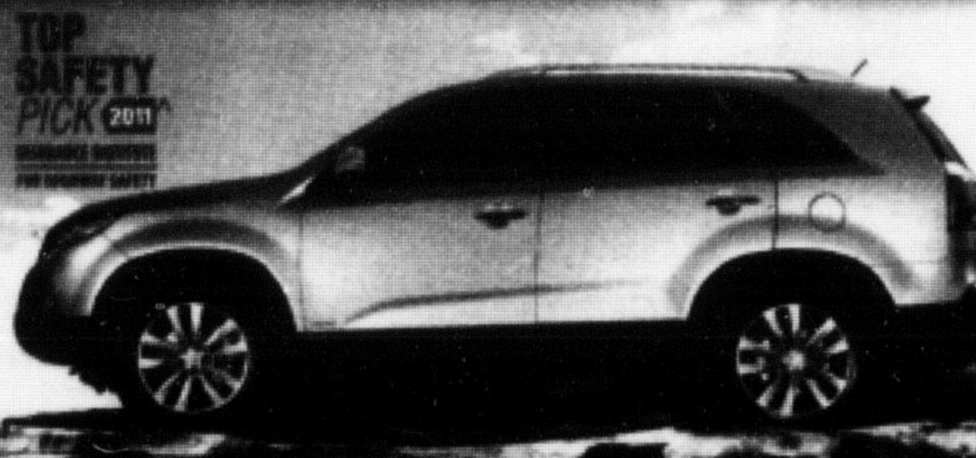
Sorento EX-V6 Luxury shown