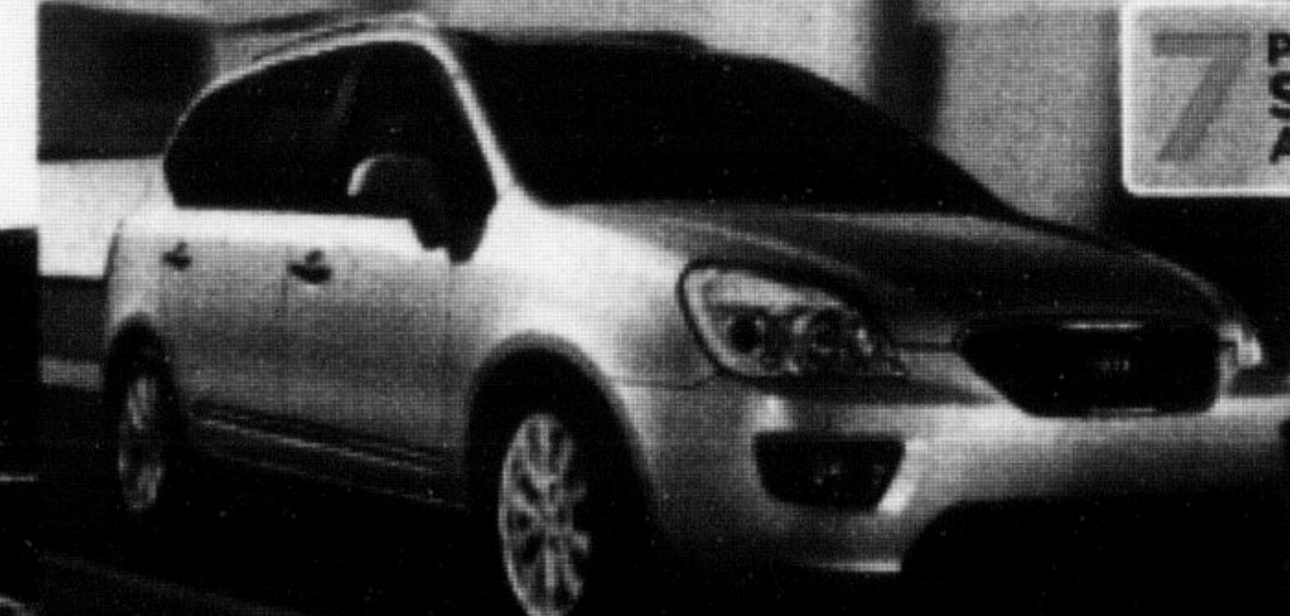
Rondo EX-V6 shown