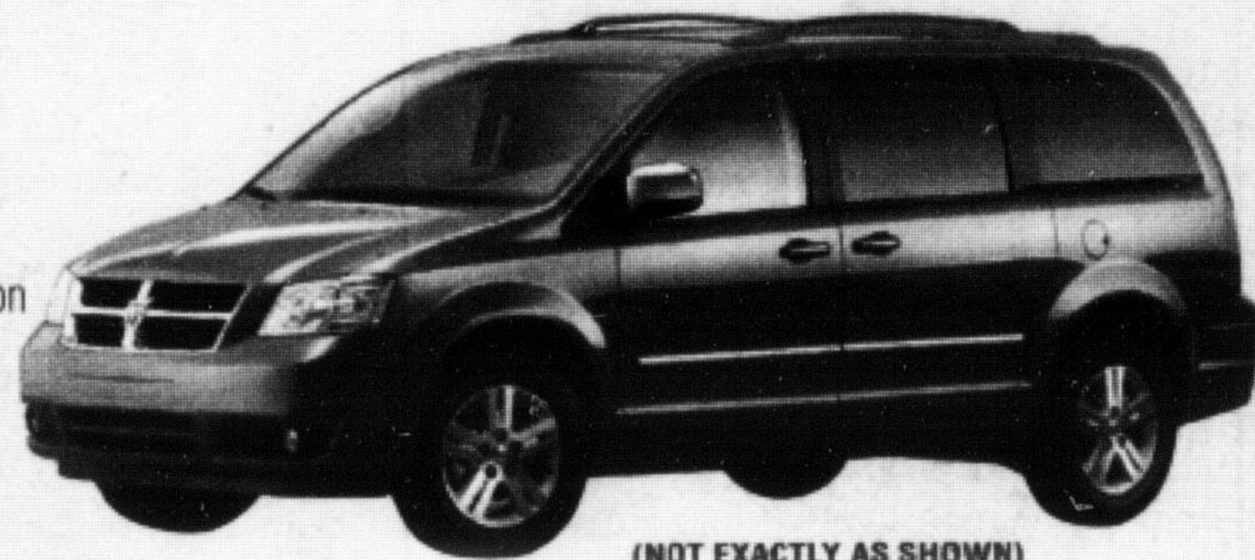
(NOT EXACTLY AS SHOWN) STK#LG76