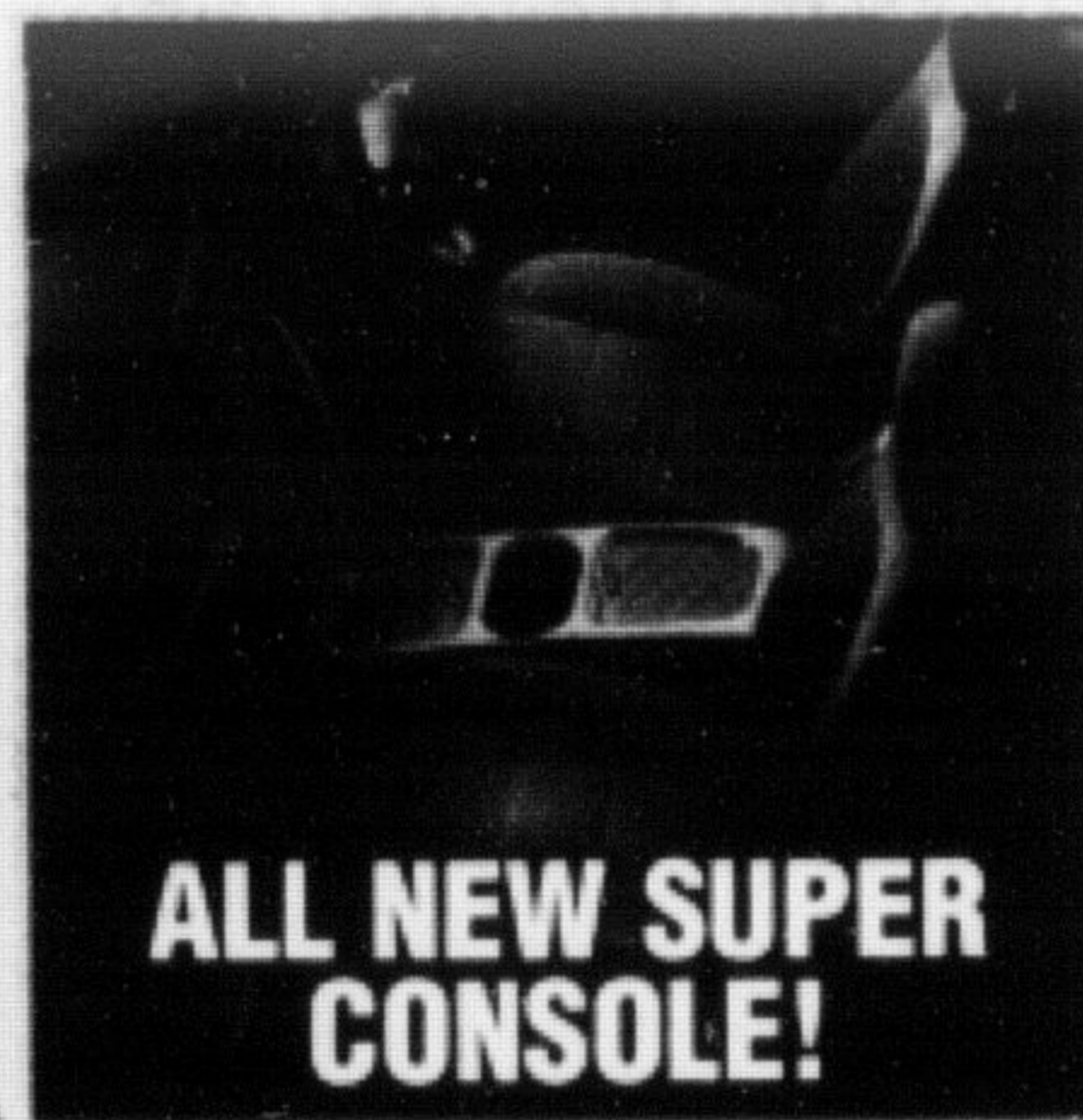
ALL NEW SUPER CONSOLE!