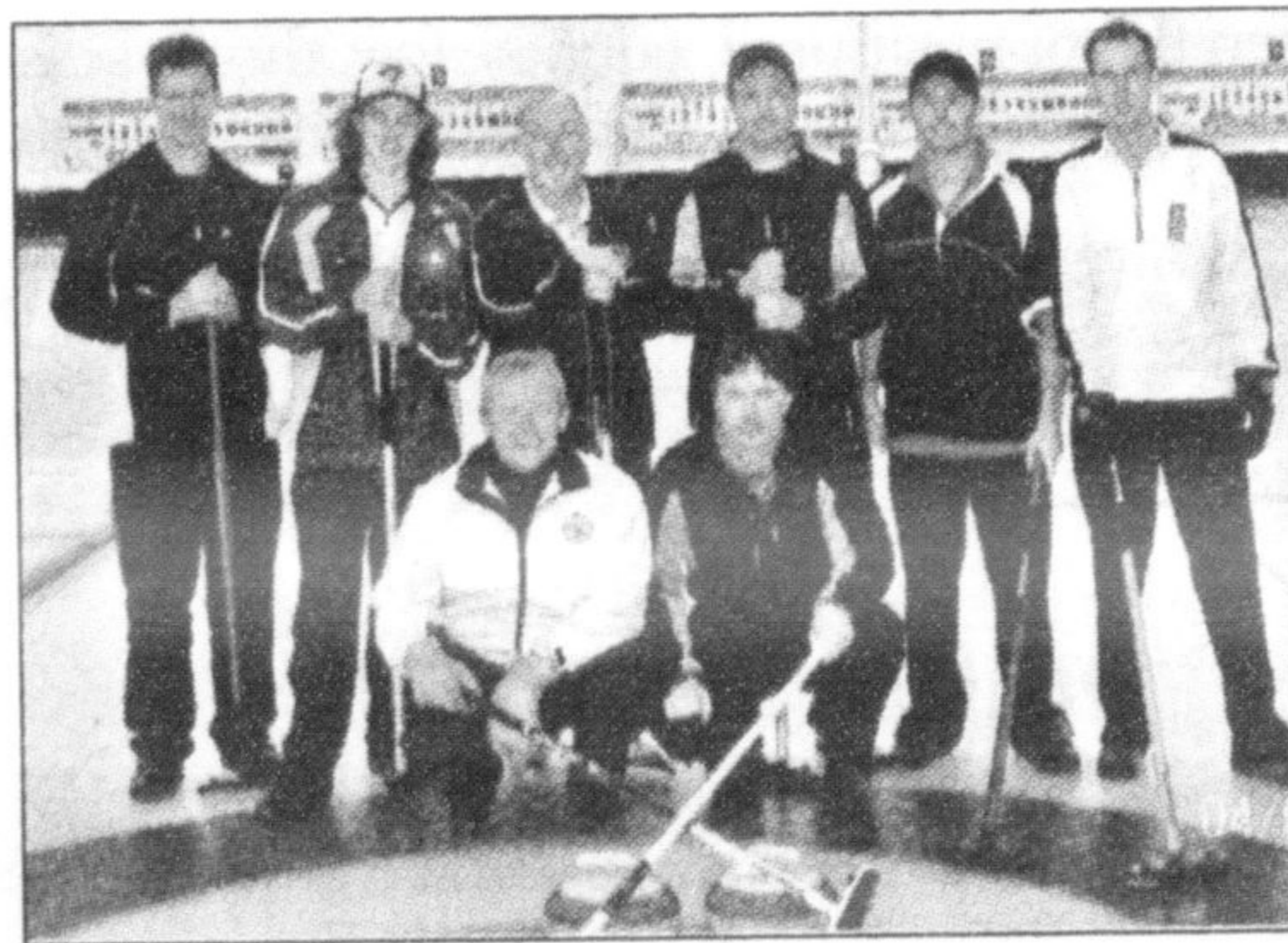
WE'RE #1: Milton curlers celebrate their victory.