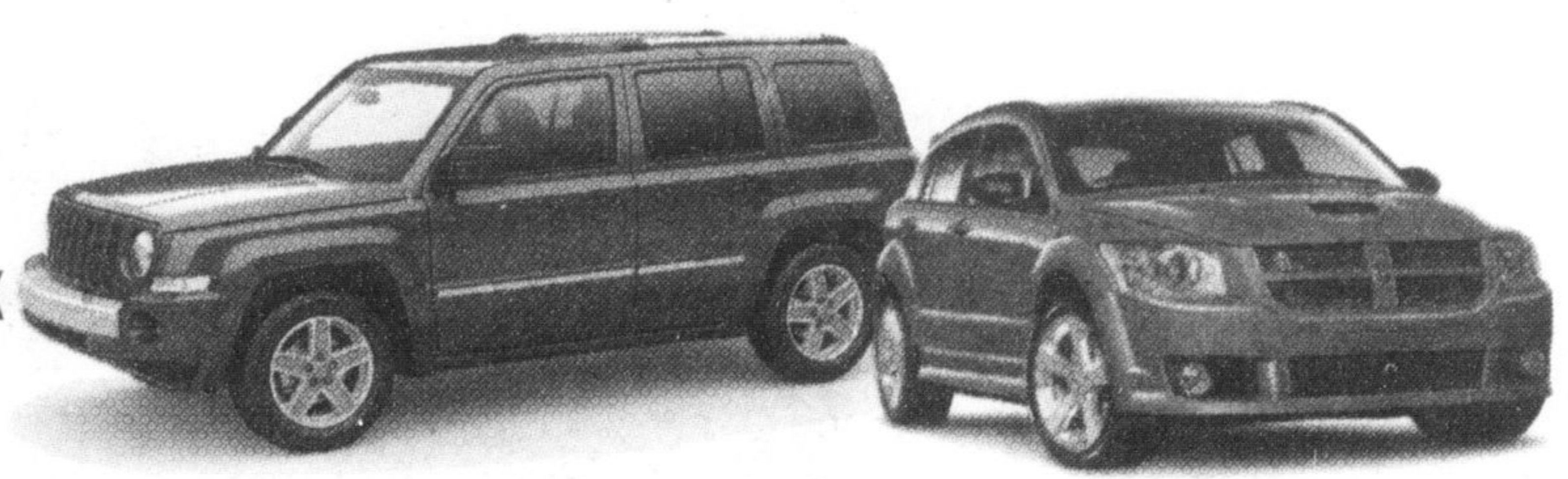
2009 Patriot 2009 Caliber SXT

Your Choice! $750 CASH BACK OR 4.99% FINANCING †60 Mths