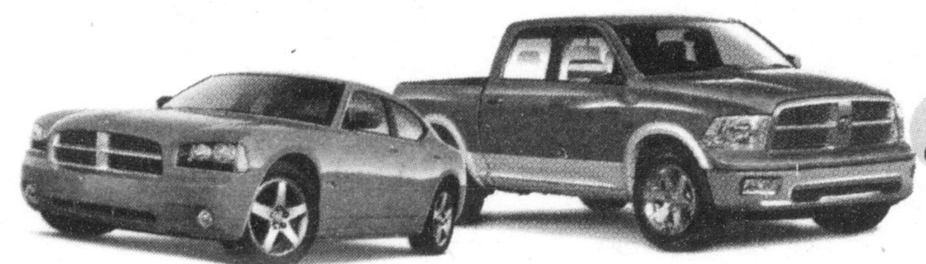
2009 Charger 2009 Ram 1500

Your Choice! $9,000 CASH BACK OR $3,750 REBATE + 0% FINANCING †60 Mths