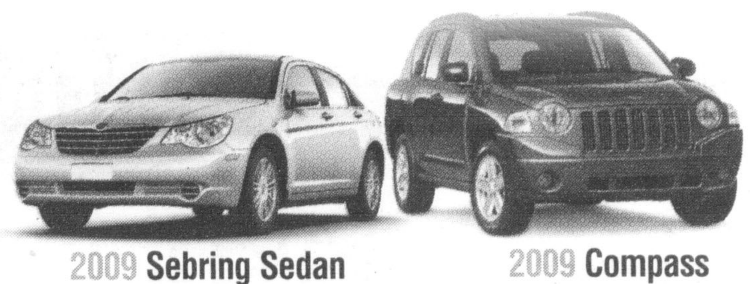
2009 Sebring Sedan 2009 Compass

Your Choice! $1,750 CASH BACK OR $500 REBATE + 3.99% FINANCING †48 Mths