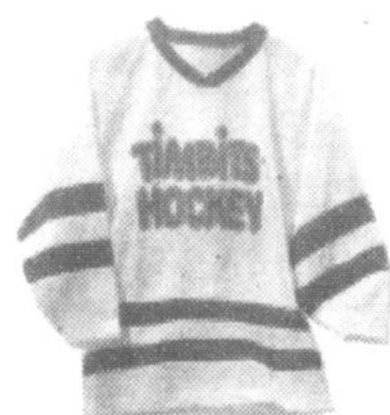
The first goal is having fun.

In Timbits Hockey, having fun is always part of the game plan - along with making new friends, learning a few life lessons and discovering a love for the game. Tim Hortons is proud to support the 225 boys and girls who play Timbits Hockey in Milton.