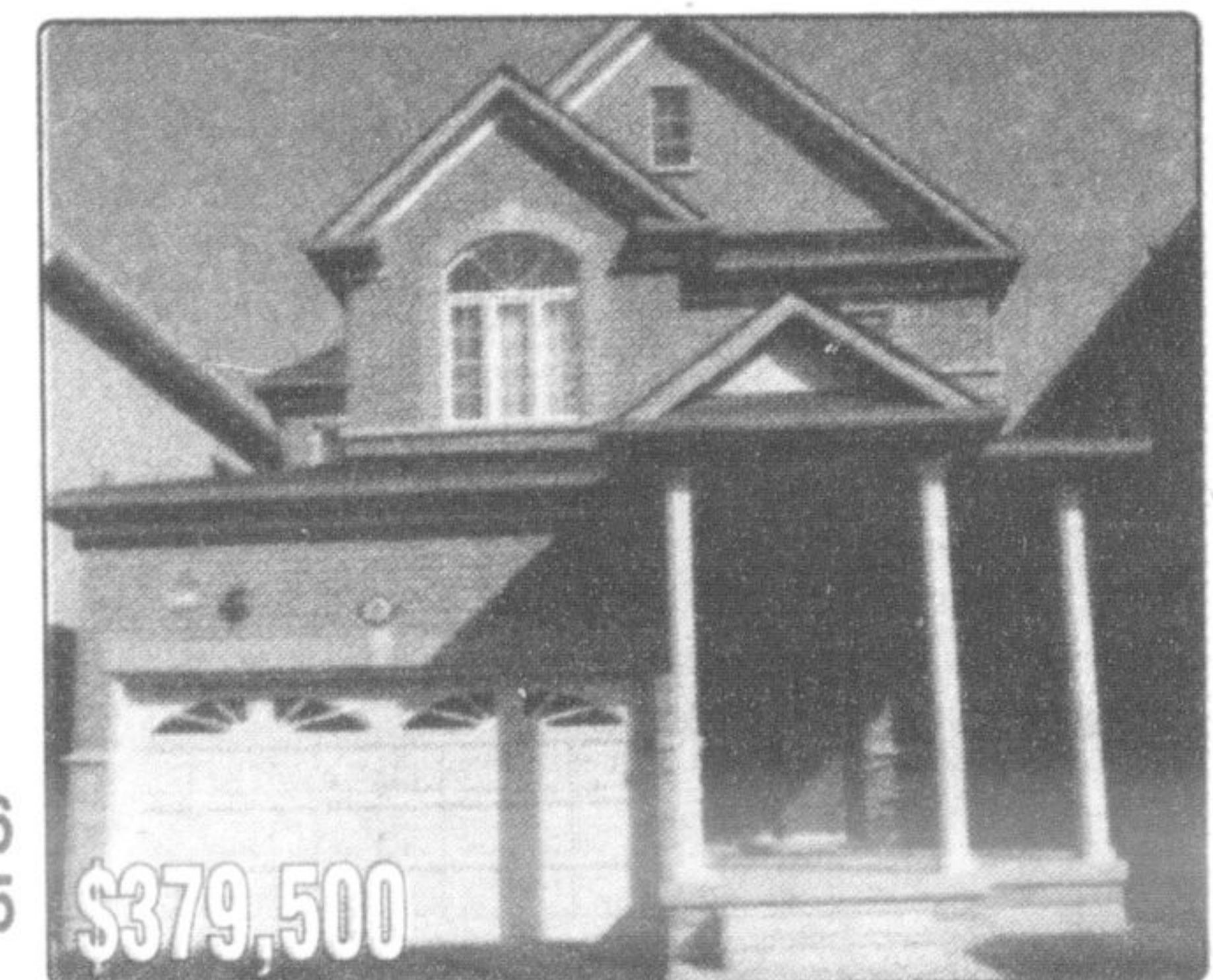
365 SPROAT ST.

www.raccohomes.com TOP 1% IN CANADA for Royal LePage