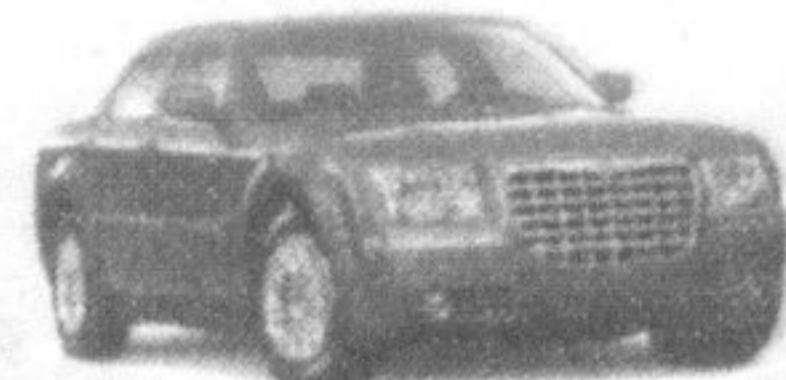
2008 CHRYSLER 300 C HEMI