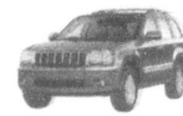
2008 JEEP GRAND CHEROKEE DIESEL