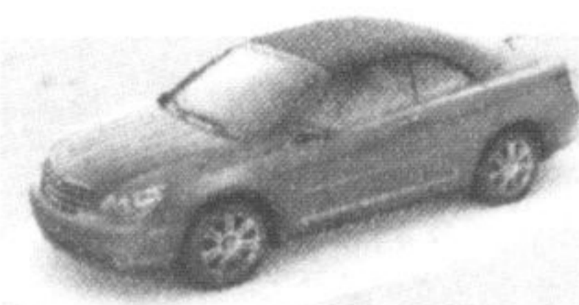
2008 CHRYSLER SEBRING CONVERTIBLE

CASH REBATE or 0% FINANCING FOR 60 MONTHS. PLUS NO PAYMENT FOR 90 DAYS!