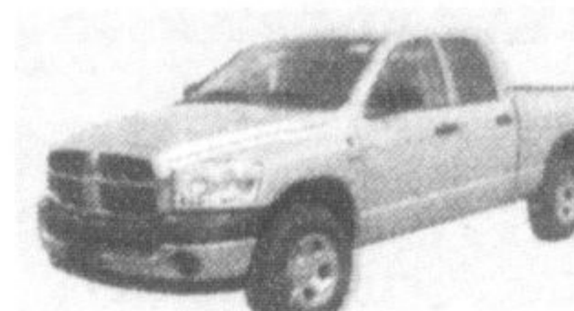
2008 DODGE QUAD CAB