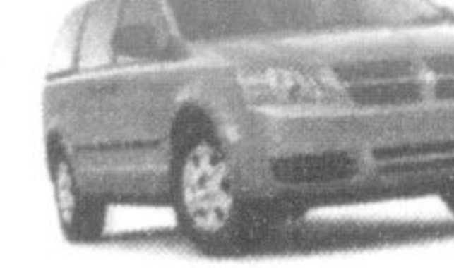
2009 DODGE GRAND CARAVAN 24F Value Package