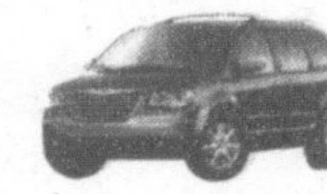
2009 CHRYSLER TOWN & COUNTRY