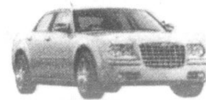
2008 CHRYSLER 300 TOURING