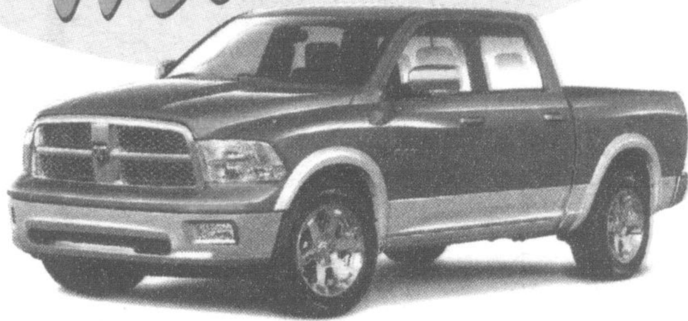
2009 DODGE RAM 1500

CASH REBATE OF $2,250* Plus! BONUS CASH OF $1,500*