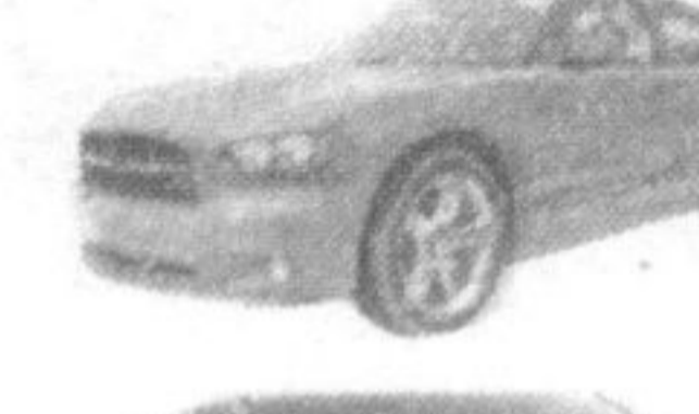
2009 DODGE CHARGER