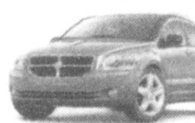
2009 DODGE CALIBER

CASH REBATE $3,000* 0% FINANCING FOR 48 MTHS