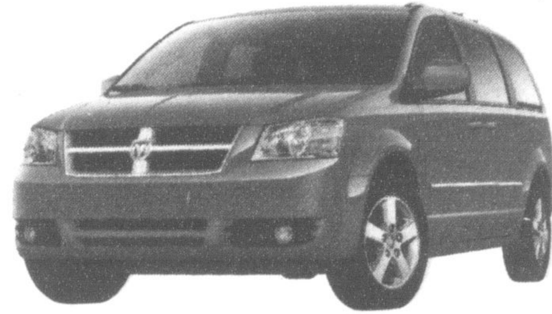
2009 DODGE GRAND CARAVAN 25th Anniversary Package

CASH REBATE OF $2,250* Plus! BONUS CASH OF $1,500*