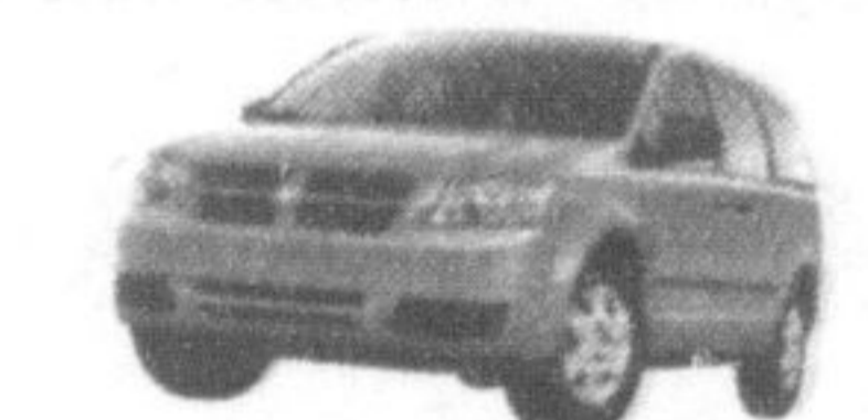
2008 DODGE GRAND CARAVAN SE