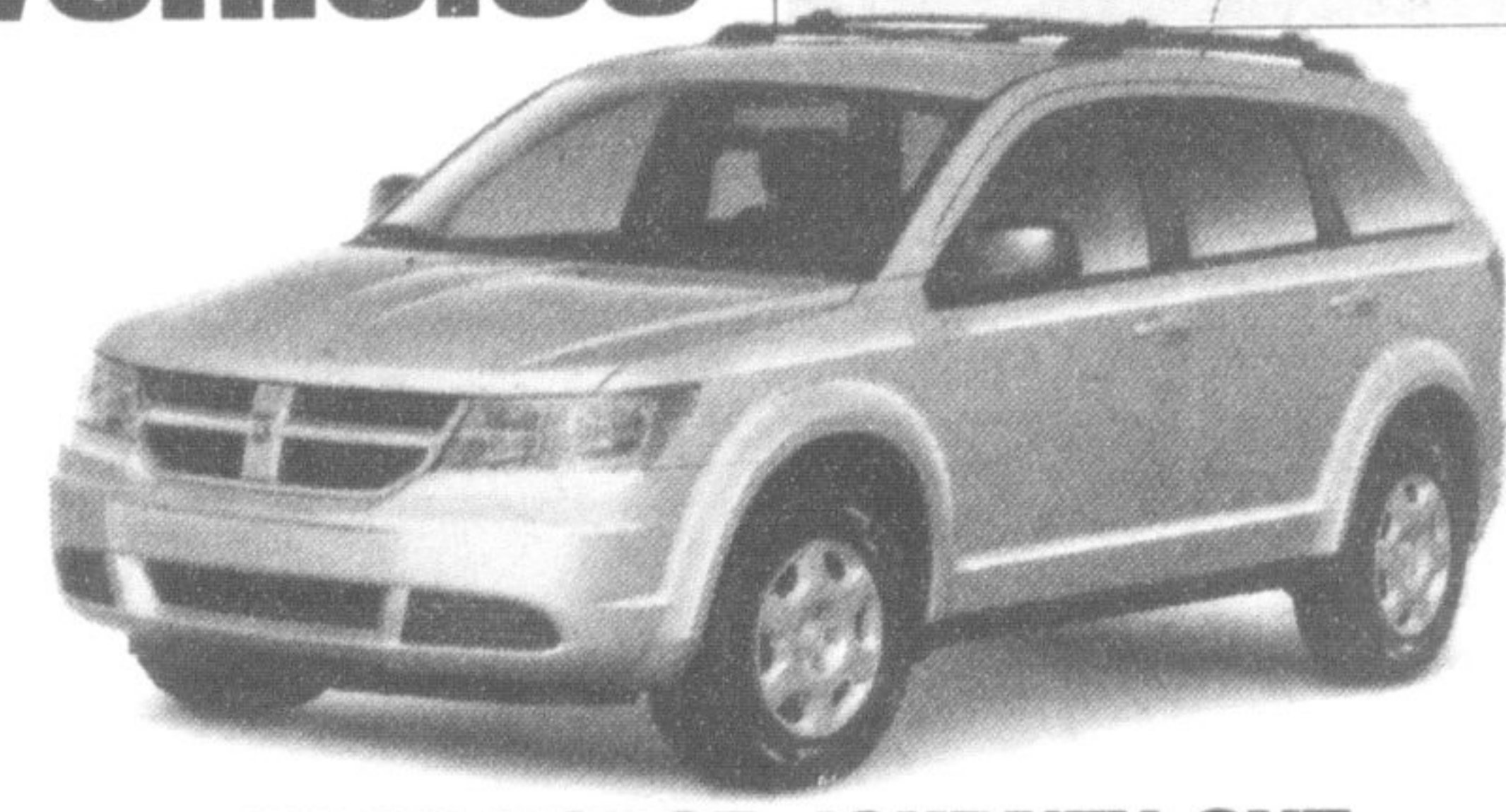
2009 DODGE JOURNEY SXT

CASH REBATE OF $6,700* Plus! BONUS CASH OF $1,000*