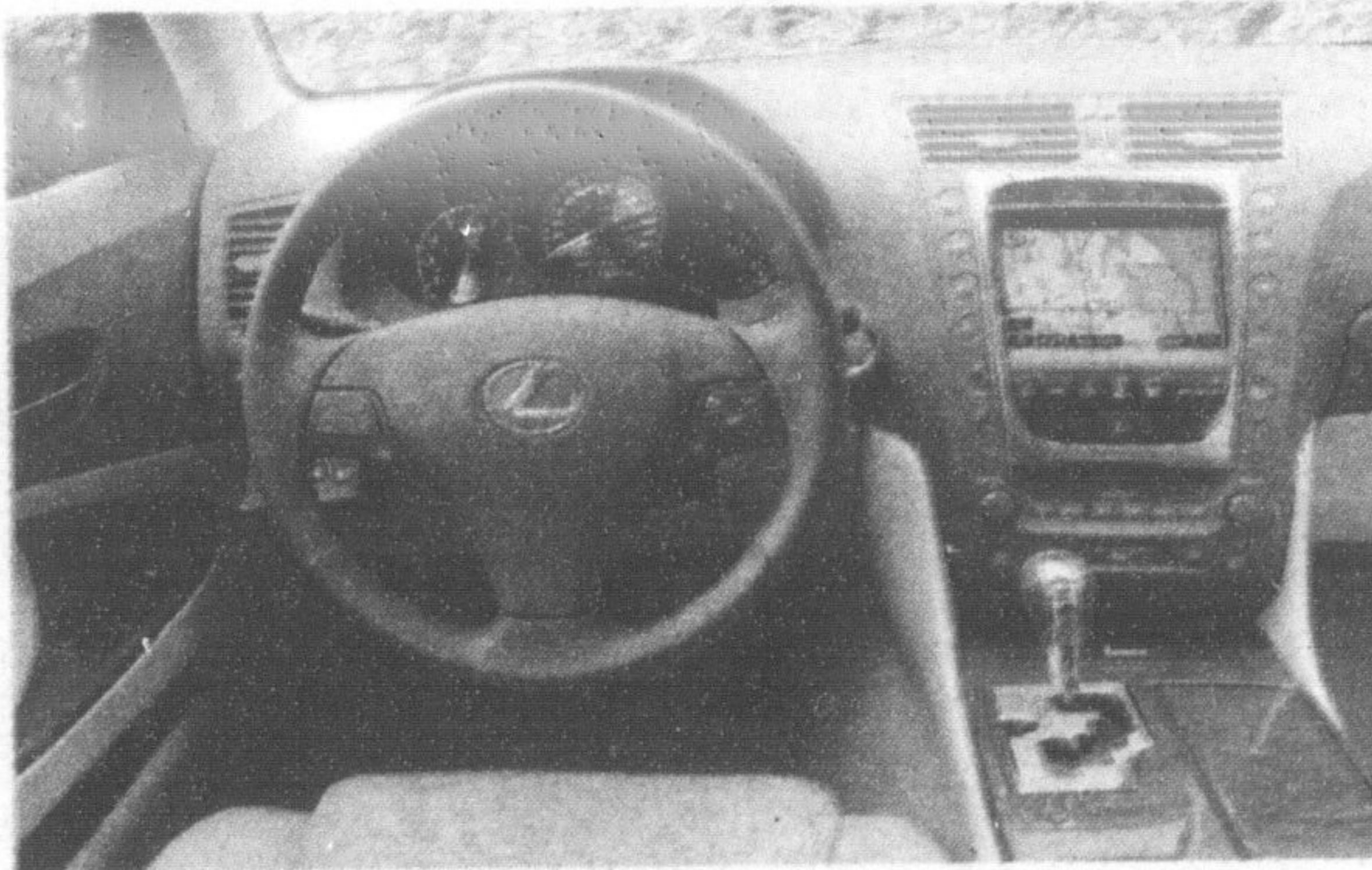
faced gauge cluster. My tester's mix of cream and dark gray textures, brushed metal and chrome highlights accenting the

The GS interior in comfortable but taller drivers will feel the seat does not sink far enough into the floor. The cabin is well appointed but not overly ornate. The steering wheel is a little too plain-Jane for this level of product but it was set in front of a very sporty metal-