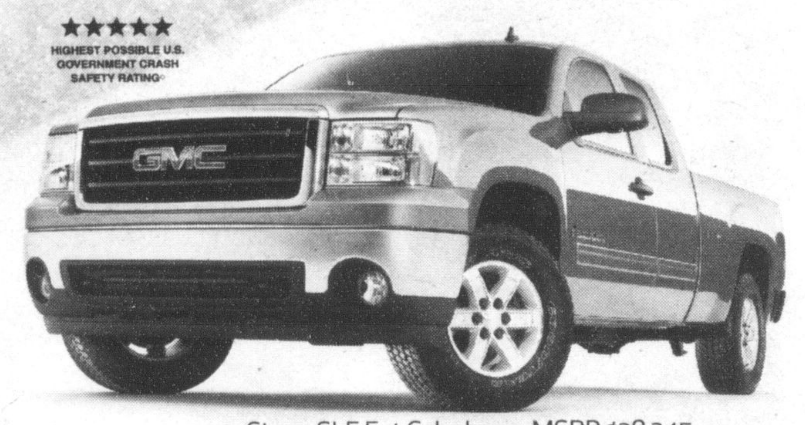
Sierra SLE Ext Cab shown, MSRP $38,345

GMC ACADIA WELL EQUIPPED WITH: • 3.6L 288 hp SIDI V6 VVT Engine • Traction Control • StabiliTrak™ Electronic Stability Control System • 8-passenger Seating • 18-in. Aluminum Wheels • OnStar® with 1 Year of the Directions & Connections Plan and Turn-by-Turn Navigation System • Ultrasonic Rear Parking Assist • Front-to-Rear Side Head Curtain Air Bags • Preferred Package: 6-way Power Driver's Seat, Heated Mirrors with Turn Signals, Leather-wrapped Steering Wheel with Sound System Controls and Bluetooth® Connectivity • Remote Keyless Entry System