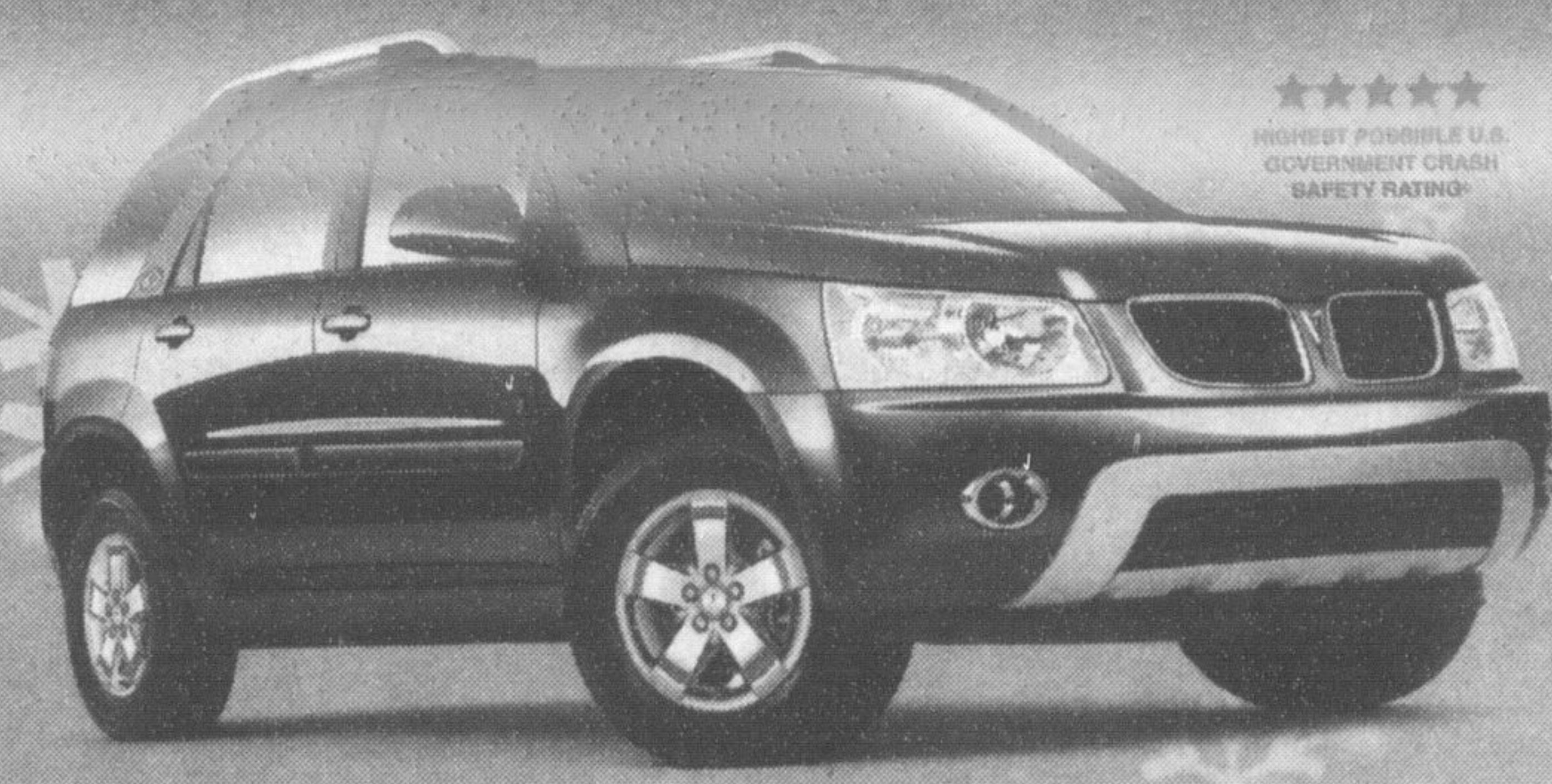
Torrent Podium Edition shown, MSRP $29,770