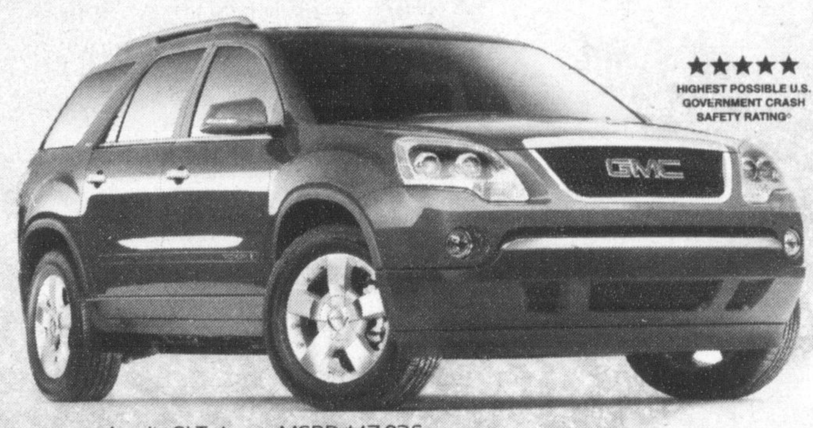
Acadia SLT shown, MSRP $47,836

Financing that fits. Ask about our finance offers with terms up to 72 months.