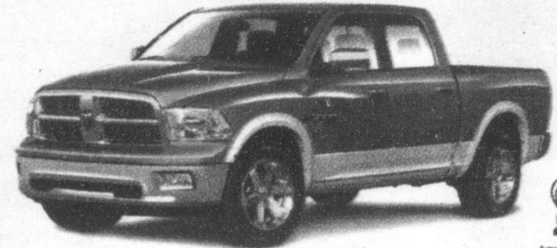
2009 TRUCK OF THE YEAR

Plus Financing As Low As 3.99% for 36 months