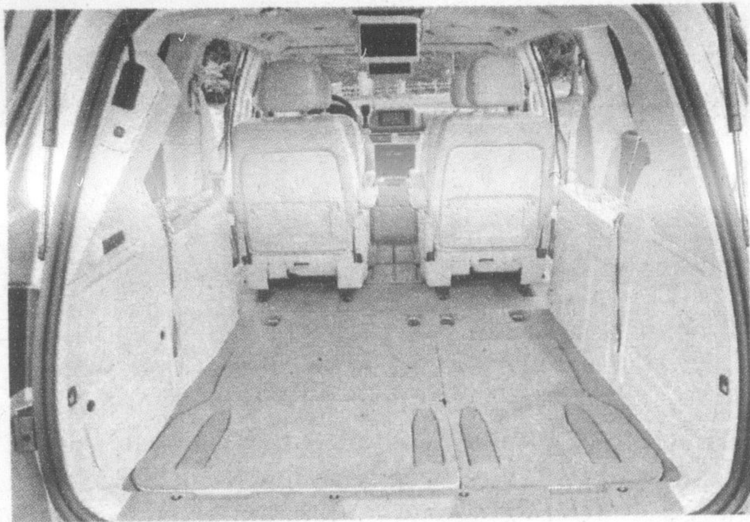
ABOVE: The third row seat folds below the cargo floor for unrestricted loading. The second row seats also fold or can be fully removed as shown.