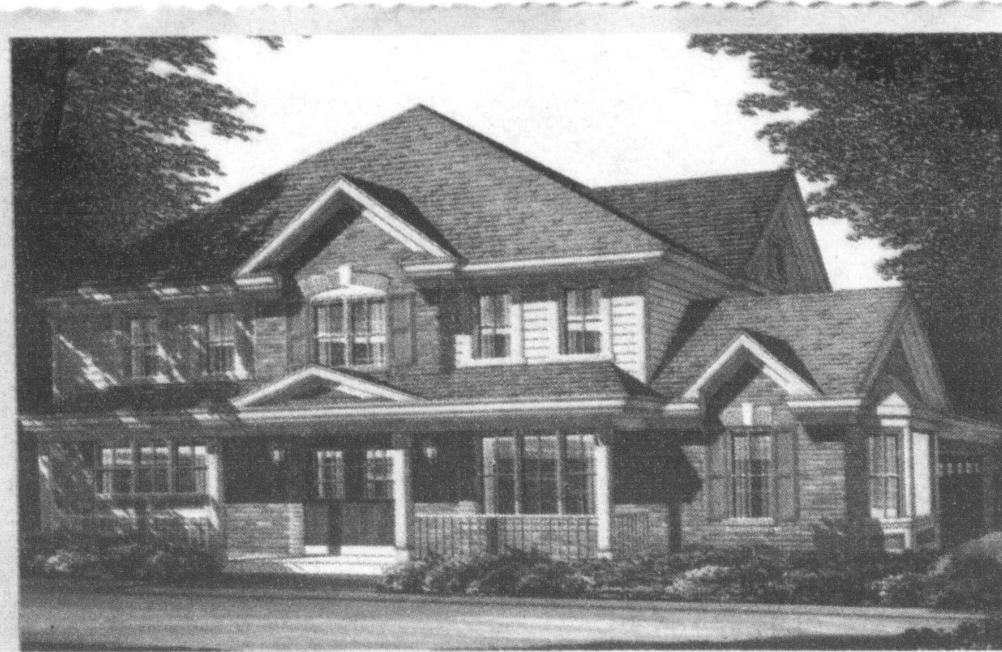
36' WideLot™, The Quincy II Corner 'A', 1,880 Sq.Ft., $366,990 NOW $356,990