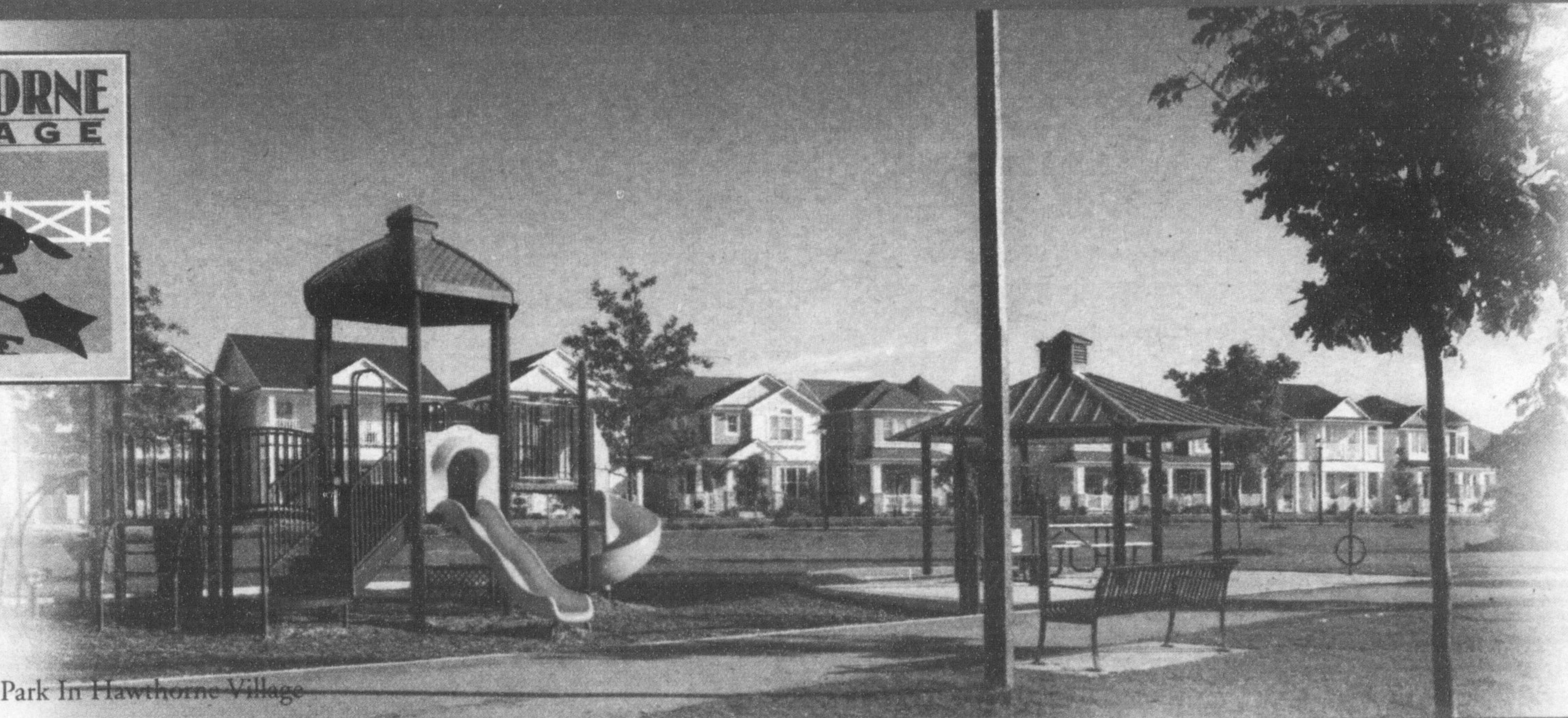
A Community Park In Hawthorne Village