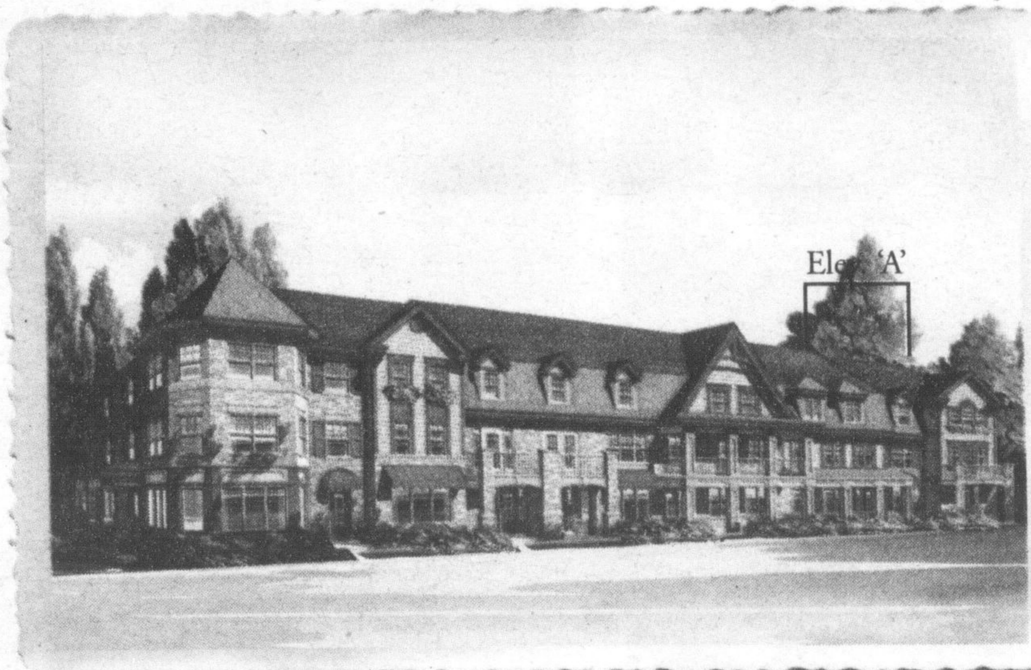
Main Street Townhome, The Ashberry 'A', 1,585 Sq.Ft., $274,990 NOW $269,990