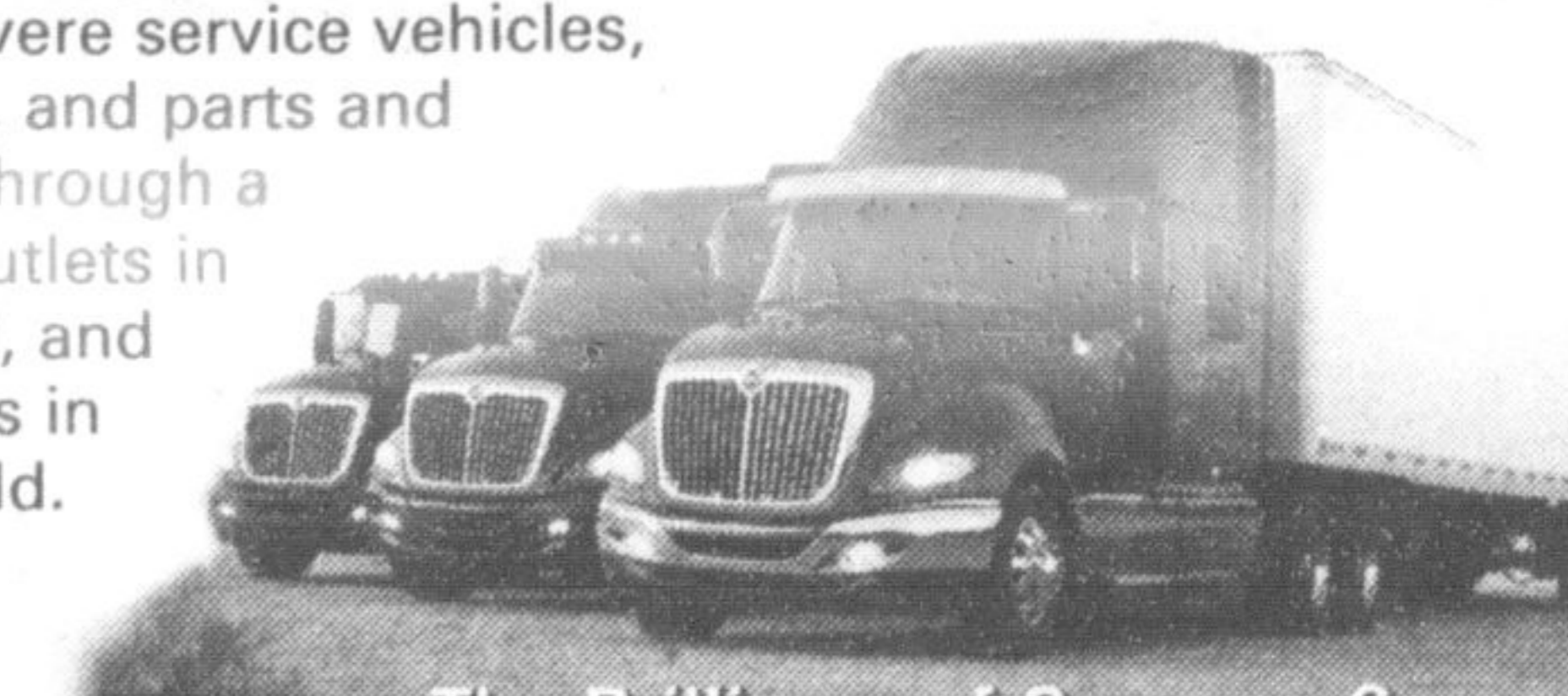
The Brilliance of Common Sense