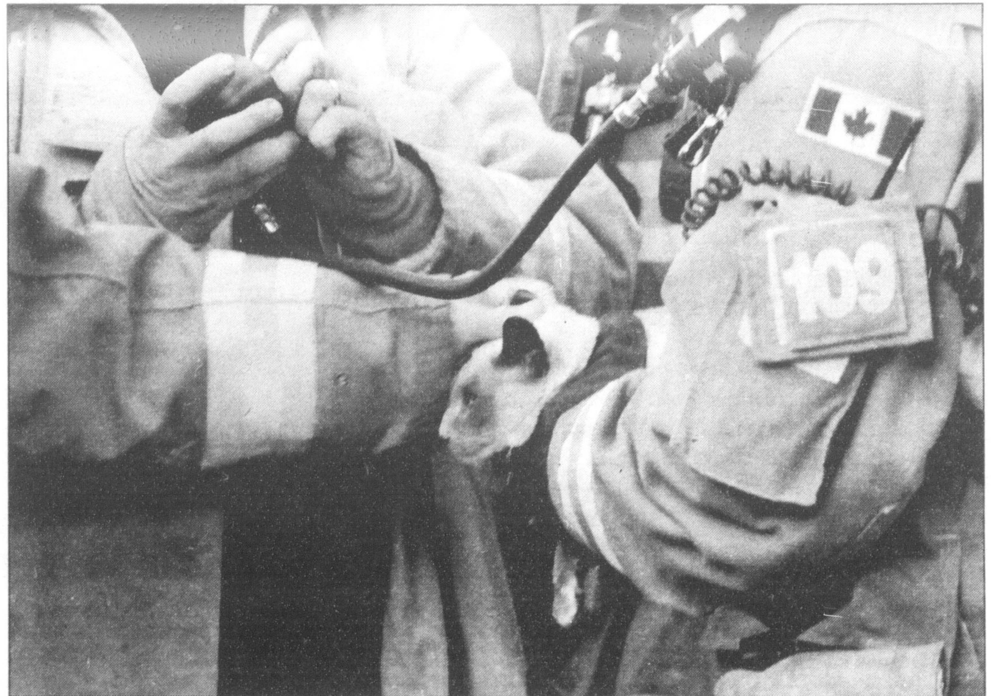
Firefighters tend to a cat following a house fire on Mill Street.

"The guys did a good job putting out the fire. There was very little (water) damage," Ellis said.