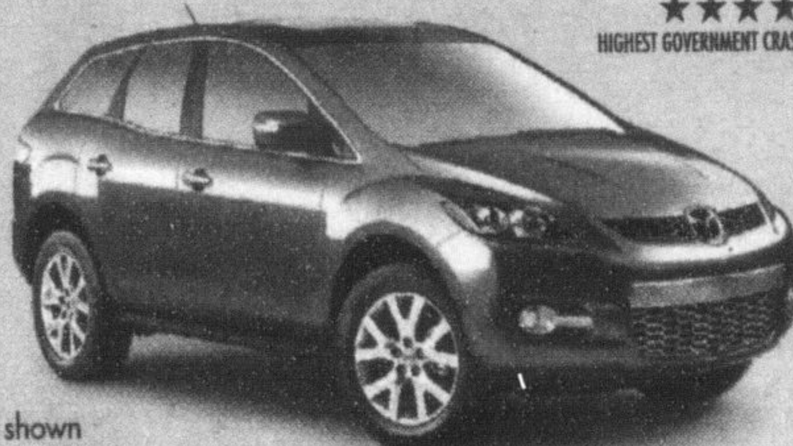
GT model shown

• All-new spirited, yet fuel-efficient 171-hp, 2.5 L, DOHC, 16-valve engine • Standard Traction Control System (TCS) and Roll-Over Stability Control (RSC) • Standard Dynamic Stability Control (DSC) and Anti-lock Brake System (ABS) • Standard remote keyless entry, air conditioning and heated door mirrors