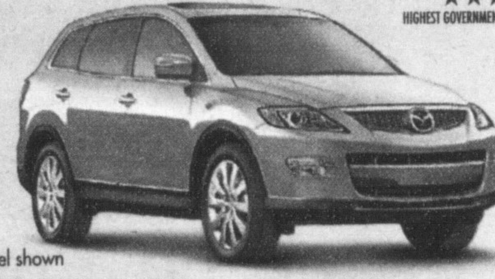
GT model shown

• 244-hp DISI (Direct Injection Spark Ignition) turbo engine • Runs on regular fuel • Standard 8-way, power-adjustable driver's seat • Standard 18" alloy wheels