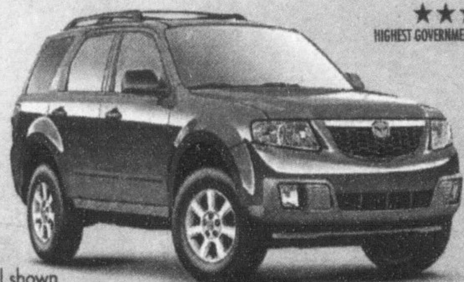
GT-V6 model shown

VALUE. EMOTION. ENGINEERING. We've re-priced 2009 Mazdas to be our lowest starting MSRPs of the 21st century! Which means you can get the Mazda you've always dreamed of. The same Mazda that will give you the performance and handling that get your heart racing. And cutting-edge safety that gives you peace of mind. The Mazda Driving Dividend. Zoom-Zoom. Forever. mazda.ca