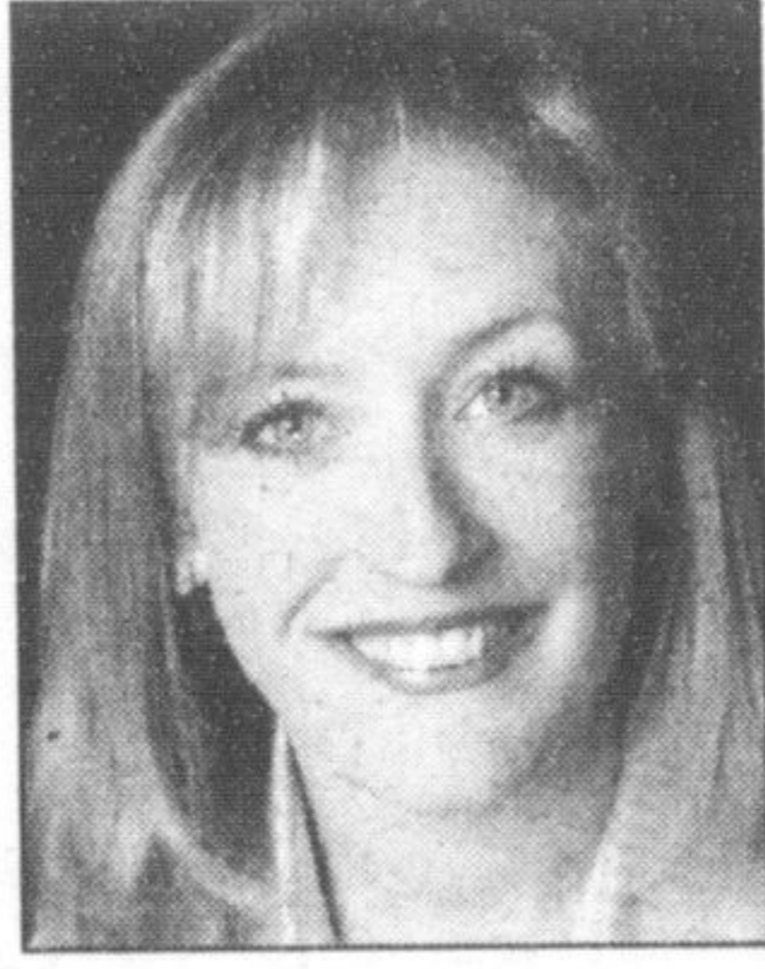
Lisa Raitt, Tory