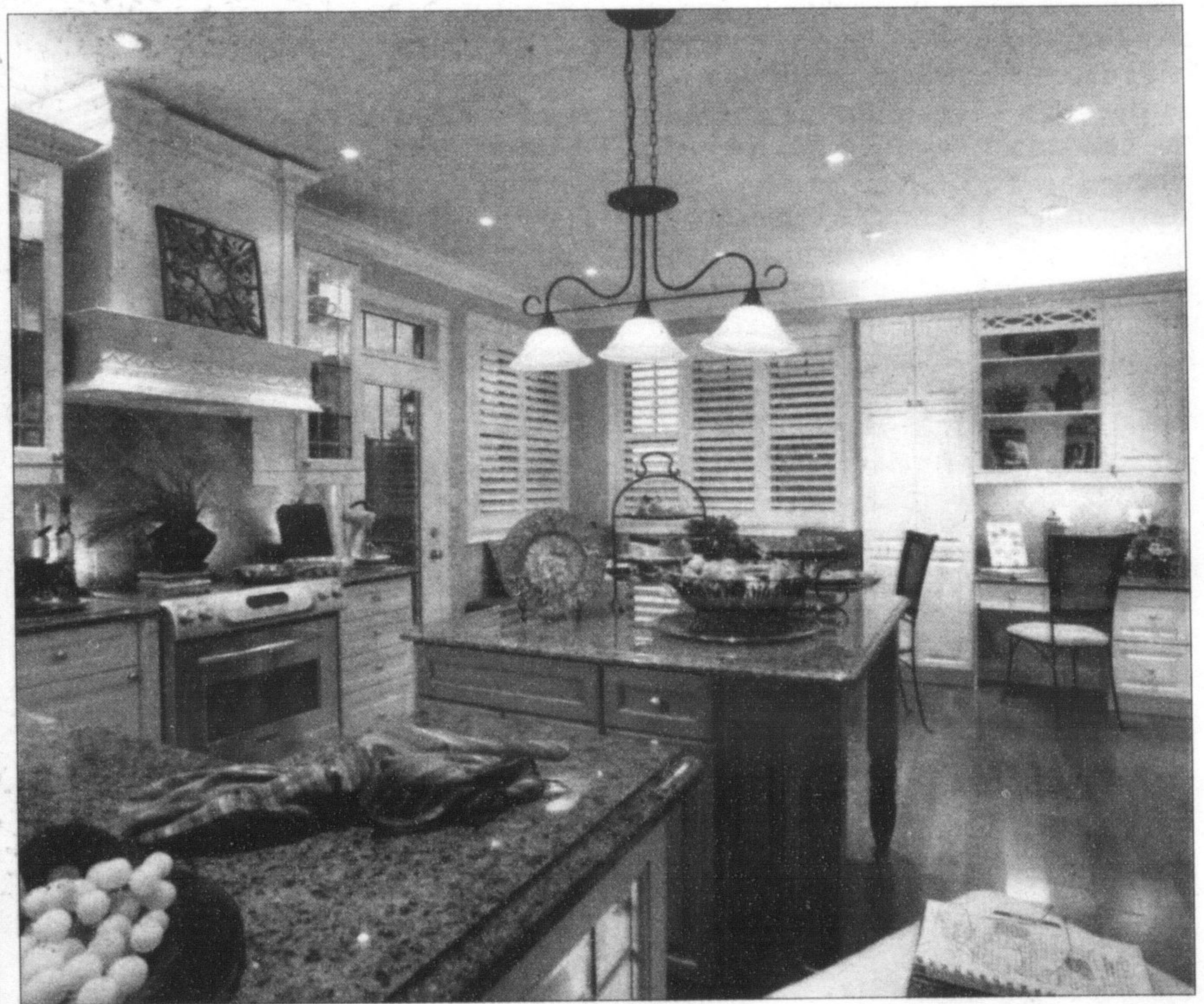
Mattamy Homes maintains its position as the largest builder in Canada, building more than 3,000 new homes last year alone.