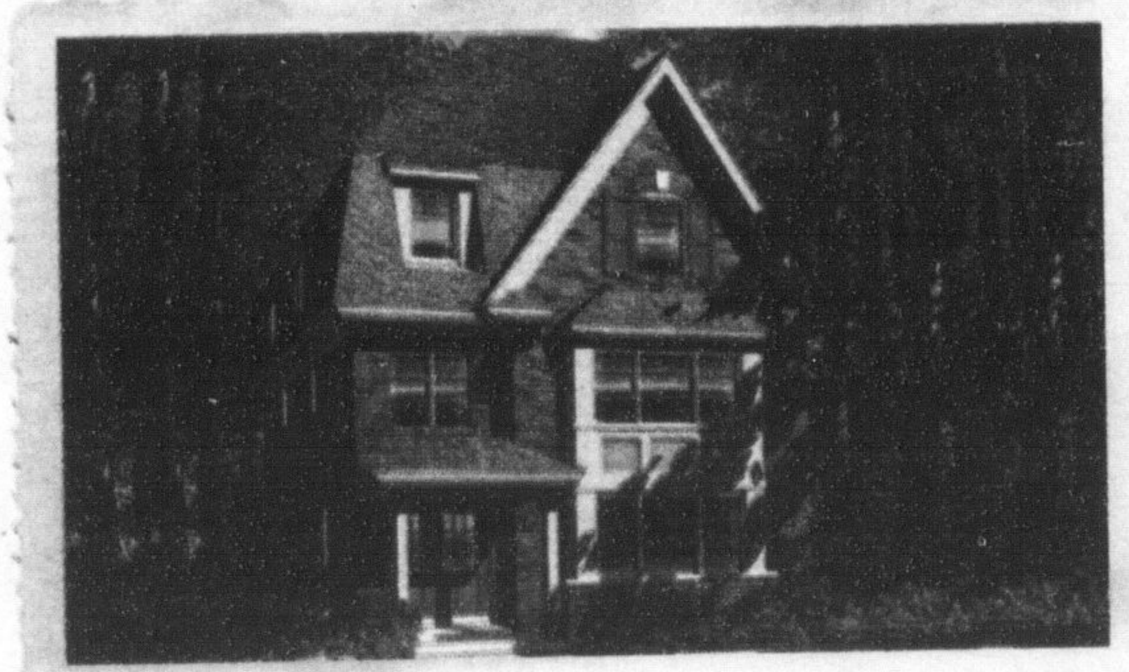
28' Detached Home, The Valleymore 'B', 2,285 Sq.Ft., $356,990 NOW $339,990