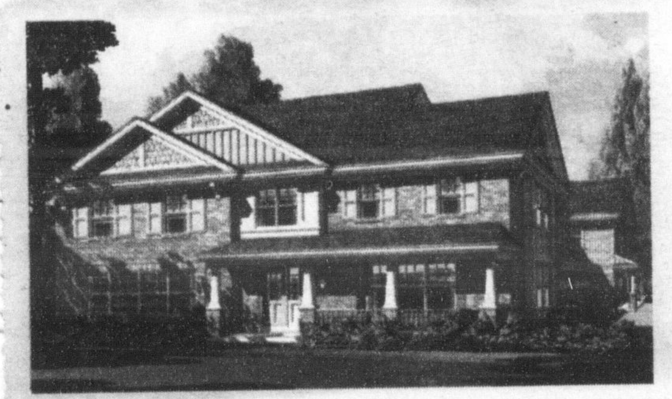
WideLot™ Semi, The Honeydale Corner 'A', 1,700 Sq.Ft., $327,990 NOW $317,990