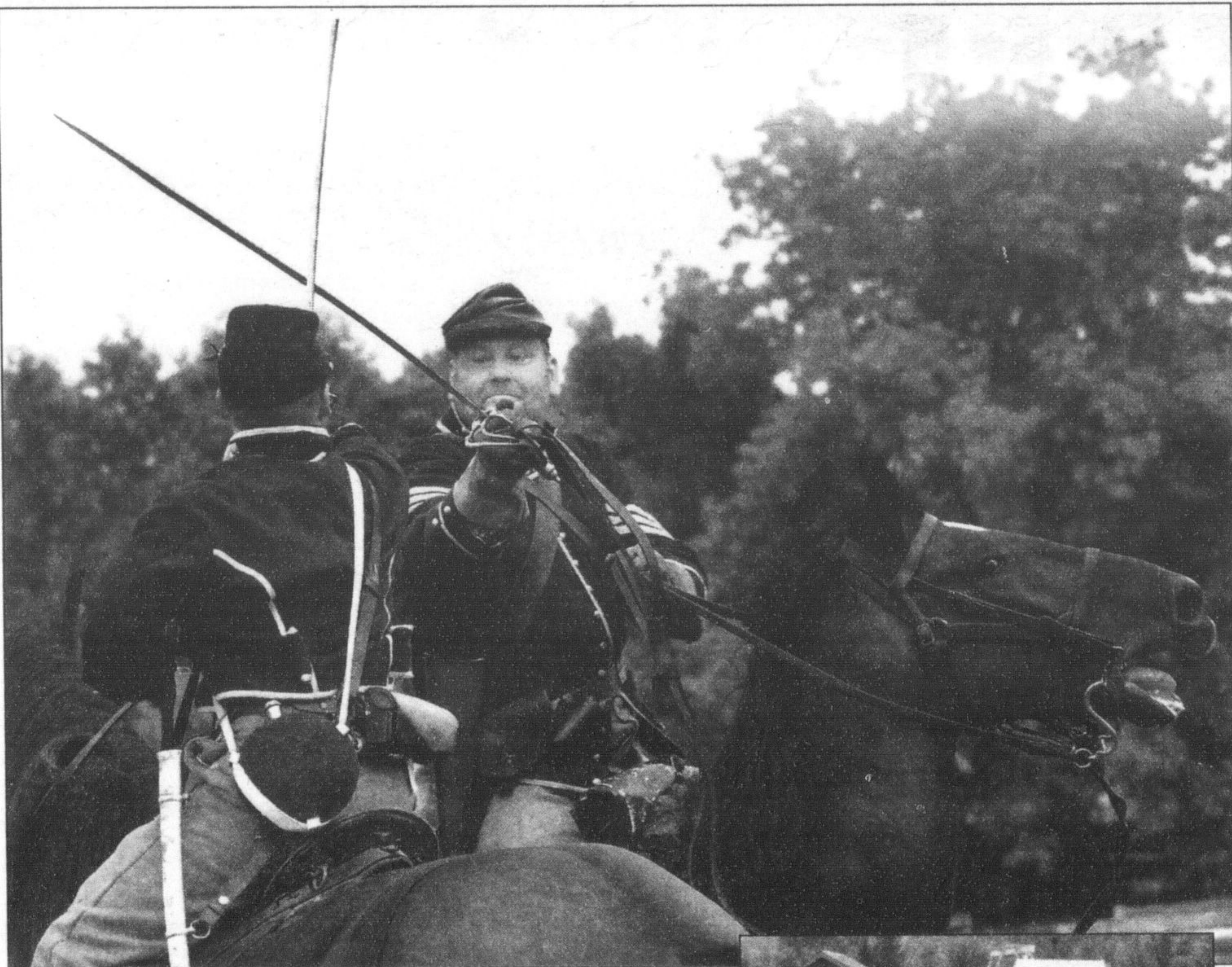
HISTORY COMES TO LIFE: Above, members of the cavalry from the northern troops put on a saber demonstration during Sunday's American Civil War Re-enactment at Country Heritage Park. At right, members of the 2nd Louisiana medical brigade wait for casualties from the afternoon battle. Below, the south's Donaldson Light Artillery members cover their ears as they fire a shot from their mountain rifled cannon.

For more information, call (905) 844-0252, ext. 28.