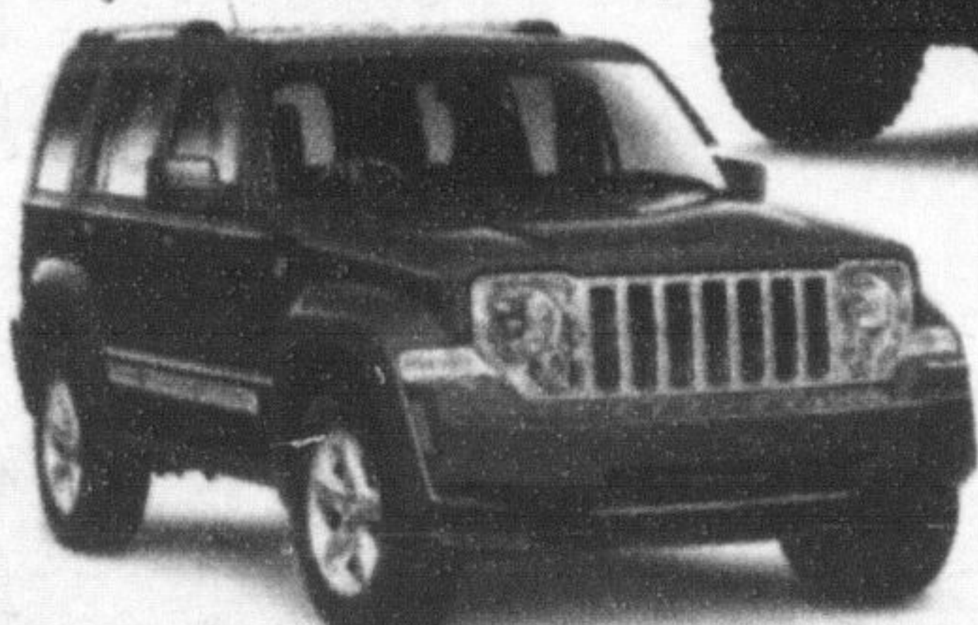
2008 Jeep Liberty

Indeed this is the final long weekend of the summer which means it's the final weekend of Chrysler's 2008 Model Summer Clearance Event.