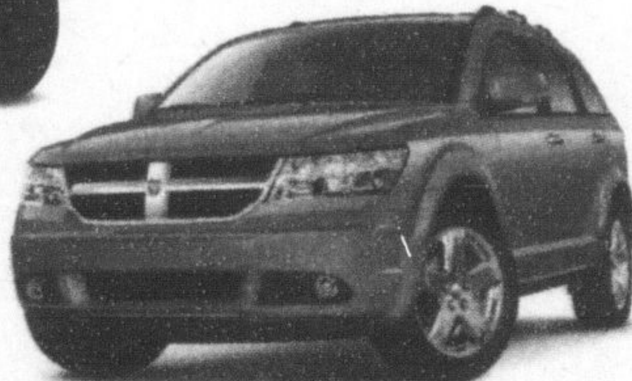
2009 Dodge Journey