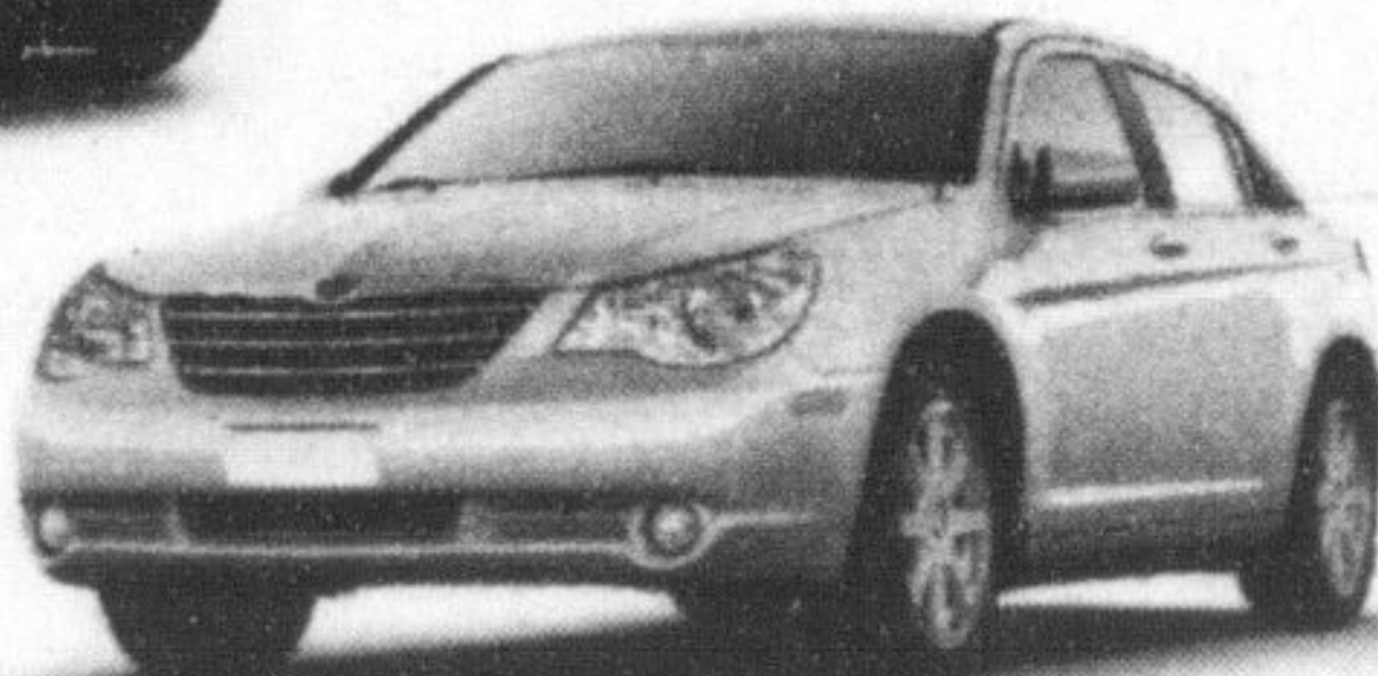
2008 Chrysler Sebring