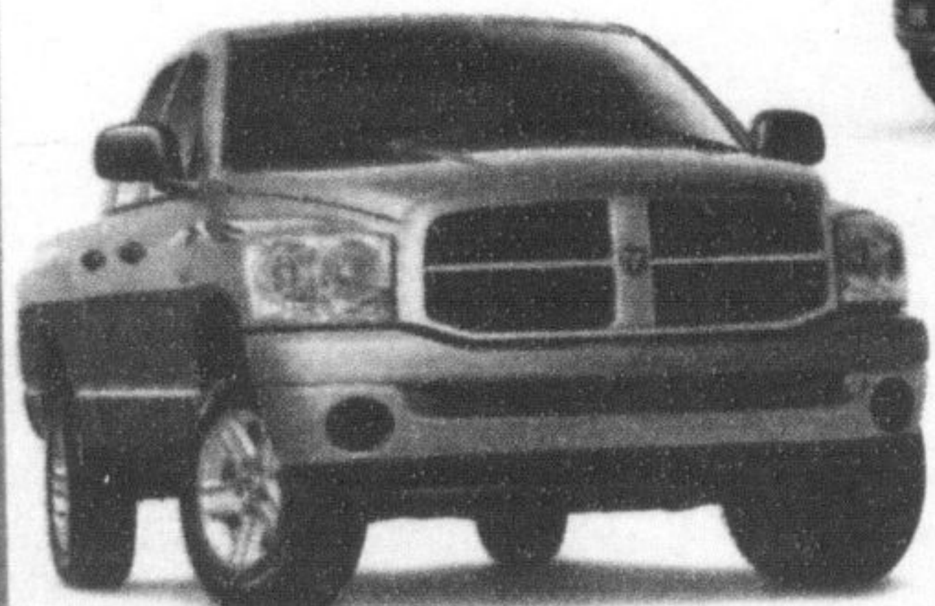
2008 Dodge Ram 1500