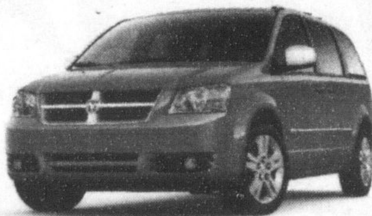
2008 Dodge Grand Caravan

2009 Dodge Challenger Starting from $24,888