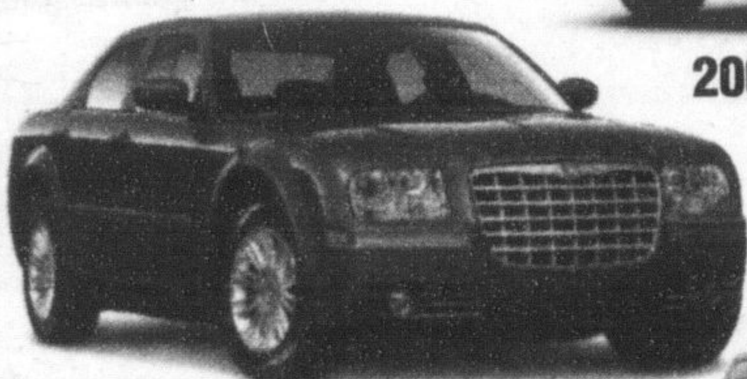
2008 Chrysler 300