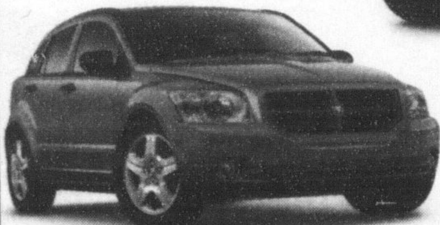
2009 Dodge Caliber