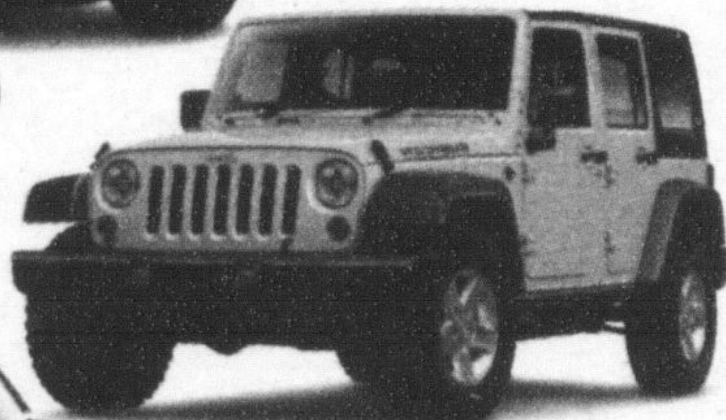
2008 Jeep Wrangler