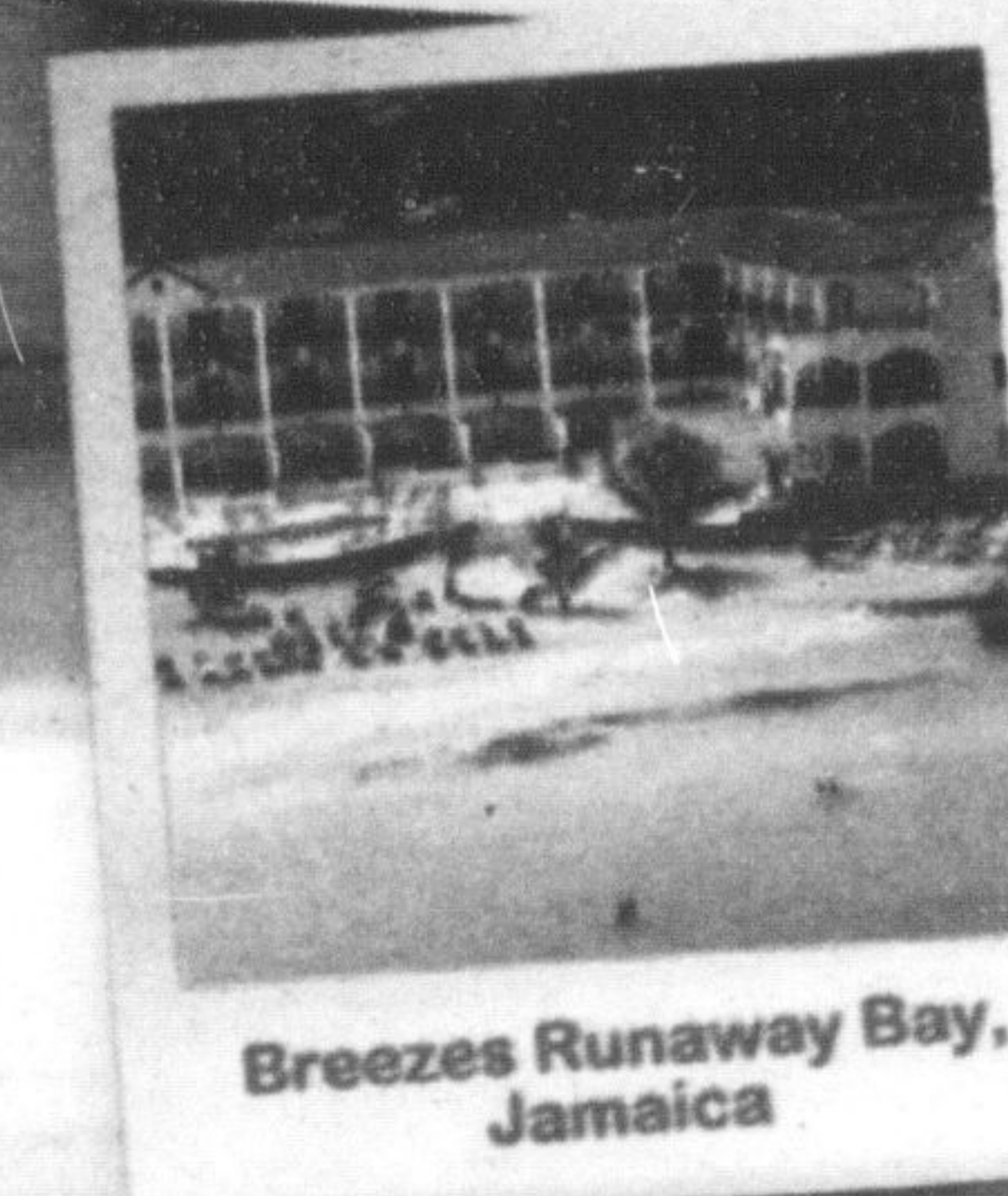
Breezes Runaway Bay, Jamaica

No purchase necessary. Contest open to Ontario residents 19 years of age or older. Ten (10) prizes will be awarded by random draw. Each prize is an 8-day, 7-night trip for 2 adults in Fall 2008: 2 to Breezes Bahamas, Nassau, departing Oct. 24, approx. value $1,685/person; 2 to Breezes Runaway Bay, Jamaica, Oct. 17 & 24 departures, approx. value $1,650/person; 1 to Breezes Montego Bay, Jamaica, departing Oct. 24, approx. value $1,370/person; 2 to Breezes Jibacoa, Varadero, Cuba, departing Oct. 8, approx. value $1,245/person; 2 to Breezes Puerto Plata, Dominican Republic, departing Oct. 24, approx. value $1,240/person; 1 to Breezes Bella Costa, Varadero, Cuba, departing Oct. 8, approx. value $1,035/person. Contest opens midnight June 9, 2008. Contest closes midnight Aug. 24, 2008. Odds of winning depend on the number of eligible entries received. Entrants must correctly answer, unaided, a mathematical skill-testing question to be declared a winner. To enter and for complete contest rules visit www.goldbook.ca.