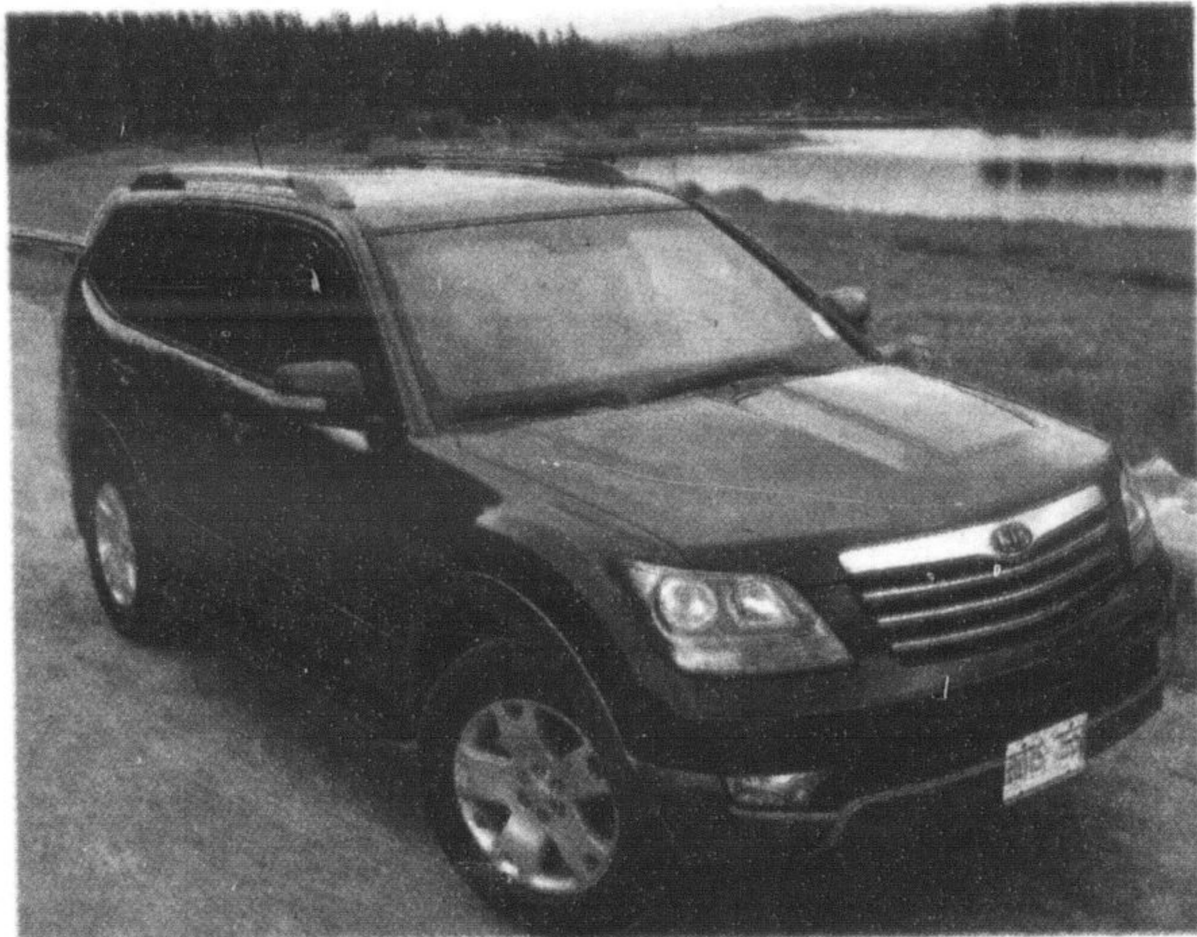
Whether in the heart of the city or in the heart of Alberta's cattle country, the 2009 Kia Borrego seven-seat SUV can handle just about any terrain thrown at it.