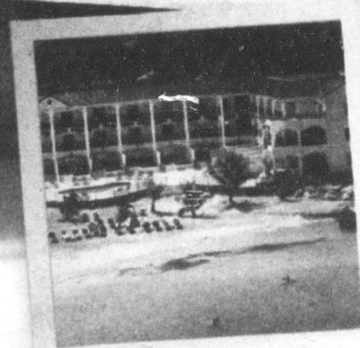
Breezes Runaway Bay, Jamaica

tripcentral.ca the smarter way to plan travel