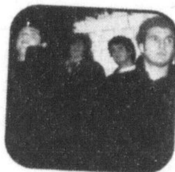
THE RANDALLS Sunday, June 29th

Racing starts at 7:30 p.m., complete concert listings are available at www.WoodbineEntertainment.com .