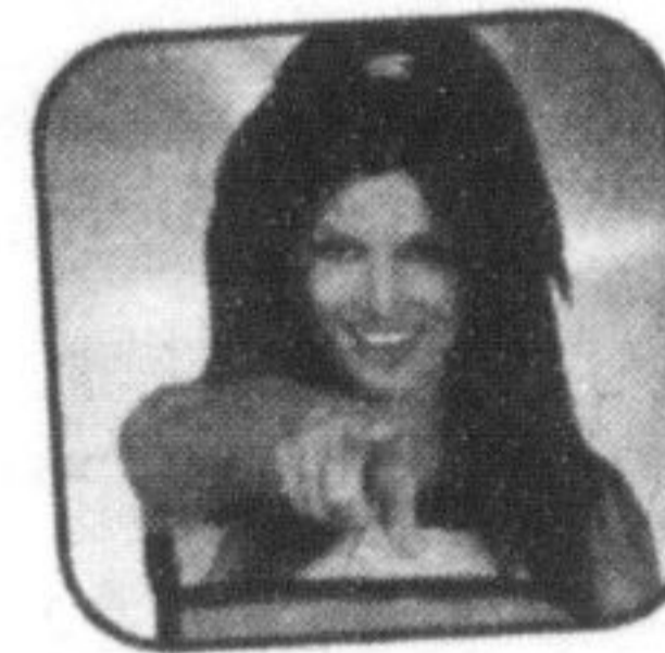
SHANIA TWIN Tribute to Shania Twain Sunday, July 13th