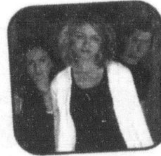
THE HIGGINS Sunday, July 6th