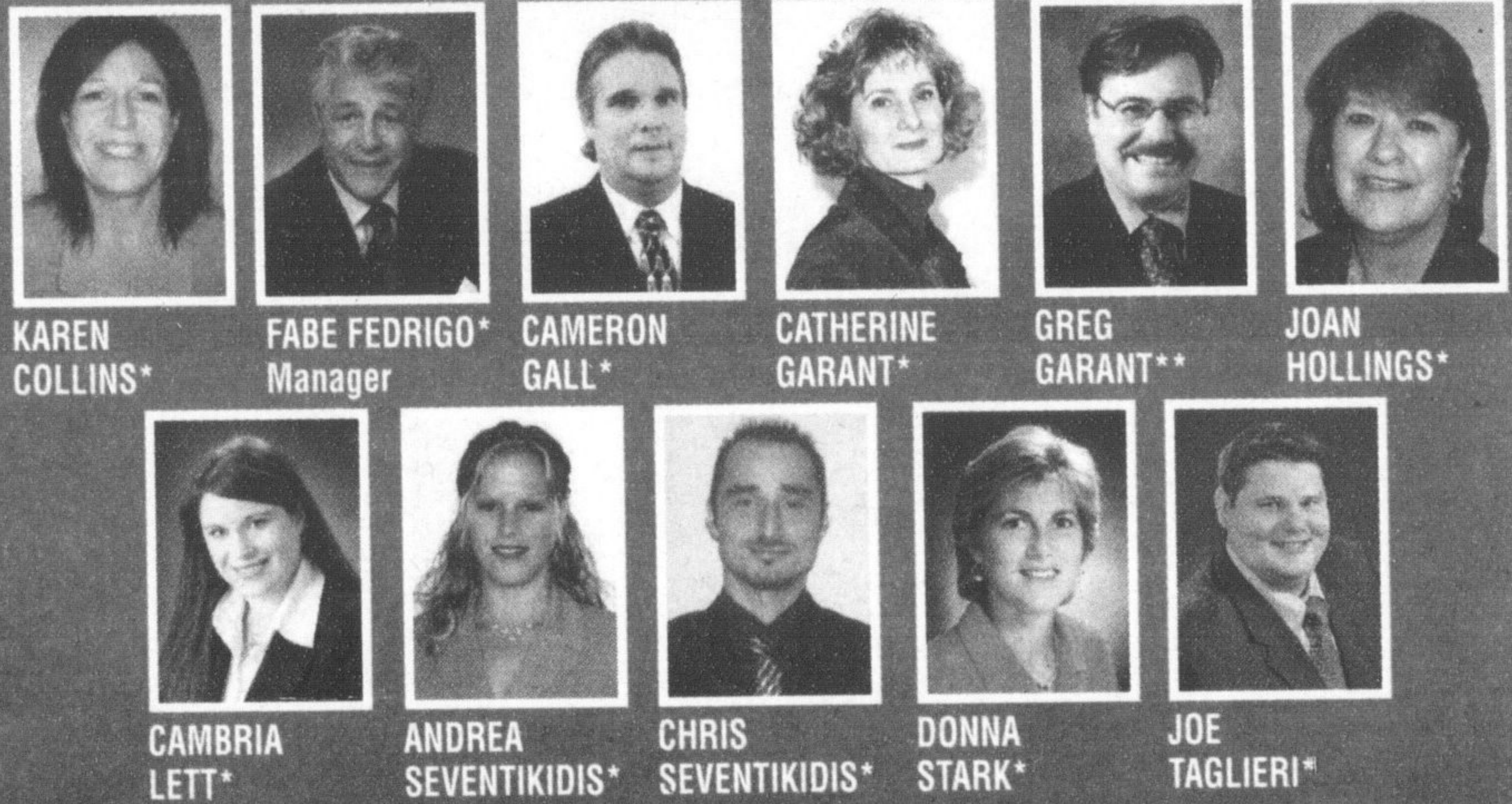
*** Broker of Record ** Broker * Sales Representative