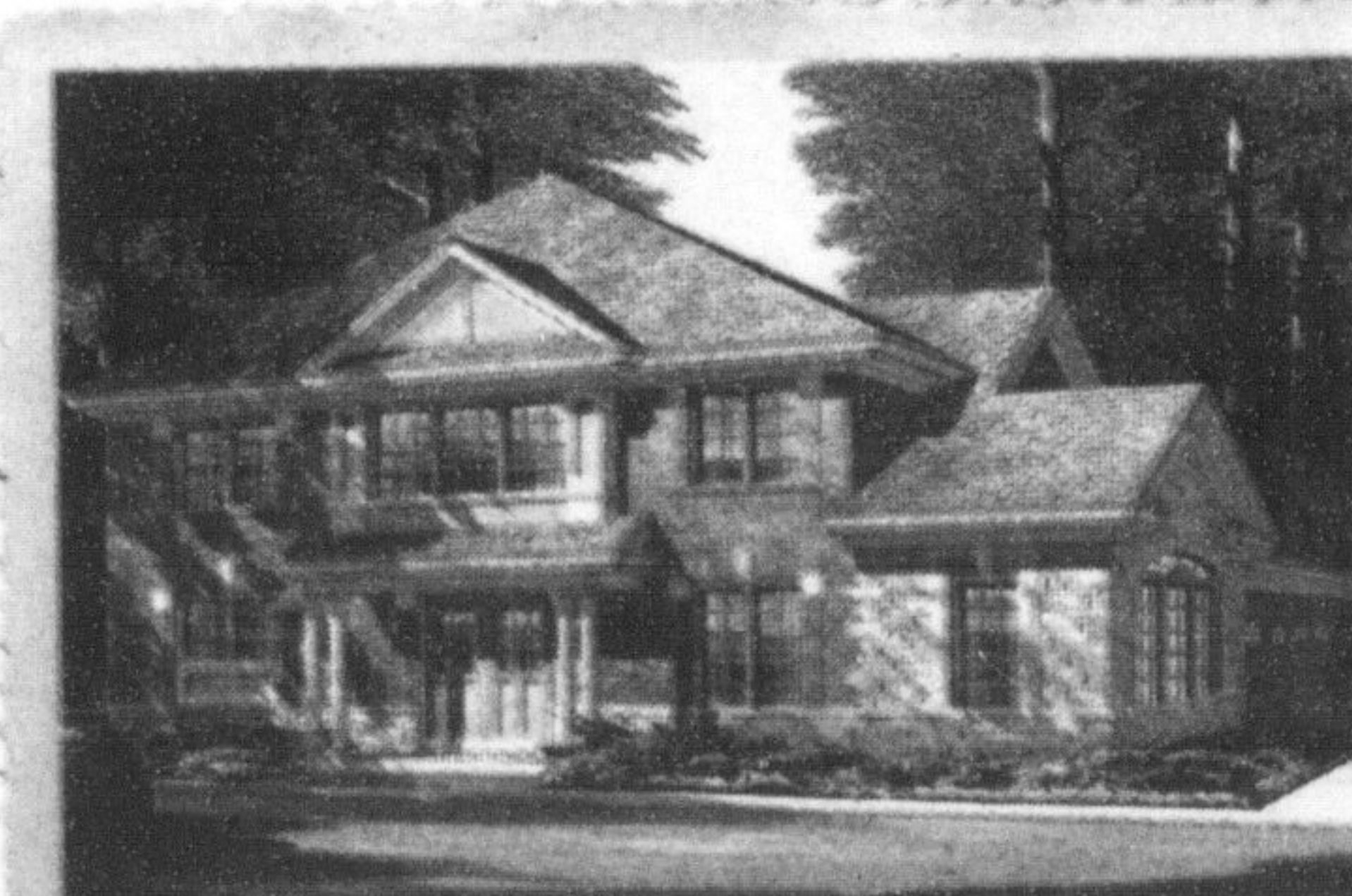
36' WideLot™, The Quincy Corner II 'C', 1,880 Sq.Ft., $371,990