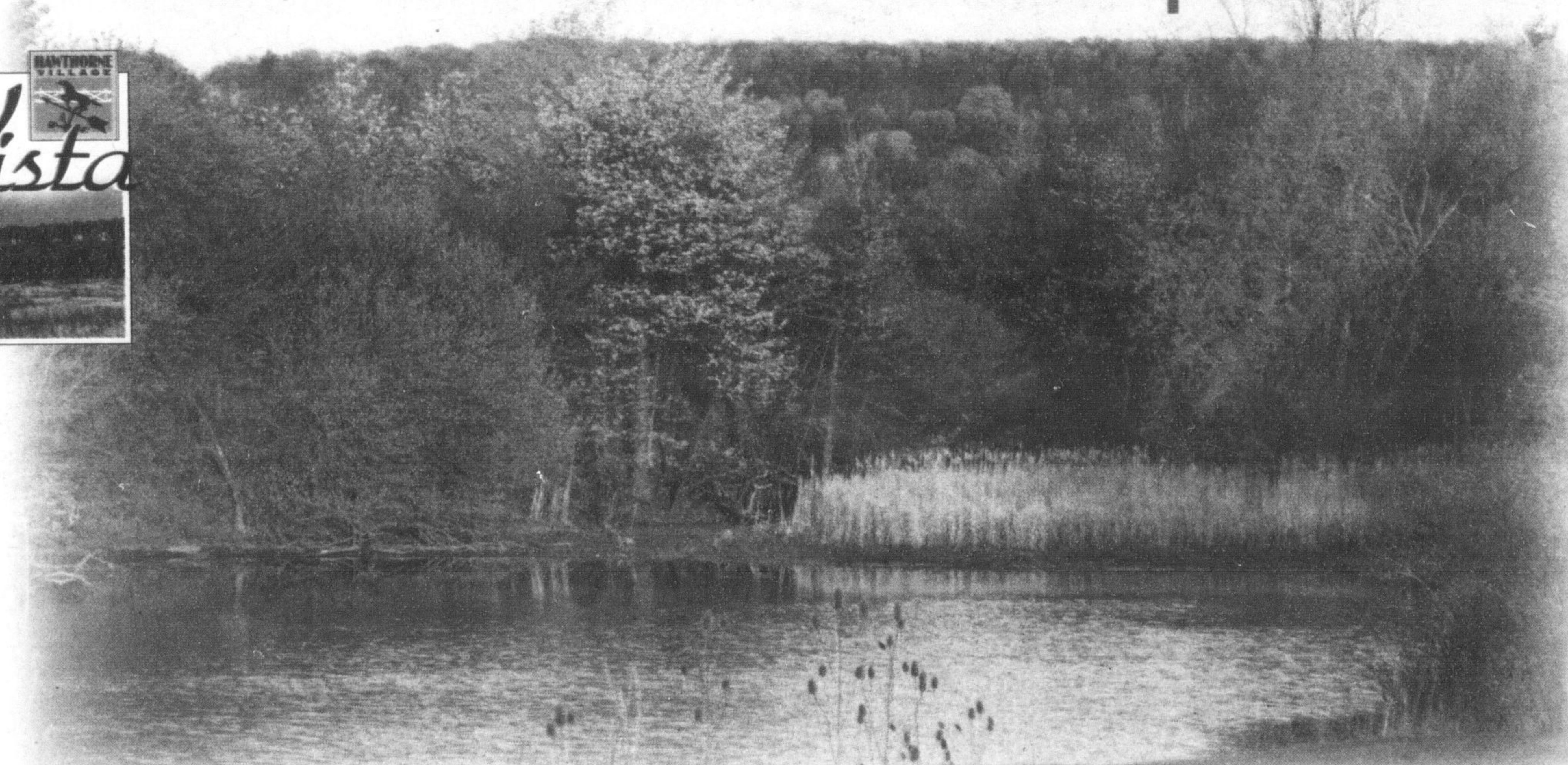
The Natural Pond In Vista