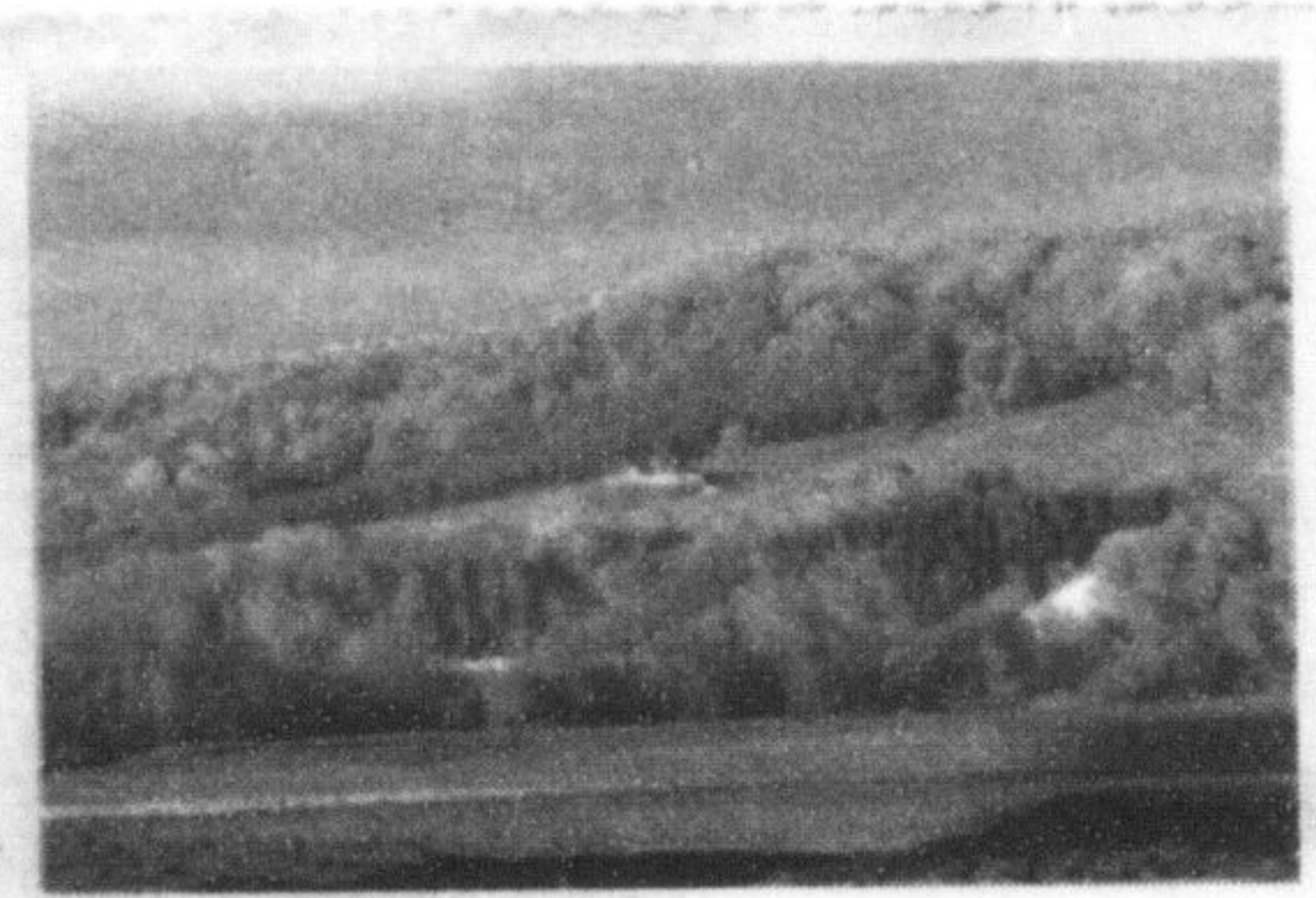
View Of Escarpment

Vista is a panorama of wildflowers, forests, public parks and a community pond. There is a protected greenbelt that will never be developed so your Vista will always remain uninterrupted.