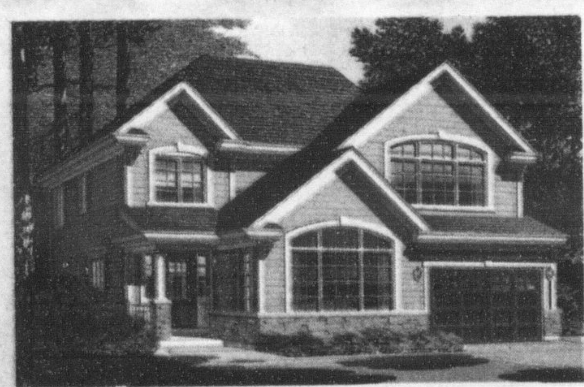
34' WideLot™, The Pinehurst 'A', 1,816 Sq.Ft., $340,990

Visit us today and expand your horizon at Hawthorne Village Vista.