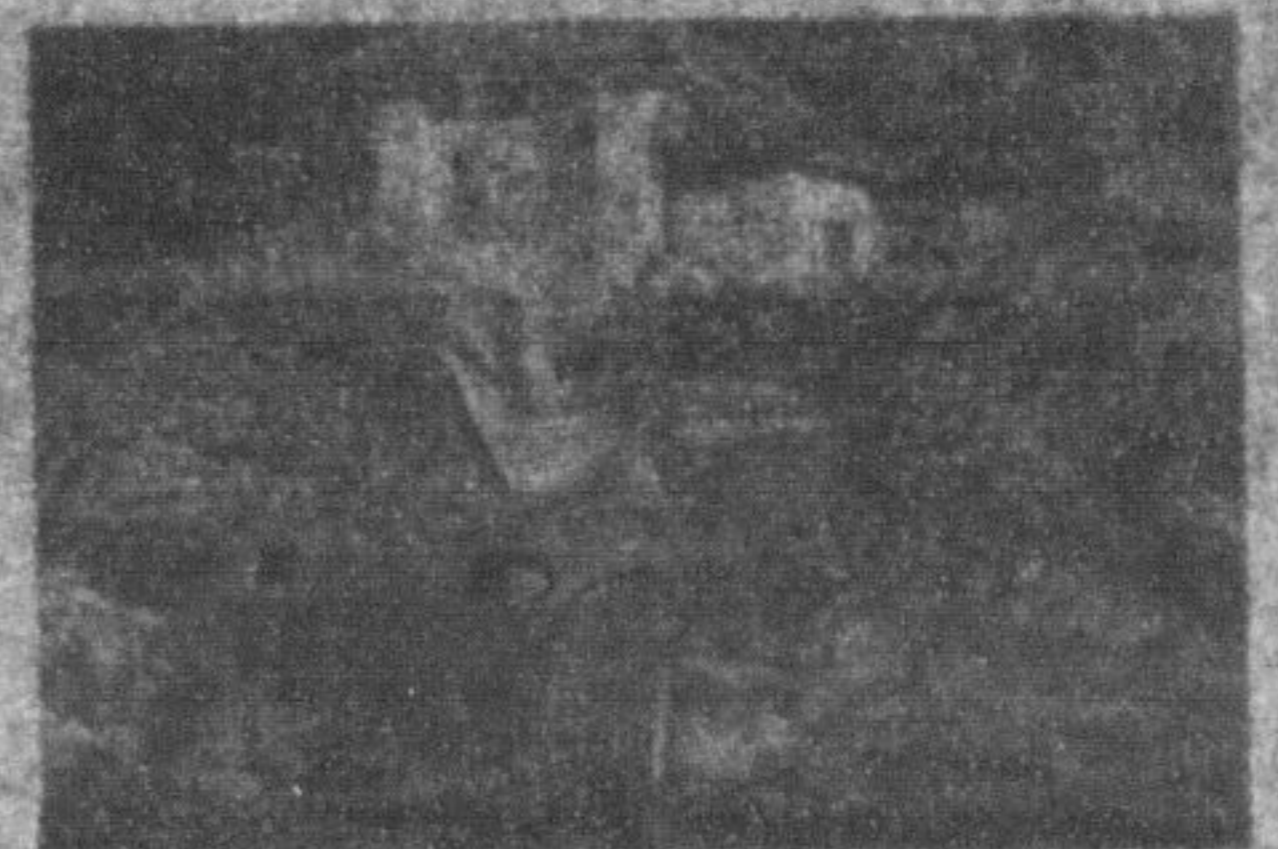
Gator HPX 4x4