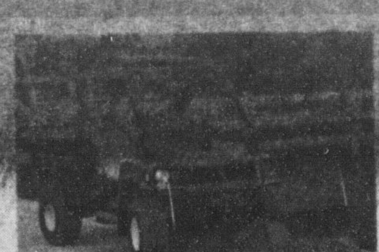
Gator HPX 4x4