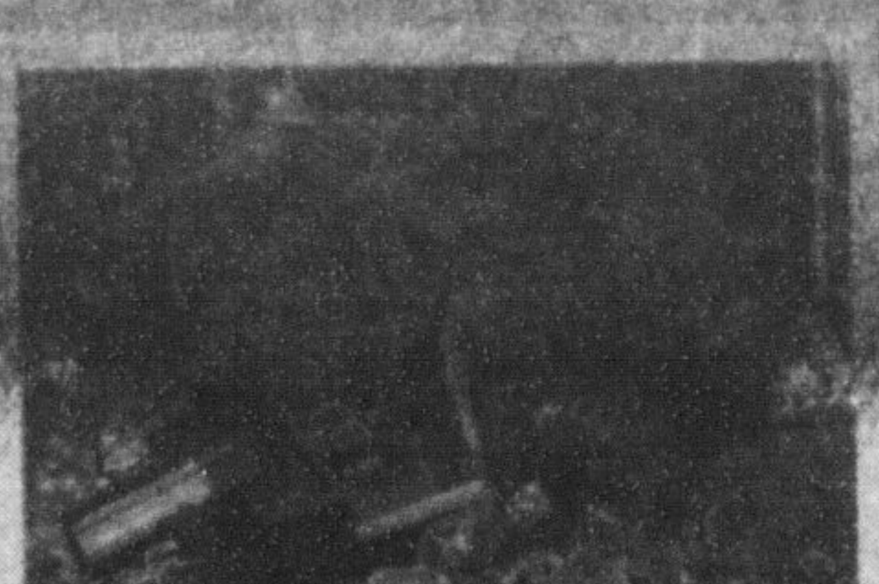
Gator 620i XUV 4x4

• Don't Be Fooled by the CX's convenient size and easy operation! • It's one true Gator capable of work, golf carts can only imagine!