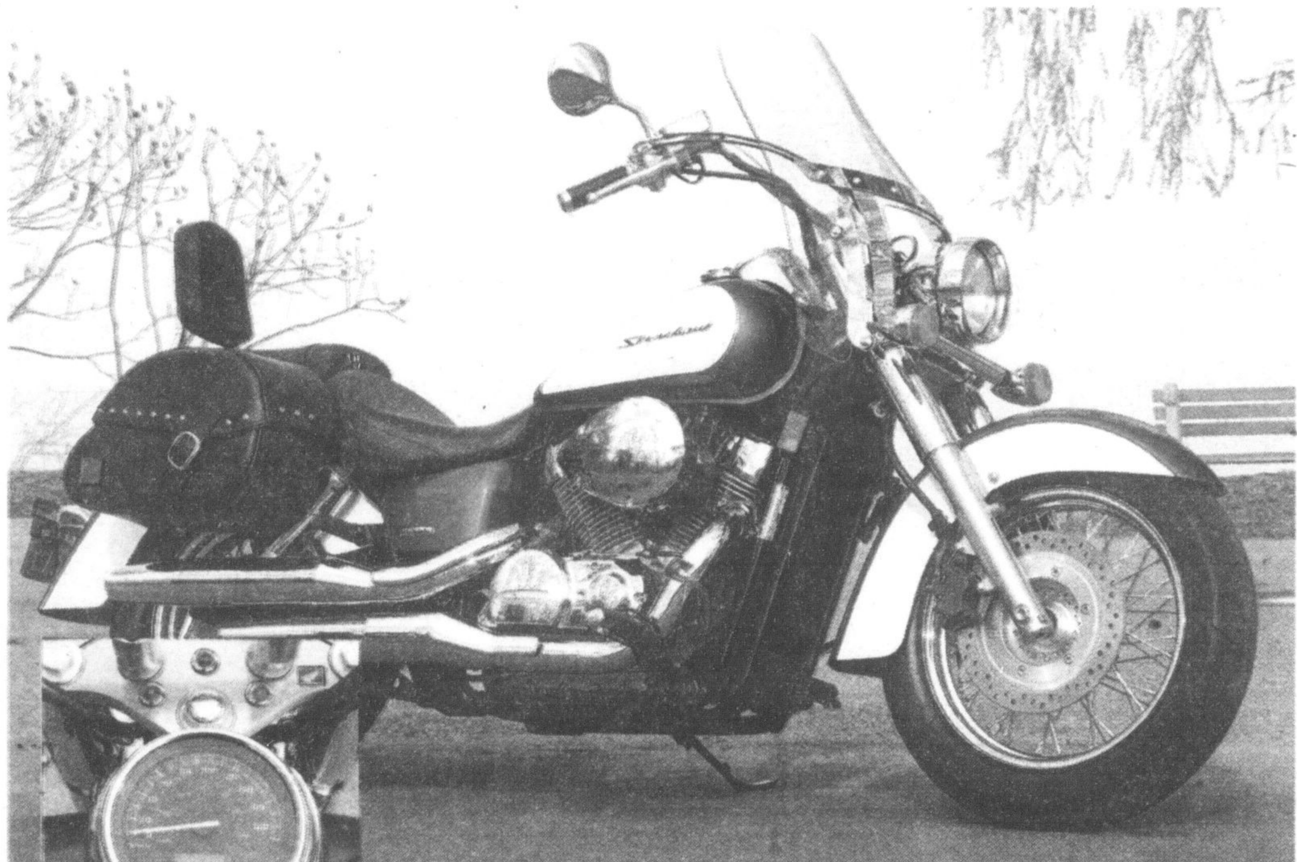
ABOVE: The 2008 Honda VT750T Tourer adds a standard windshield, saddle bags, a backrest and touring utility to the Shadow Aero cruiser styling. LEFT: The simple, tank-mounted speedometer is wrapped by a chrome instrument housing and instrument lights are mounted inside the gauge for optimum visibility.

But while imitation may be the sincerest form of flattery, it's innovation that still sets leaders apart from followers.