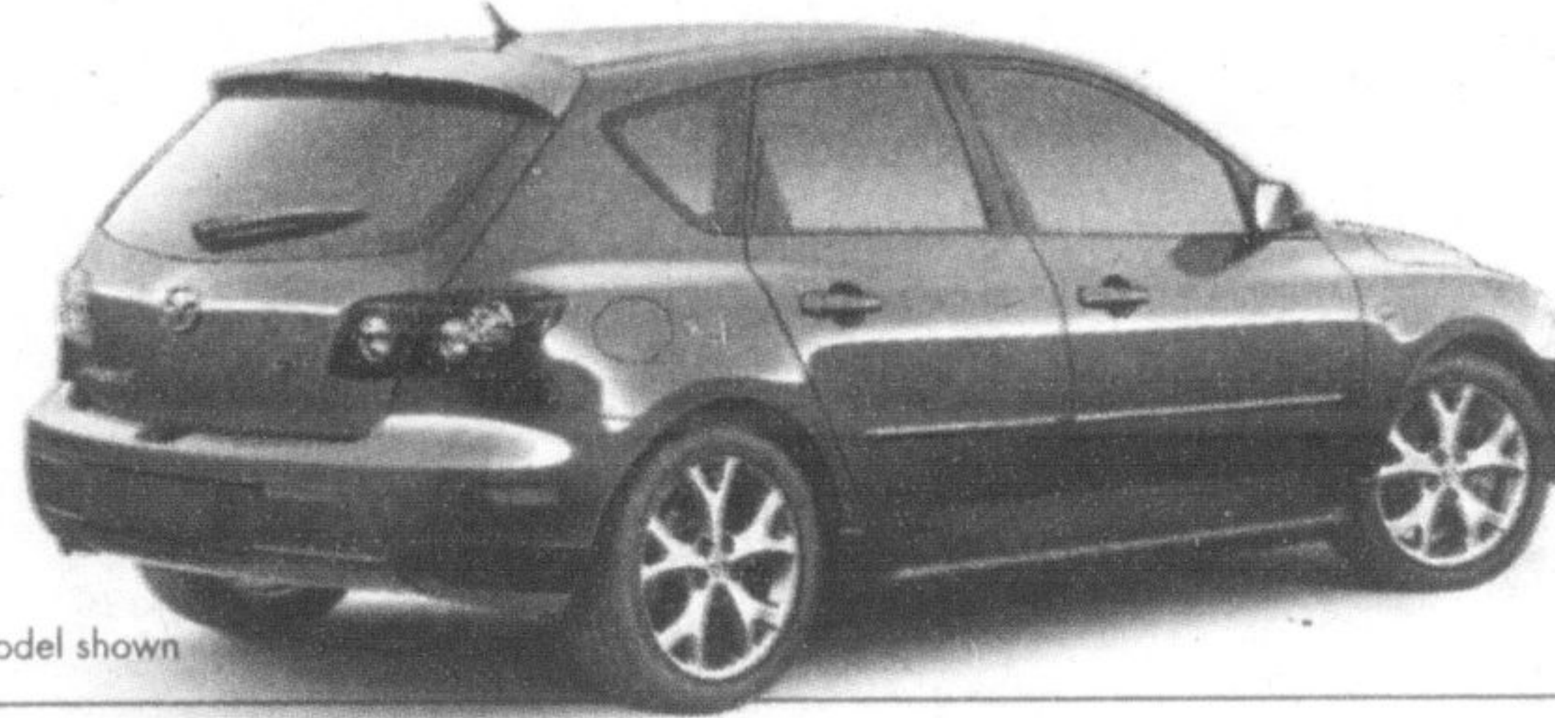
2008 GT model shown

Bold styling. A long list of standards. And superbly balanced dynamic performance, courtesy of a remarkably advanced 16-valve engine. This is the award-winning Mazda3. Priced right with 0% purchase financing for 60 months.