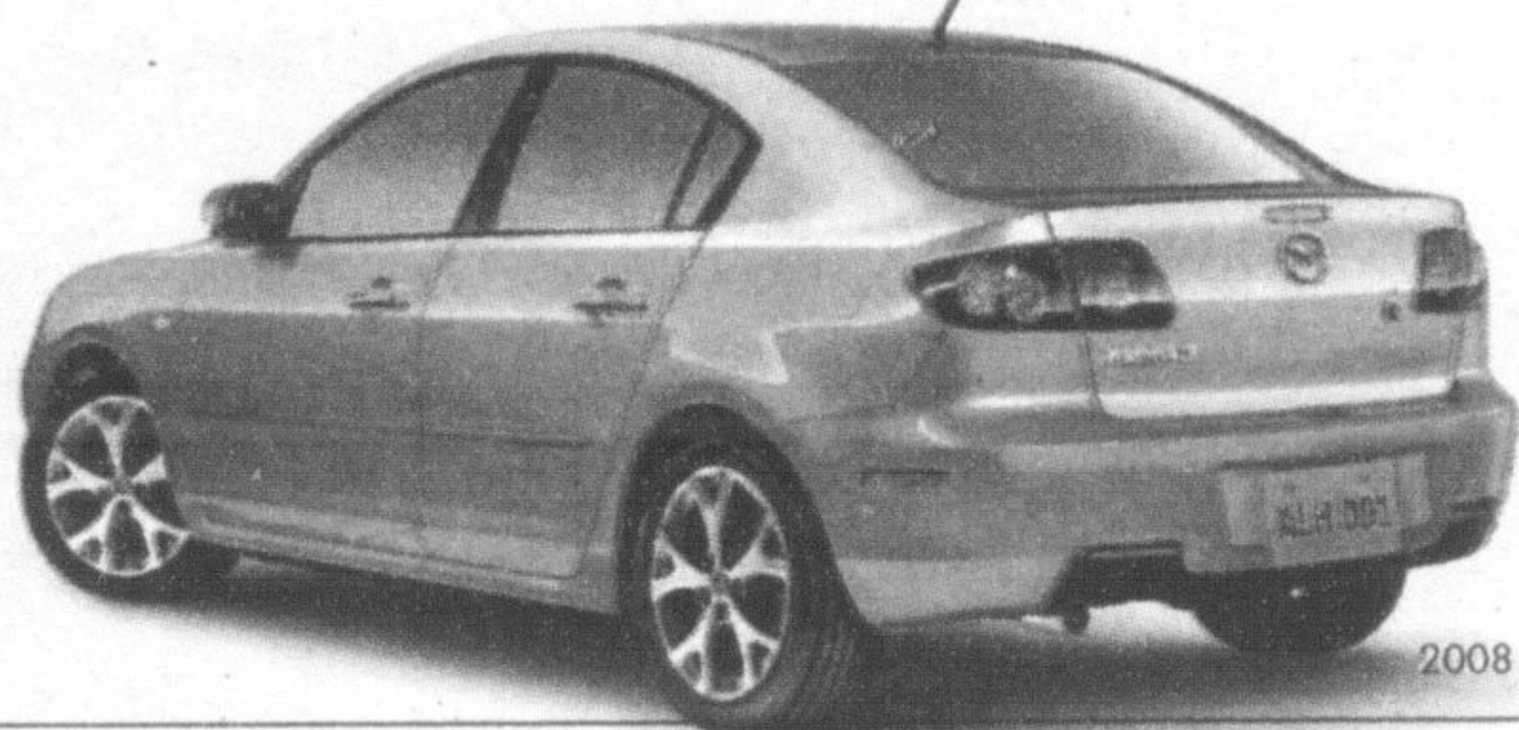
2008 GT model shown

From fun-to-drive compacts and sports sedans, to breakthrough Crossover SUVs, we put the soul of a sports car into everything we make. And now, we're geared for our new economy with zero percent purchase financing on most models. So see your Mazda dealer for a test-drive today. Springtime is the best time to "zoom-zoom".