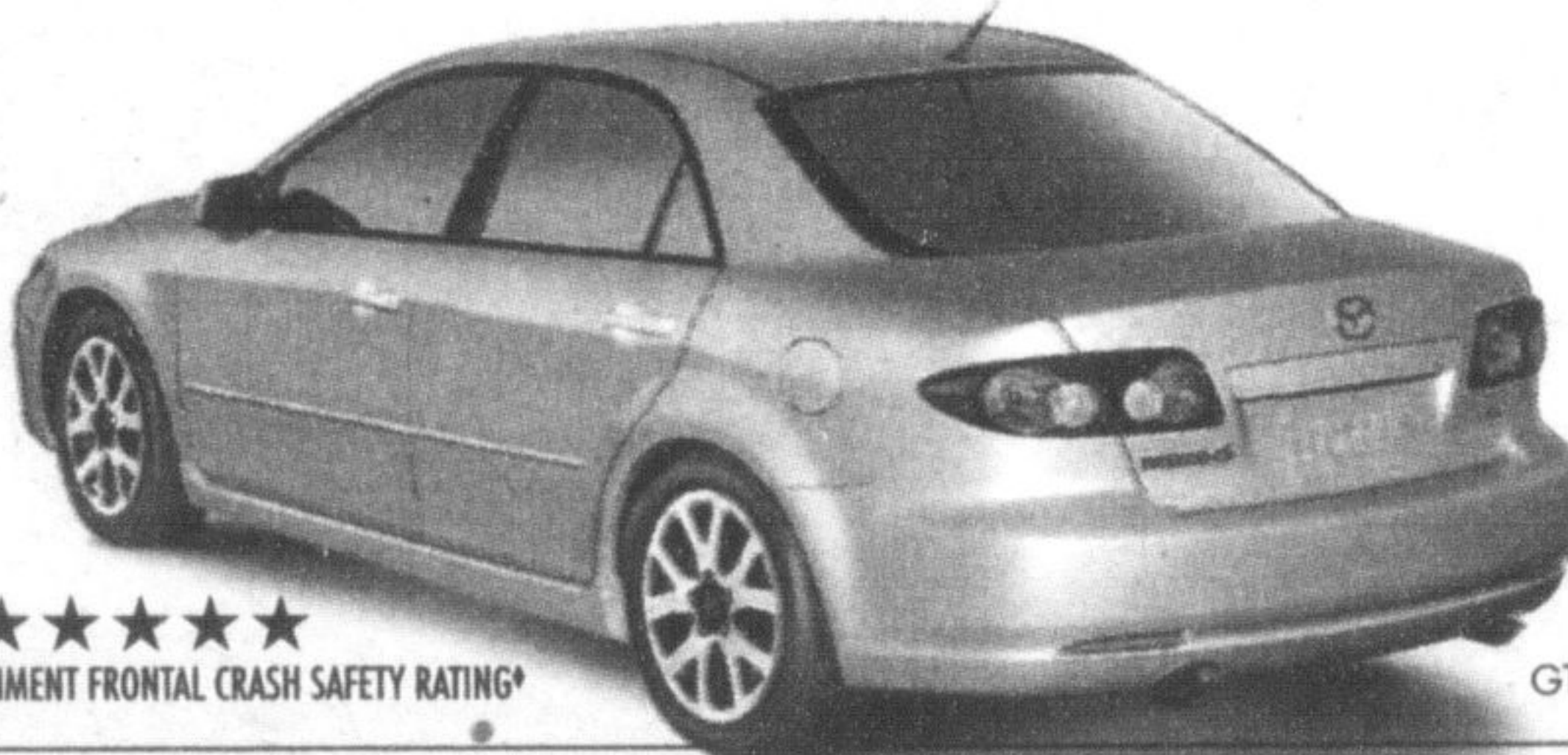
GT-V6 model shown

An exhilarating 2.3 L, 156-hp, DOHC engine. Generous room for five. And a hatchback for more cargo versatility. With 0% purchase financing for 60 months, the award-winning Mazda3 Sport has never looked so good.