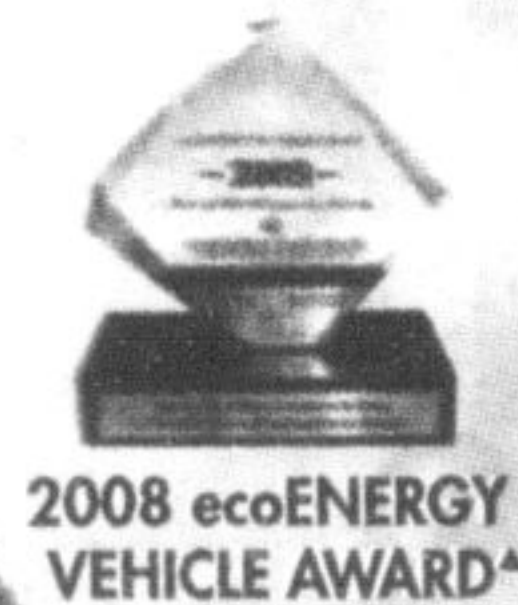
2008 ecoENERGY VEHICLE AWARD*

2008 Mazda5 MAZDA5 MODEL LINE STARTS AT $20,795