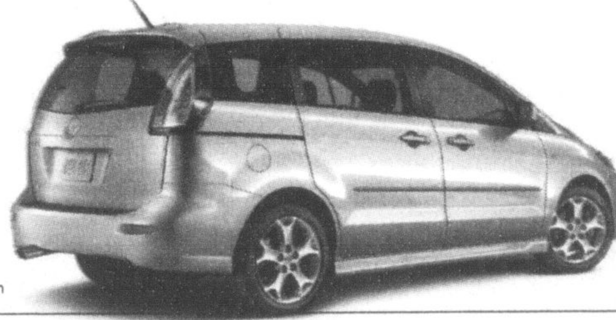
GT model shown

The award-winning Mazda6 sacrifices nothing to maintain the perfect balance between sports car performance and sedan practicality. A comfortable ride, athletic handling and a trunk that fits up to four golf bags. Take a test-drive to experience the real deal. And we do mean deal with exceptional pricing and lease offers.