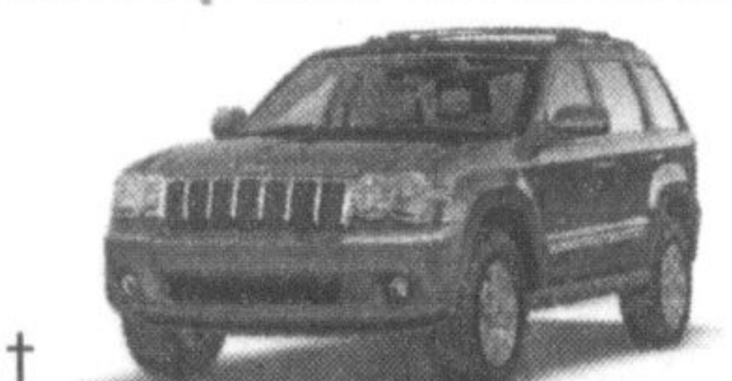
2008 Jeep Grand Cherokee Diesel

$10,000 Consumer Cash Discount OR 0% Chrysler Financing Rate - 48 months