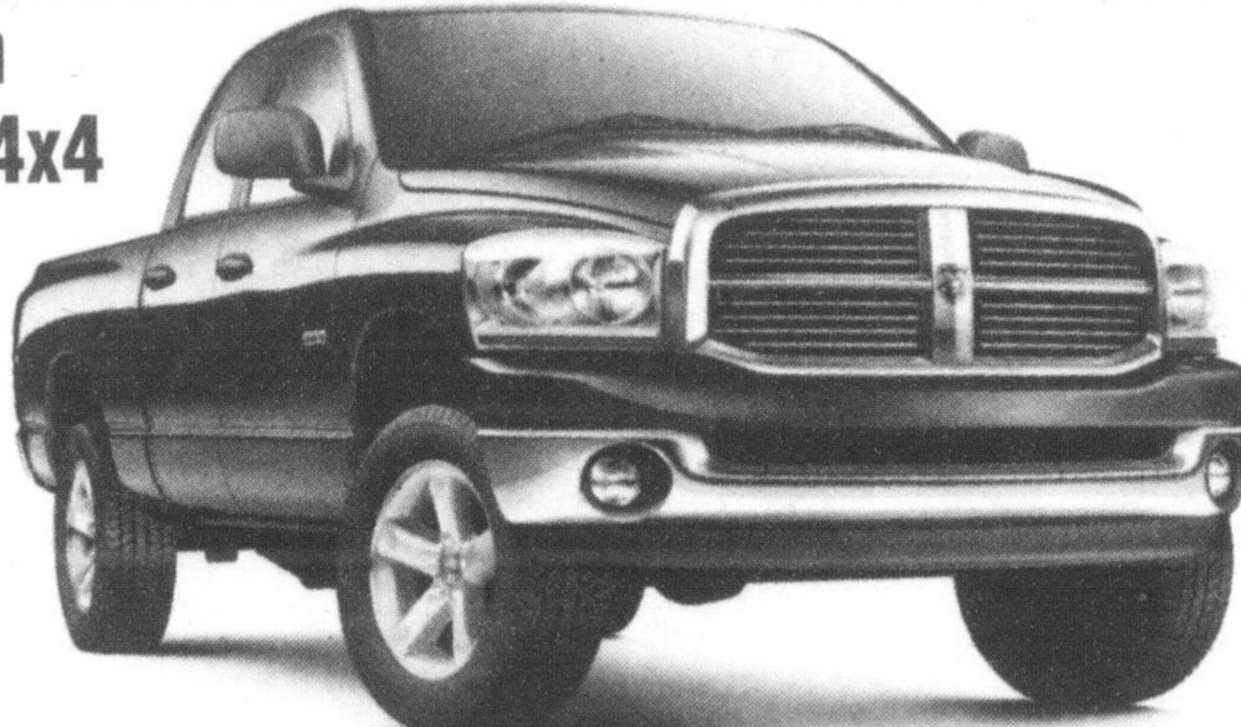
2008 Dodge Ram SXT - Quad Cab 4x4

24B pkg, 4.7L 310HP, auto trans, a/c, am/fm/cd/stereo, tilt, cruise, pw, pdl, pm, keyless remote, chrome wheels, grill and bumpers, 6 passenger seating, shift on the fly 4x4 and much more. Stk# 618755