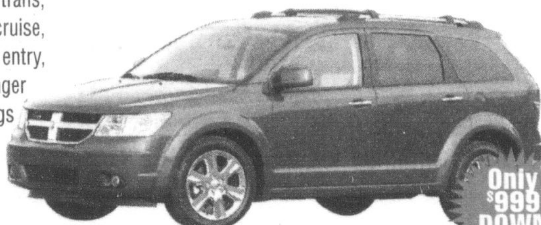
2008 Dodge Journey SXT Crossover

28K pkg, 3.5L V6, A/C, 6 speed auto trans, am/fm/6 disc cd changer/mp3 stereo, tilt, cruise, pw, pdl, p. heated mirrors, remote keyless entry, 17" alloy wheels, sunscreen glass, 5 passenger seating, abs, esp, traction control, 7 airbags and much more. St#191777