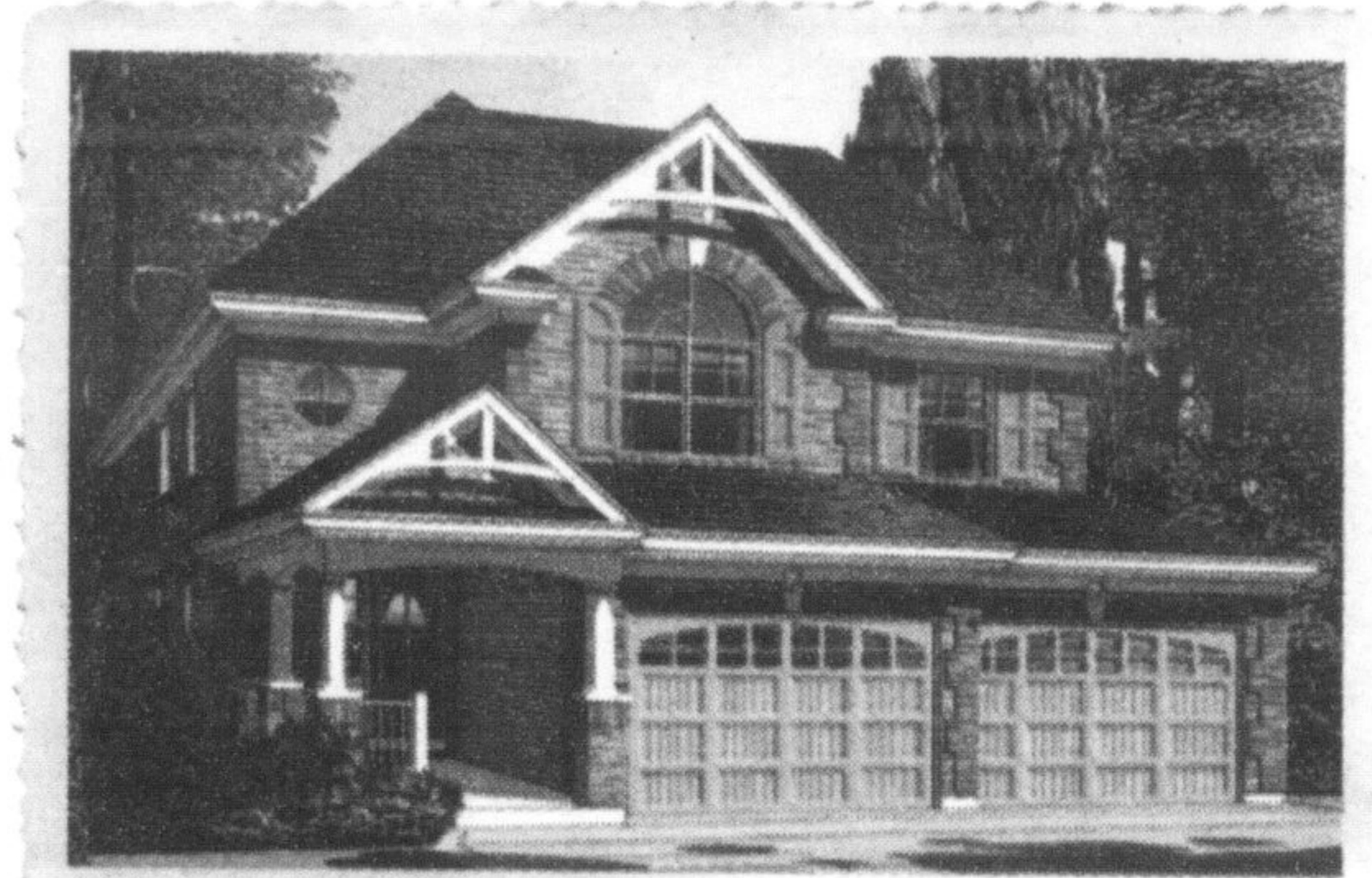
36' WideLot™, The Royal Fern 'B', 2,047 Sq.Ft., $368,990