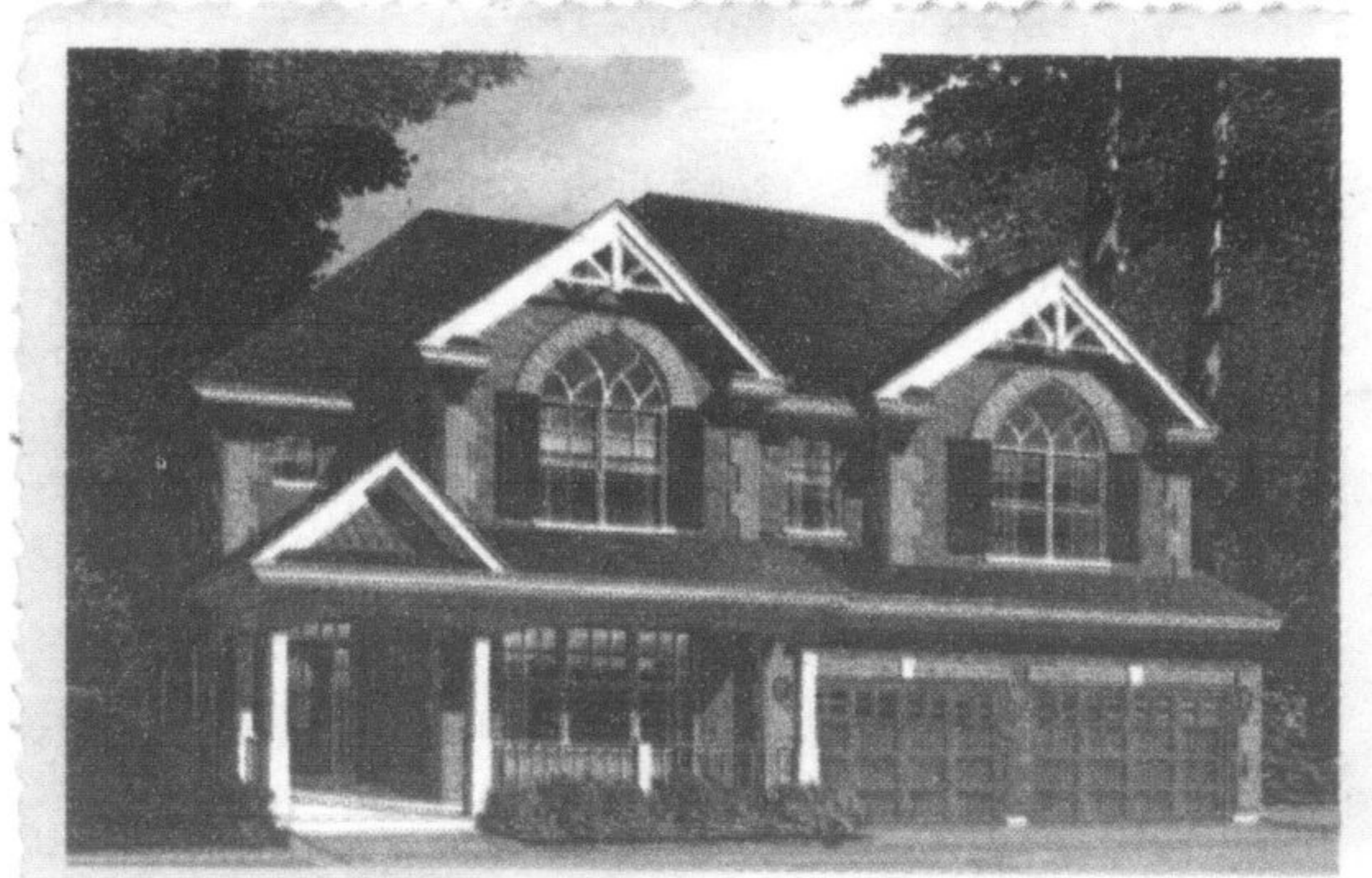
43' WideLot™, The Everlasting 'B', 2,346 Sq.Ft., $425,990