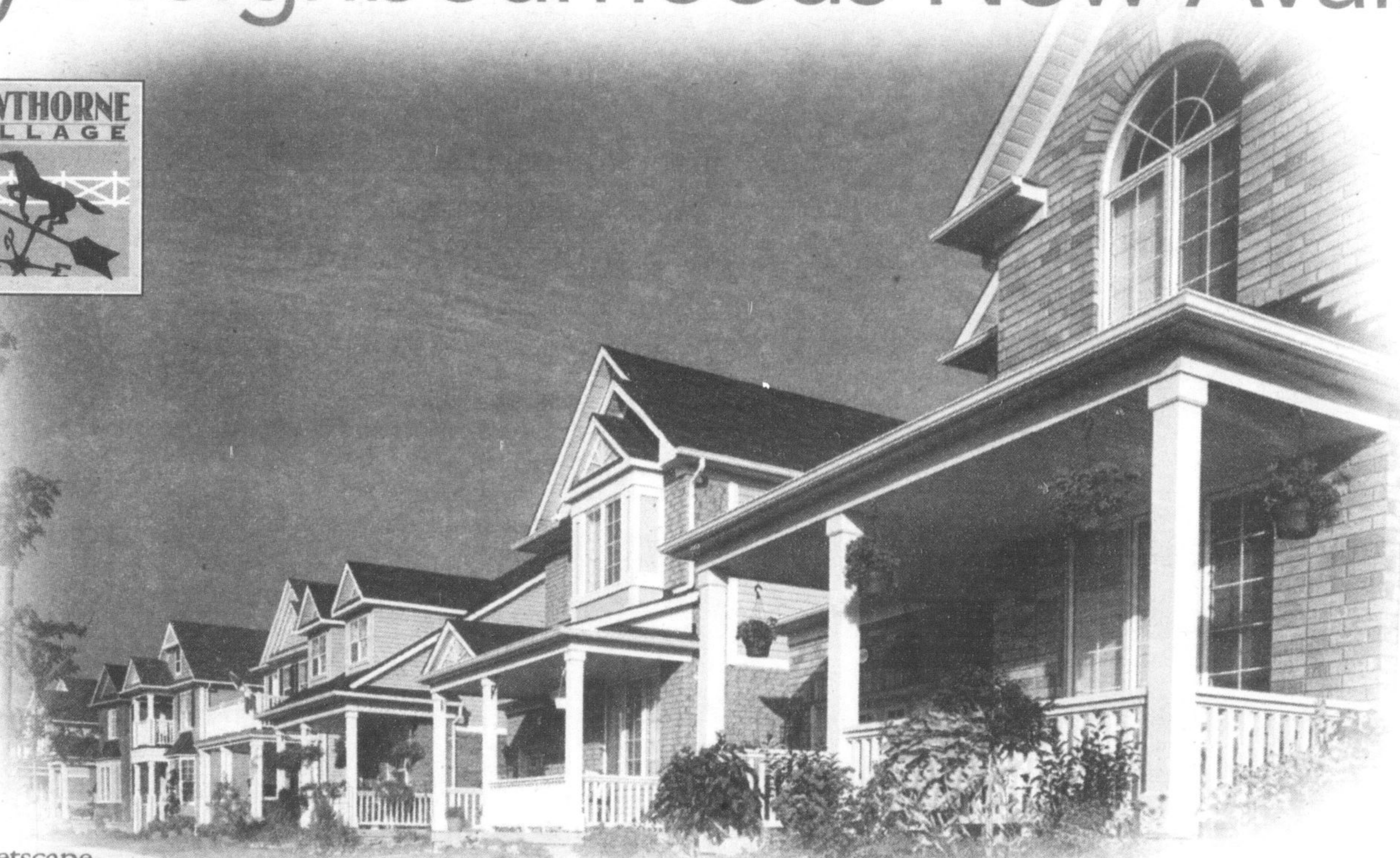
Hawthorne Village Streetscape