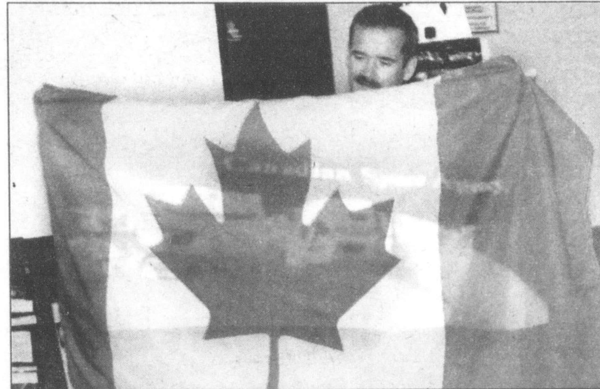
Astronaut and Milton native Chris Hadfield speaks to students at the public school named after him and looks over a Canadian flag signed by students and staff.