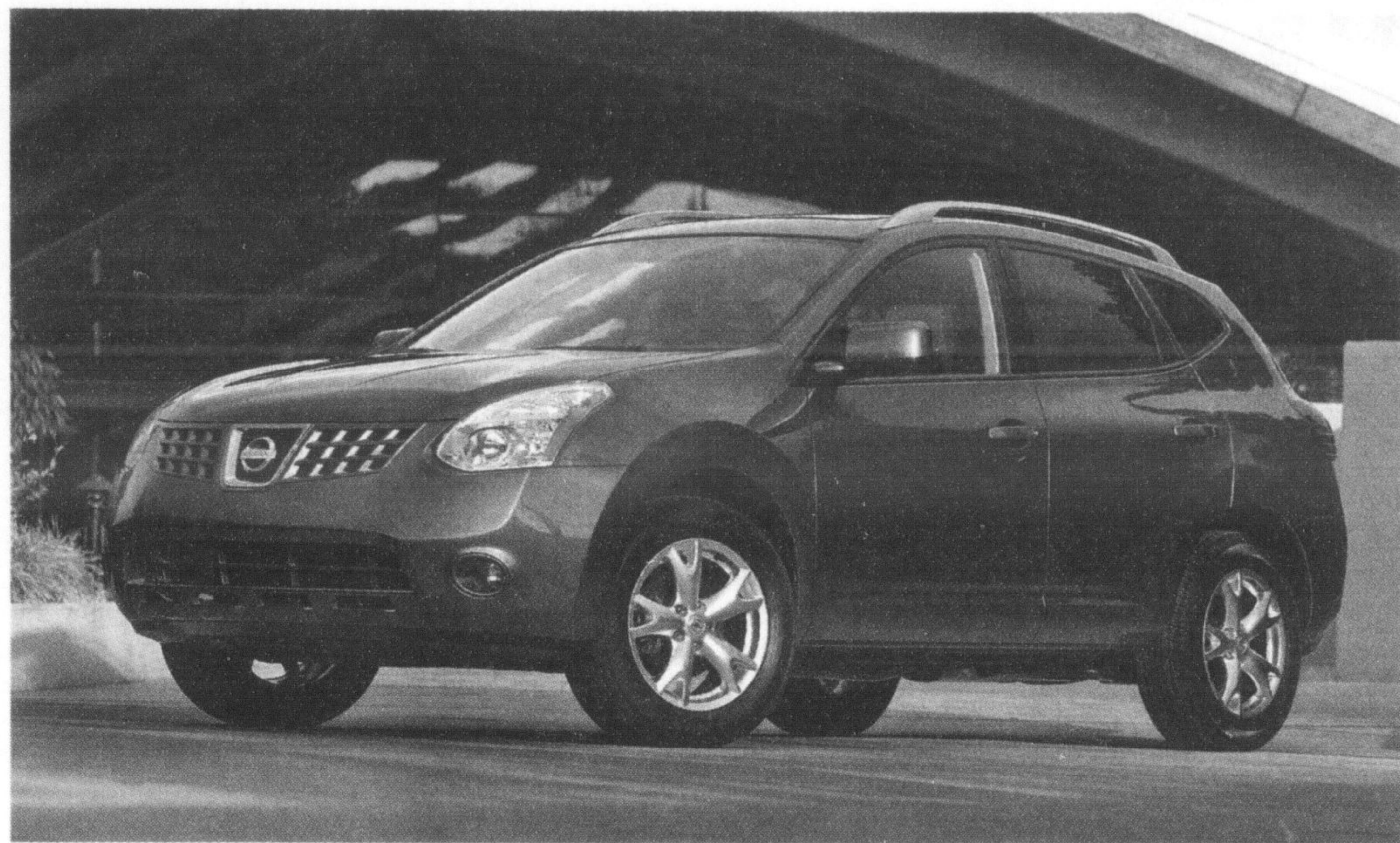
Nissan's new Rogue crossover replaces the successful, but boxy X-Trail. The Rogue boasts slippery lines, a wide track, aggressive silhouette and powerful rear shoulder lines.

Go to www.InsuranceHotline.com for the lowest rate.