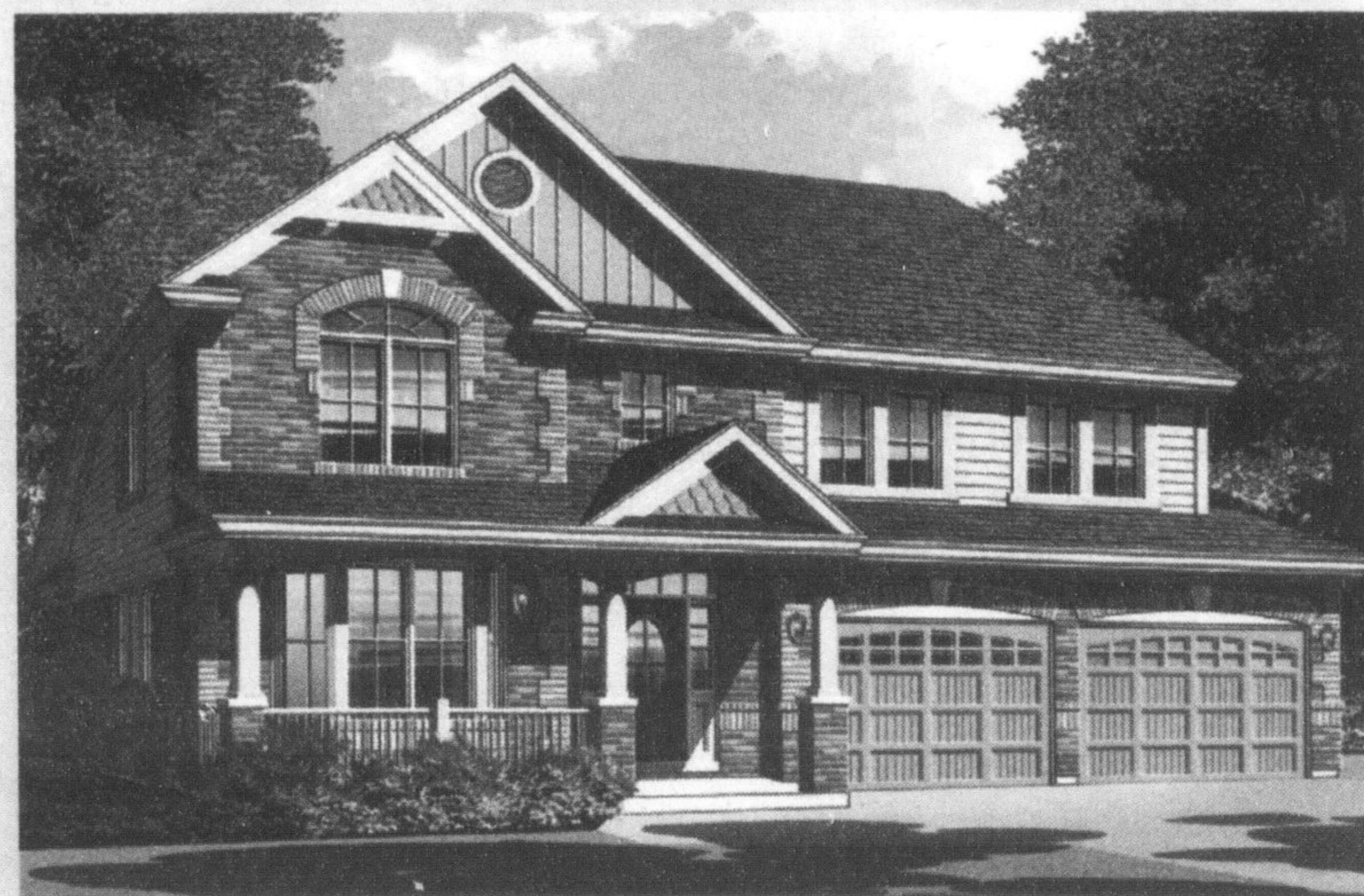
50' WideLot™, The Bellingham 'B', 2,353 Sq.Ft., $337,990