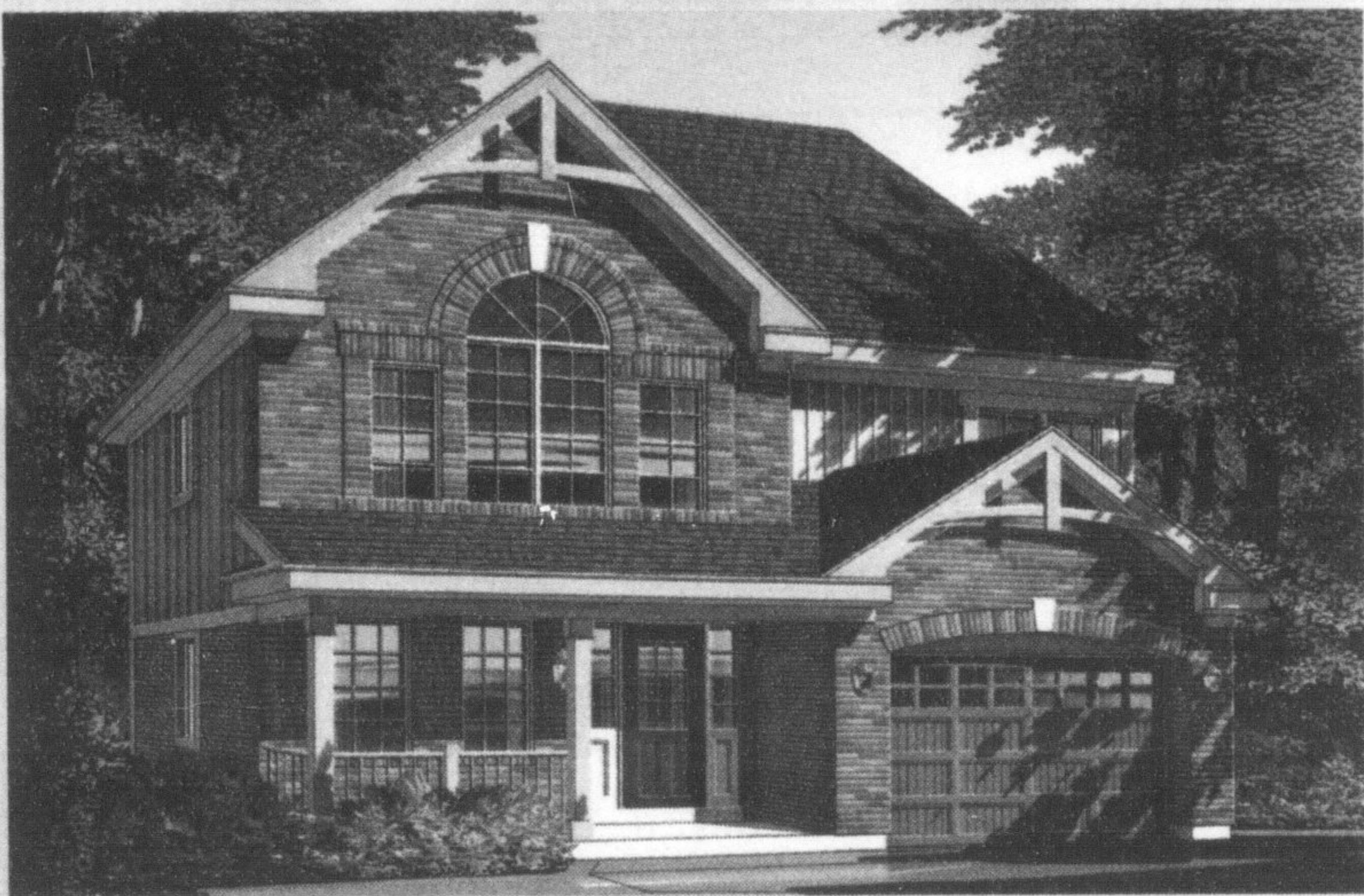
34' WideLot™, The Hillcrest 'A', 1,508 Sq.Ft., $254,990