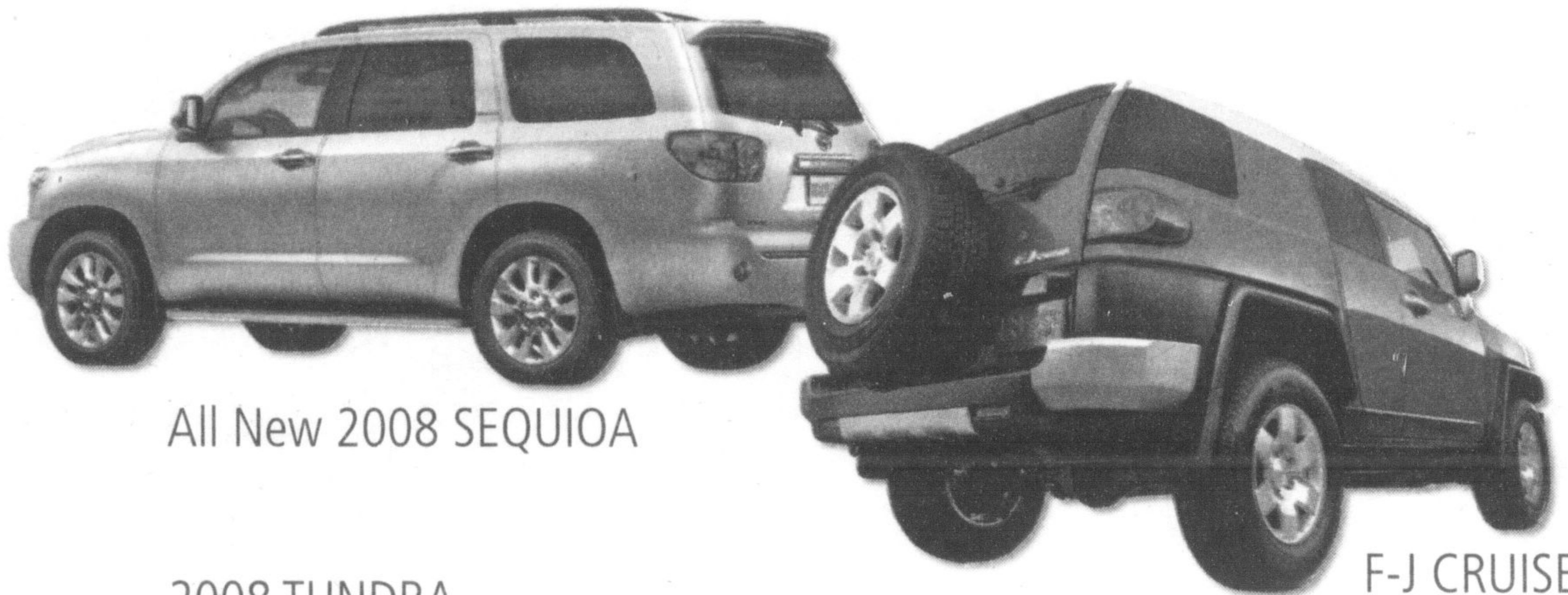
All New 2008 SEQUOIA

Rough and ready to take on anything, rain or shine!