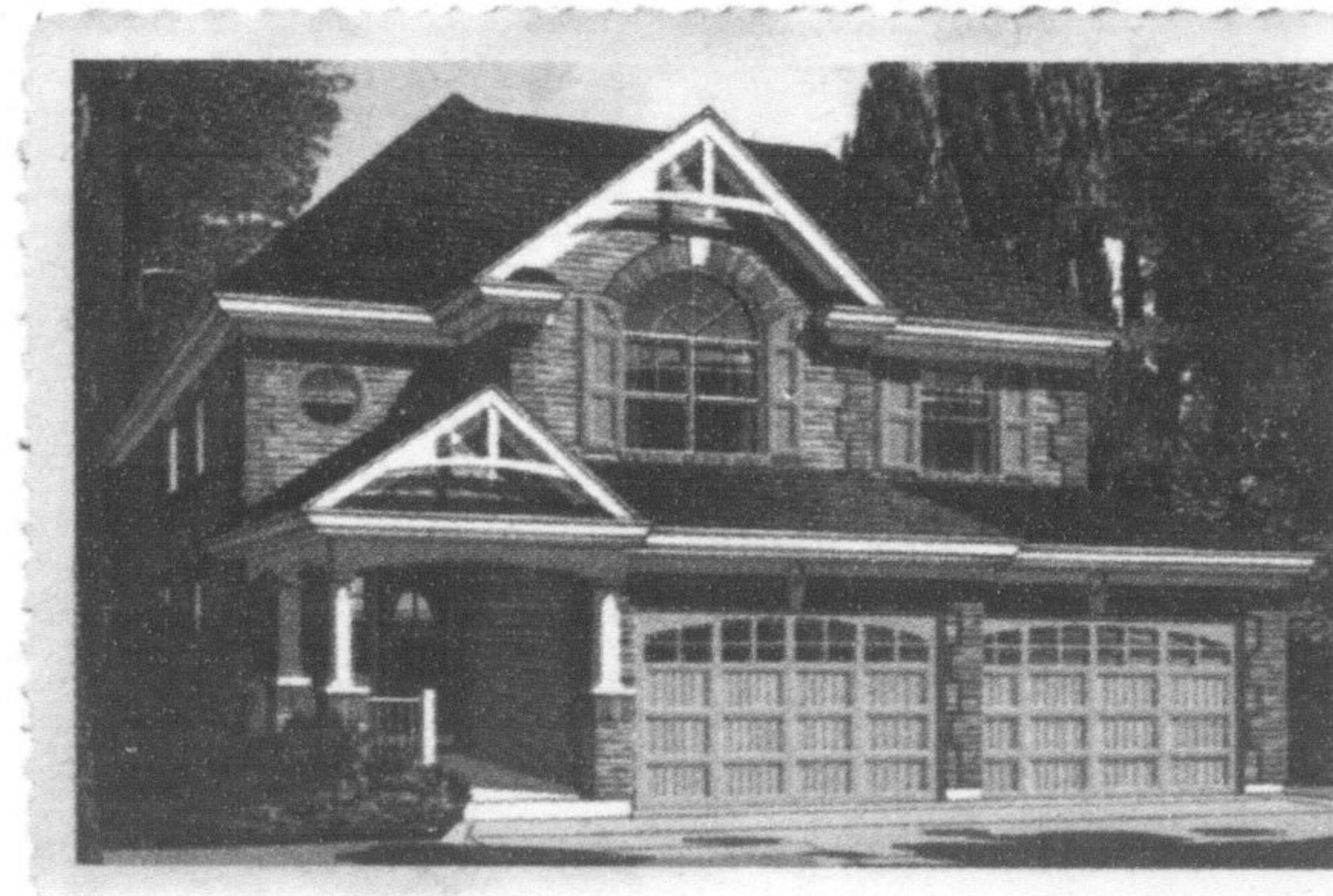
36' WideLot™, The Royal Fern 'B', 2,047 Sq.Ft., $366,990