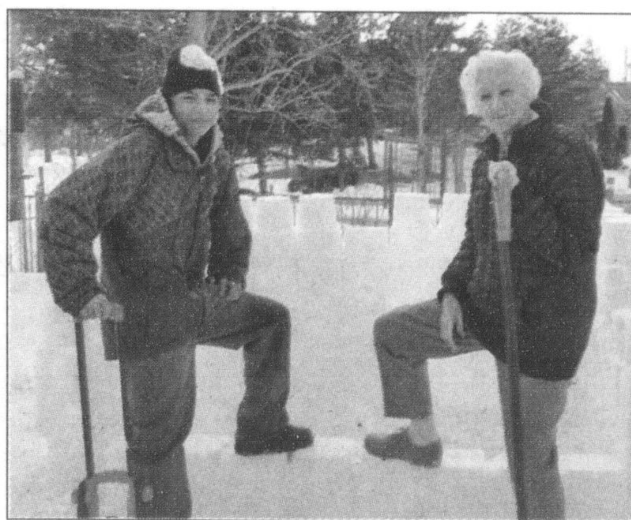
Building Ice Castles Is For Every Generation

What matters to you... matters to us!... 1-800-268-0159