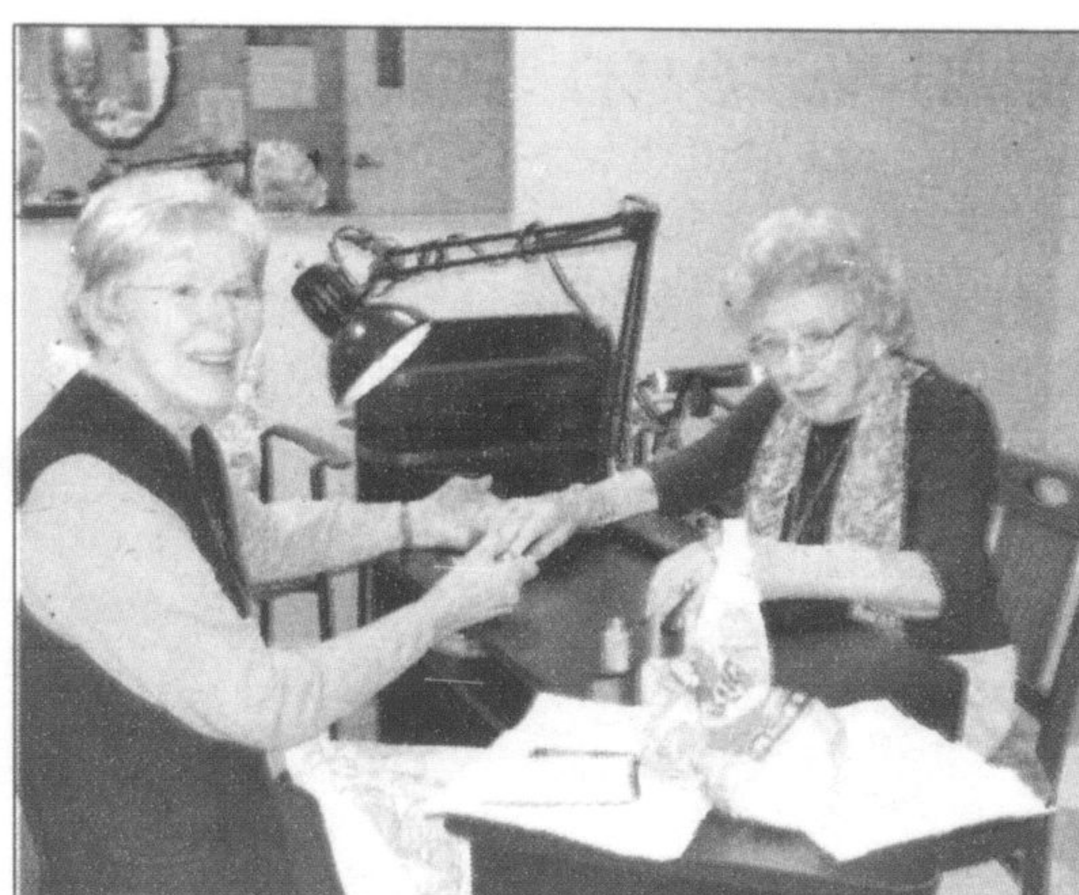
Pampering At The Spa