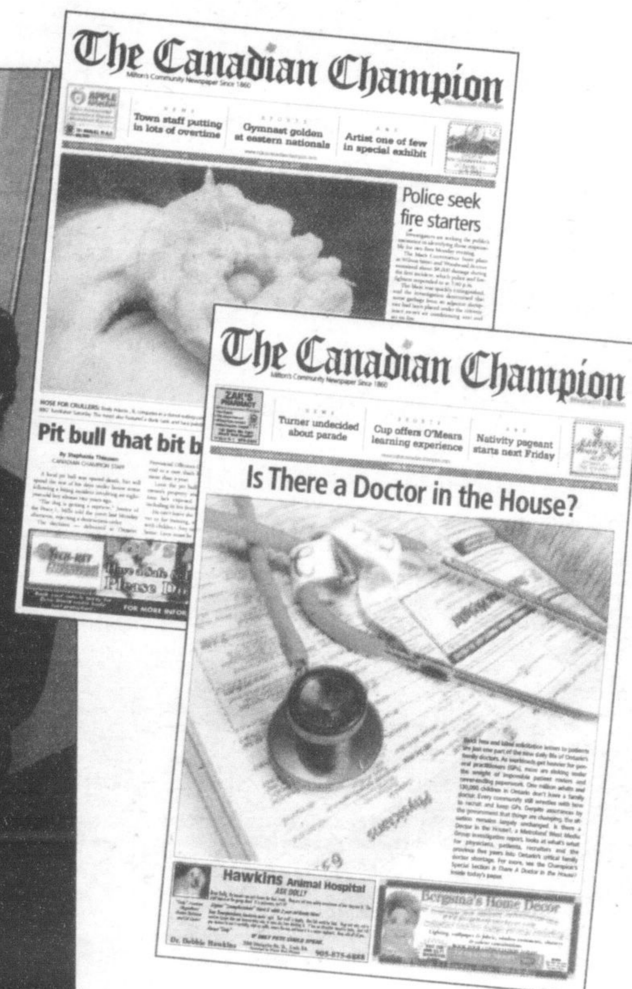
Champion staff have a lot to celebrate with the recent news that the community newspaper won a top national award recognizing overall achievement by circulation class in editorial, advertising and layout. At right are the two issues judged for the award.