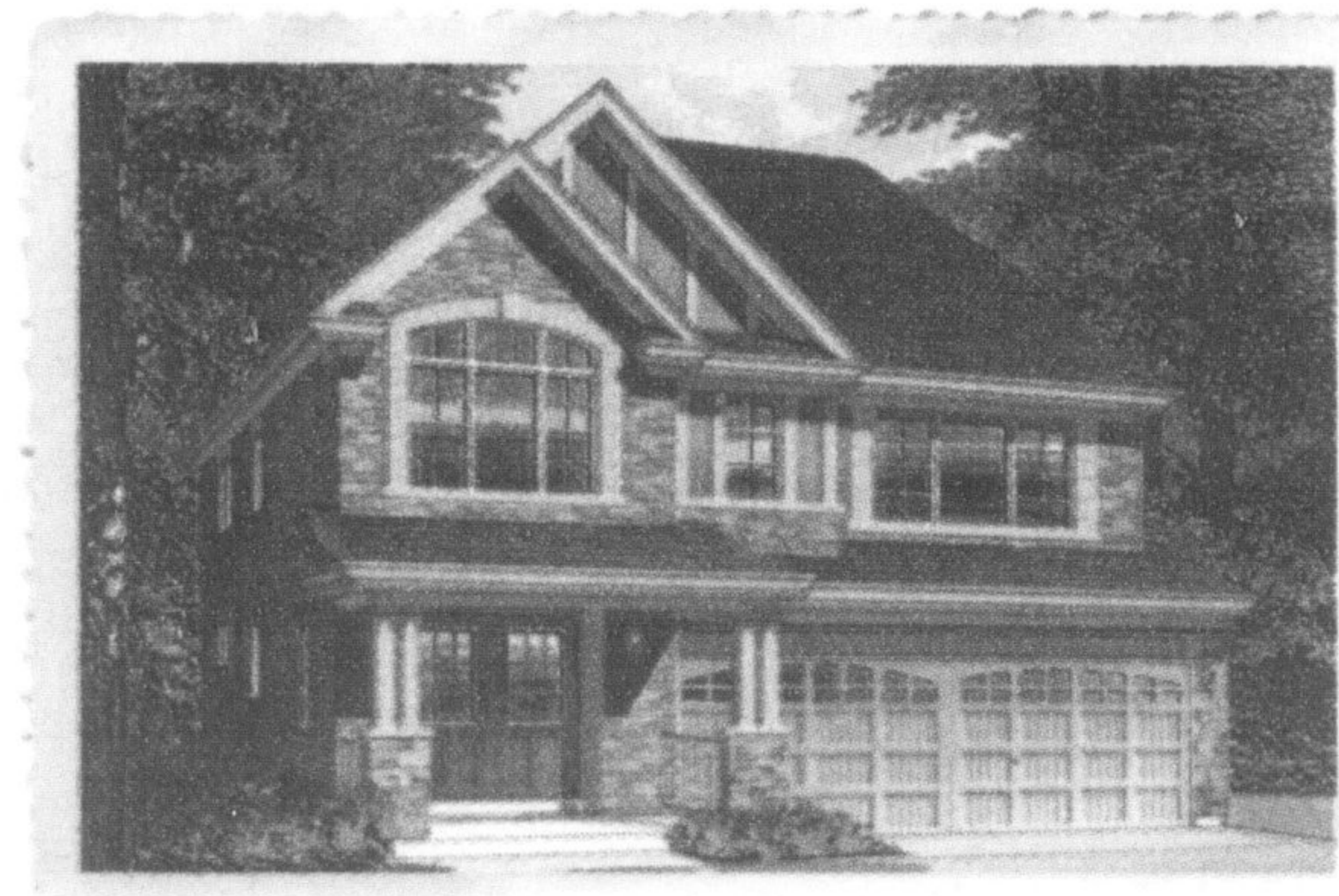
36' WideLot™, The Walnut 'B', 2,427 Sq.Ft., $383,990