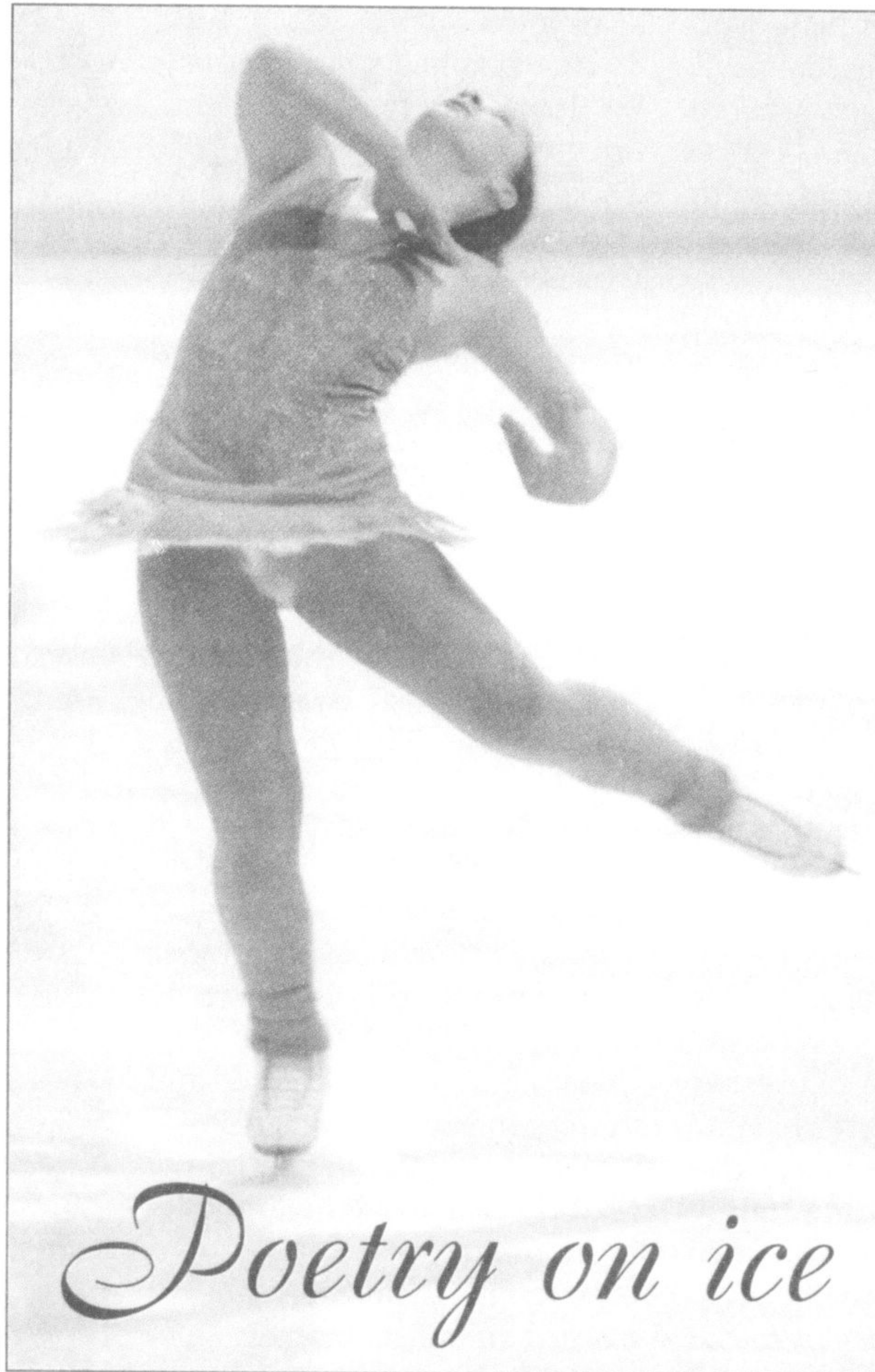
Poetry on ice