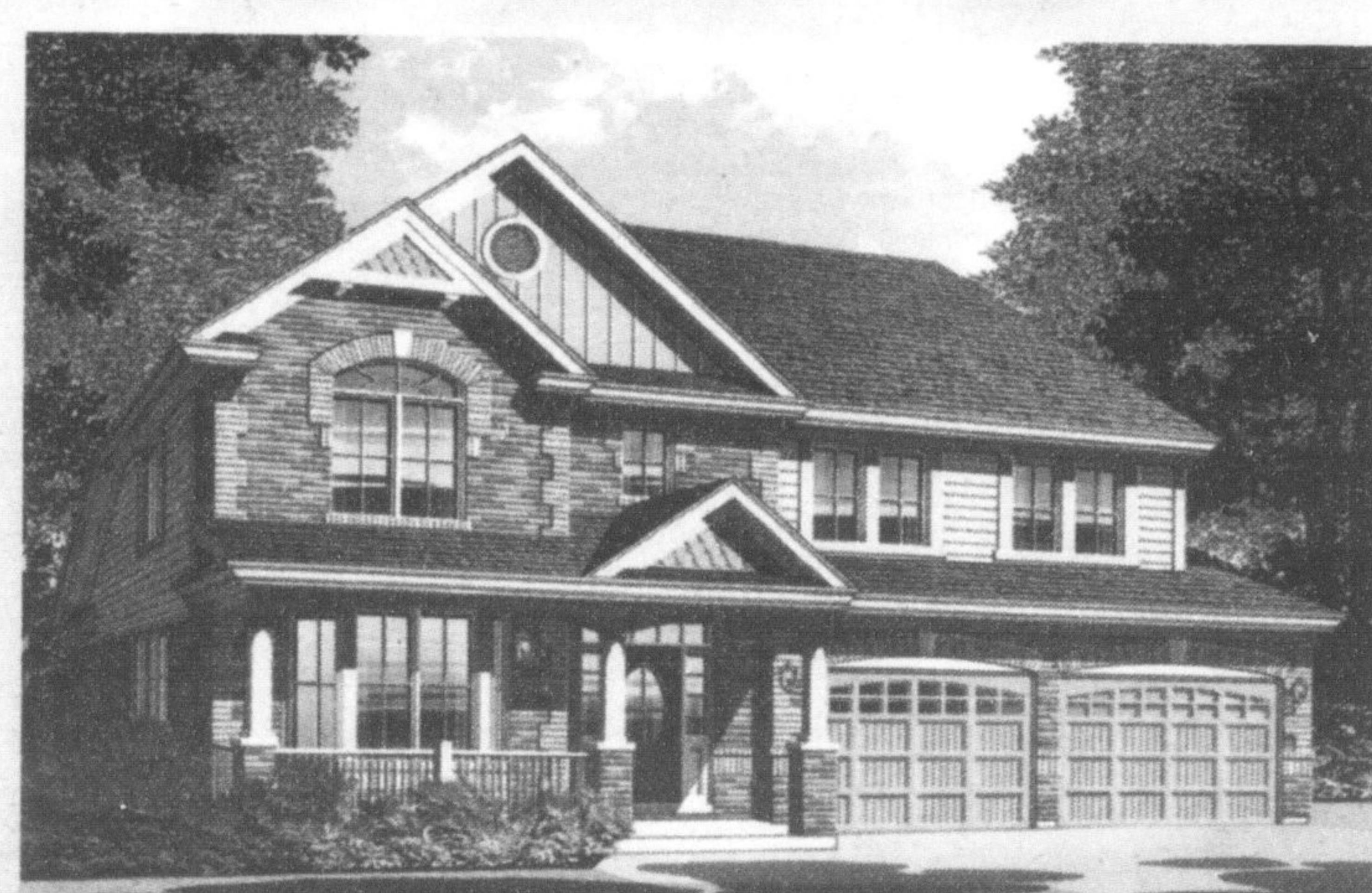
50' WideLot™, The Bellingham 'B', 2,353 Sq. Ft., $337,990