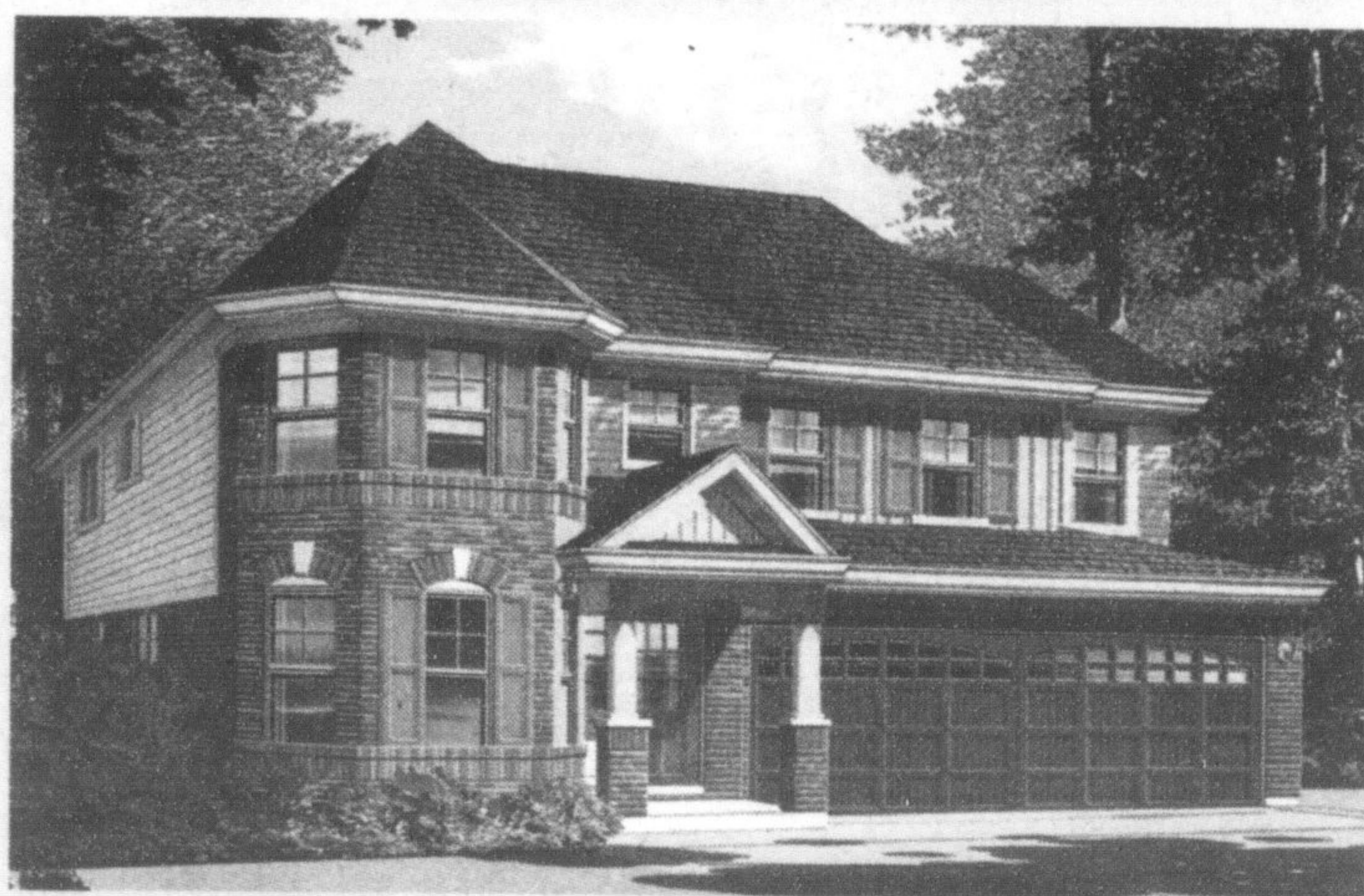
43' WideLot™, The Coronation 'B', 2,098 Sq. Ft., $294,990