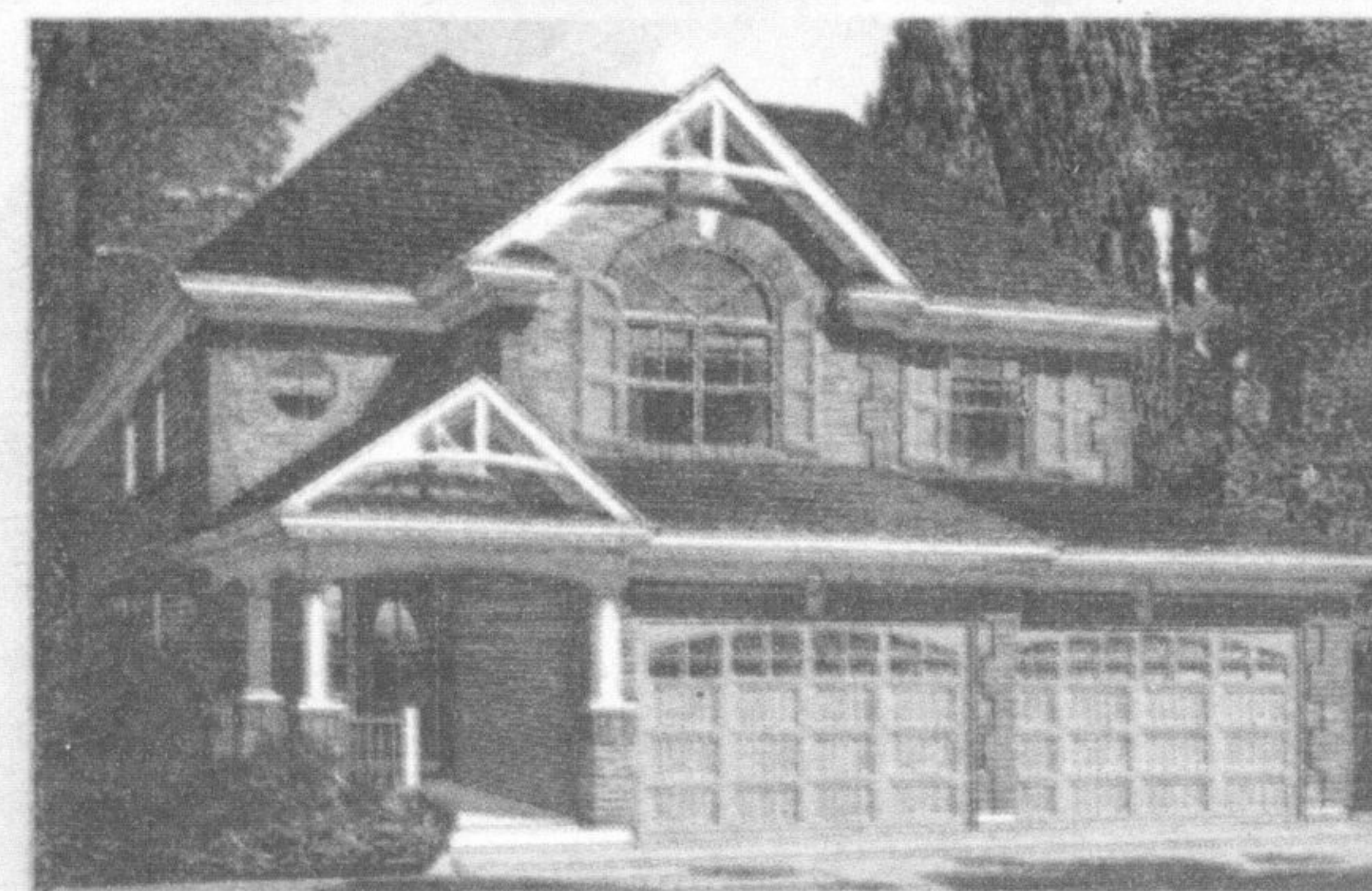
36' WideLot™, The Royal Fern 'B', 2,047 Sq. Ft., $361,990