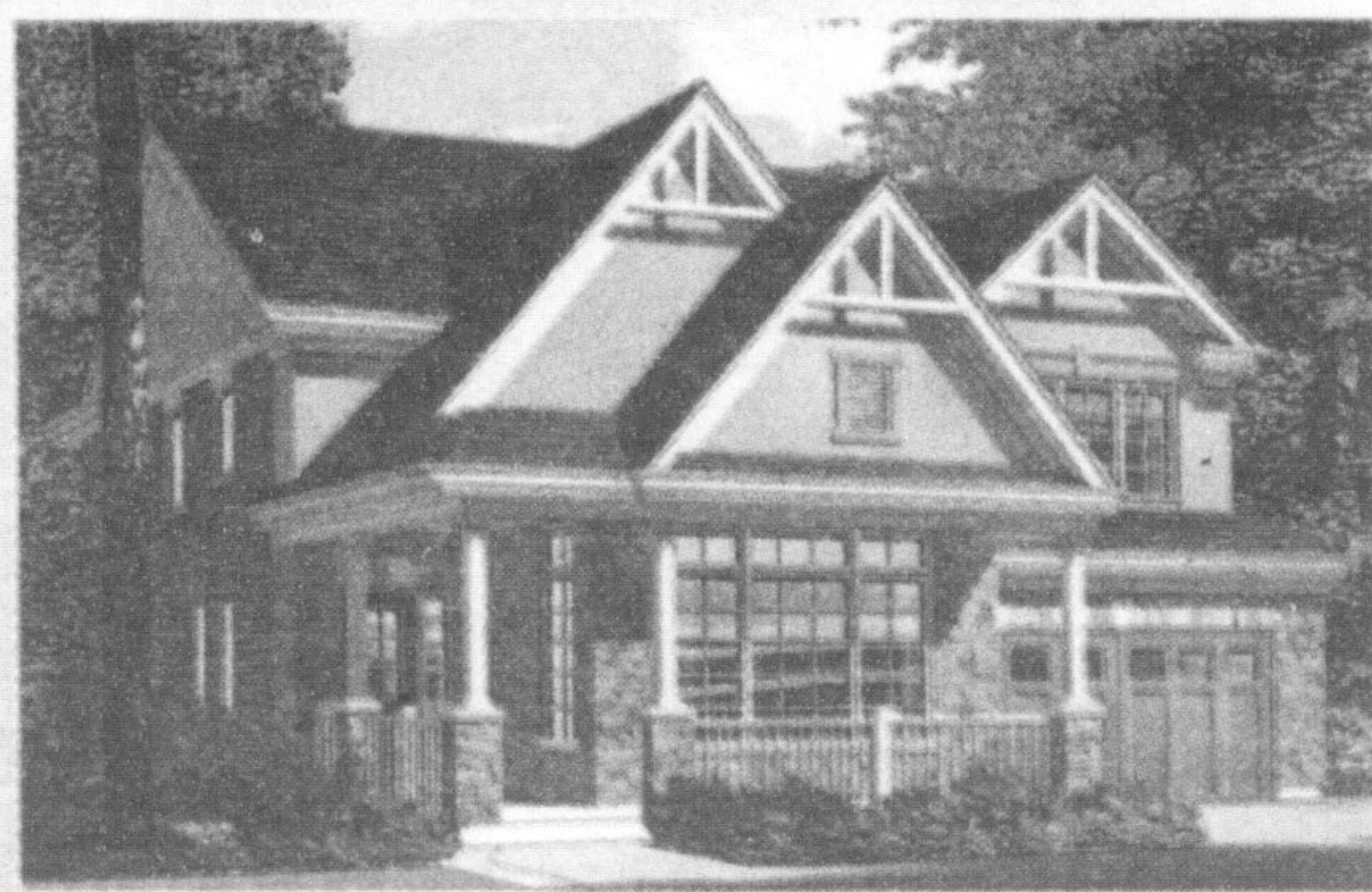
34' WideLot™, The Star Flower 'C', 2,173 Sq. Ft., $370,990