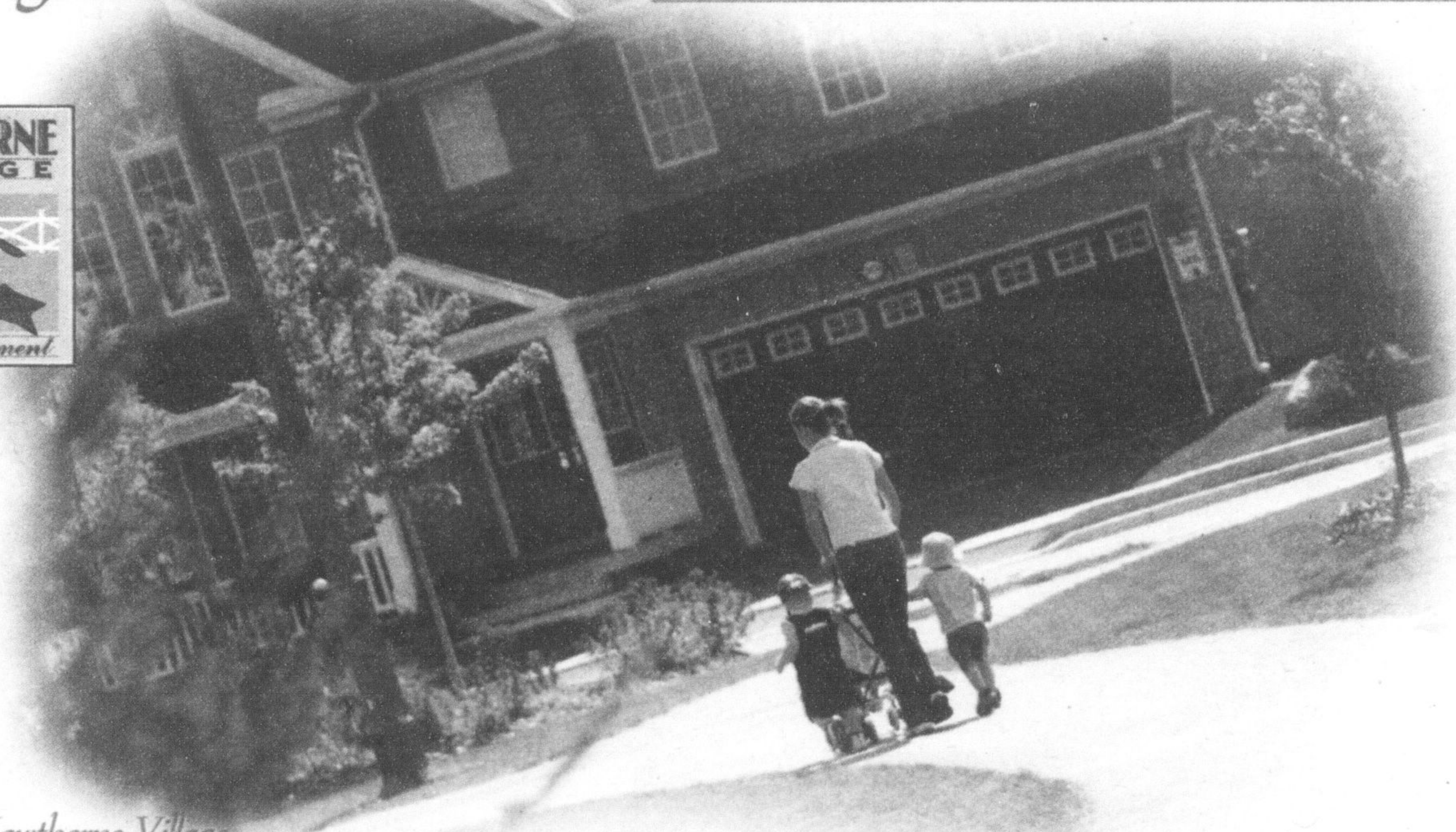
Taking A Stroll In Hawthorne Village