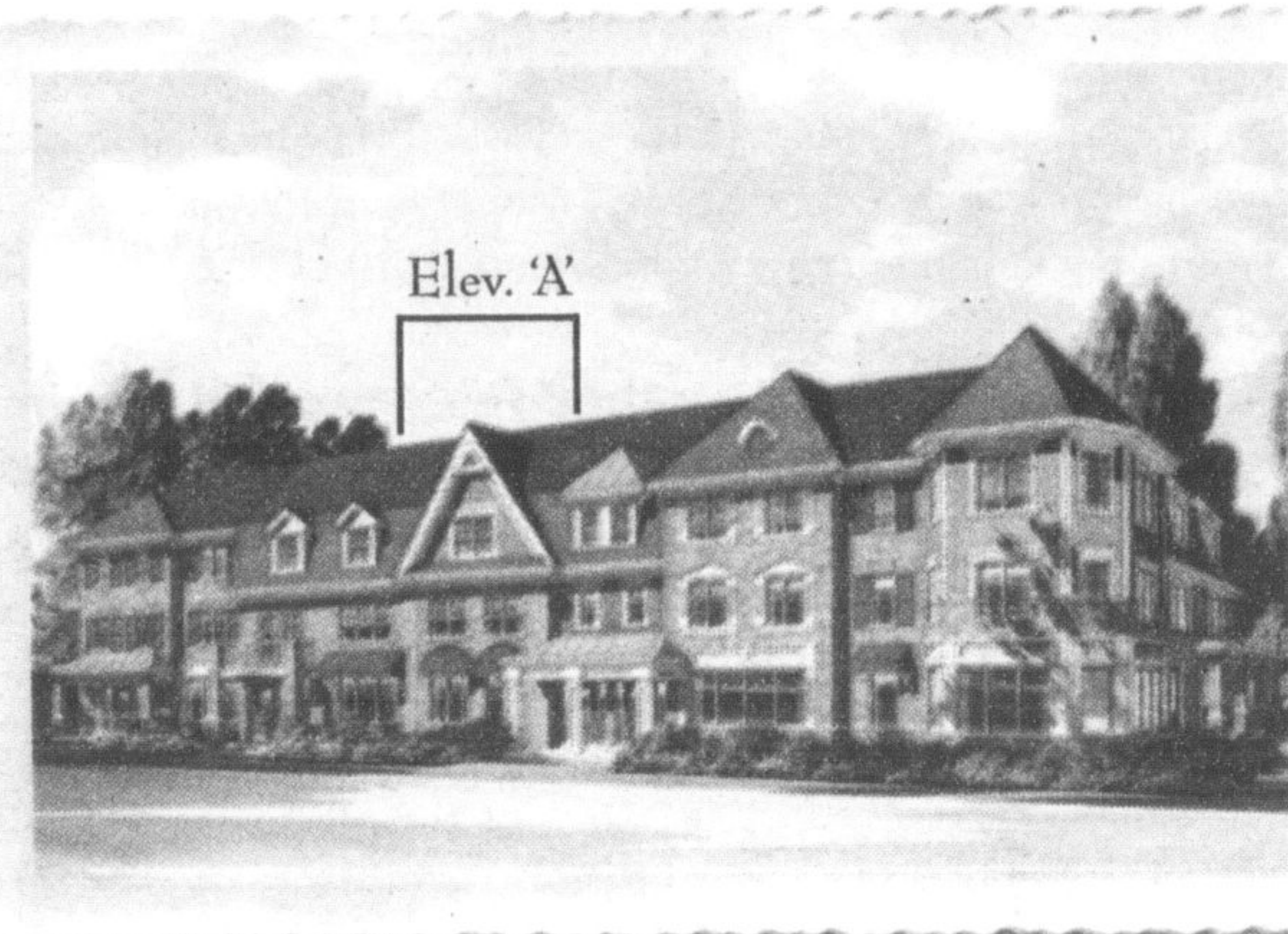
Main Street Townhome, The Brynmont 'A', 1,733 Sq. Ft., $283,990