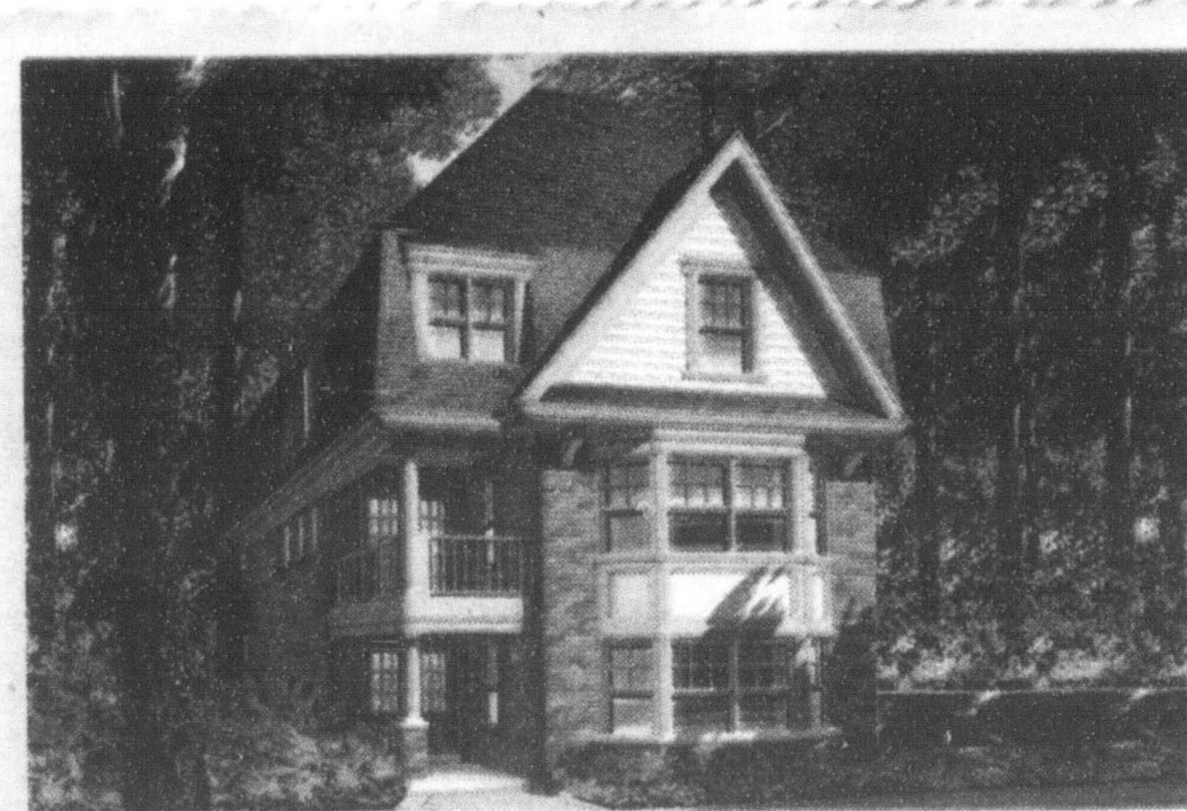
Detached Main Street Home, The Brentrock 'A', 1,943 Sq. Ft., $339,990