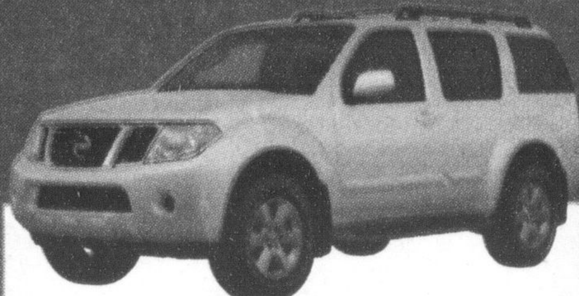
ALL NEW 2008 PATHFINDER