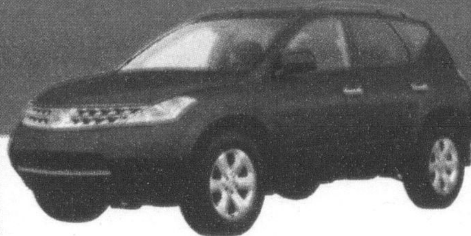
2007 MURANO SL AWD

SAVING OF $6303 Executive Demos from $36,490*