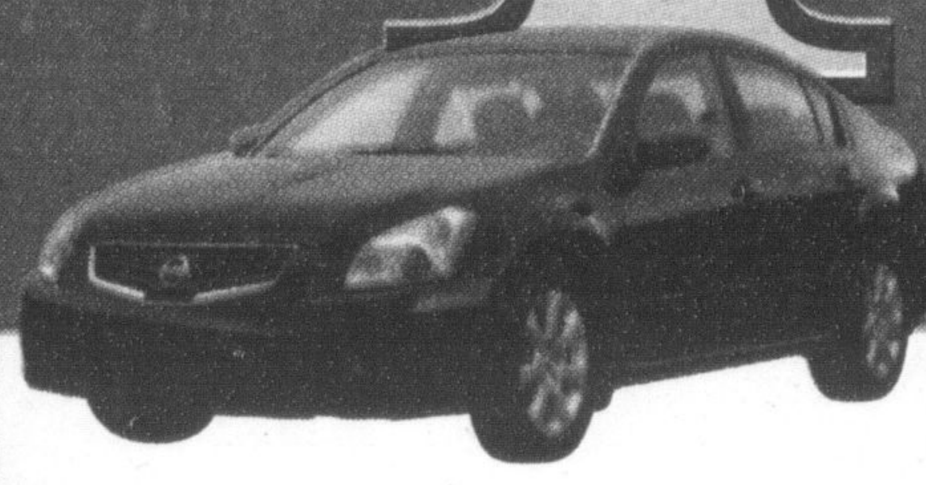
ALL NEW 2008 MAXIMA