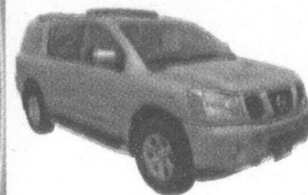
2004 NISSAN ARMADA