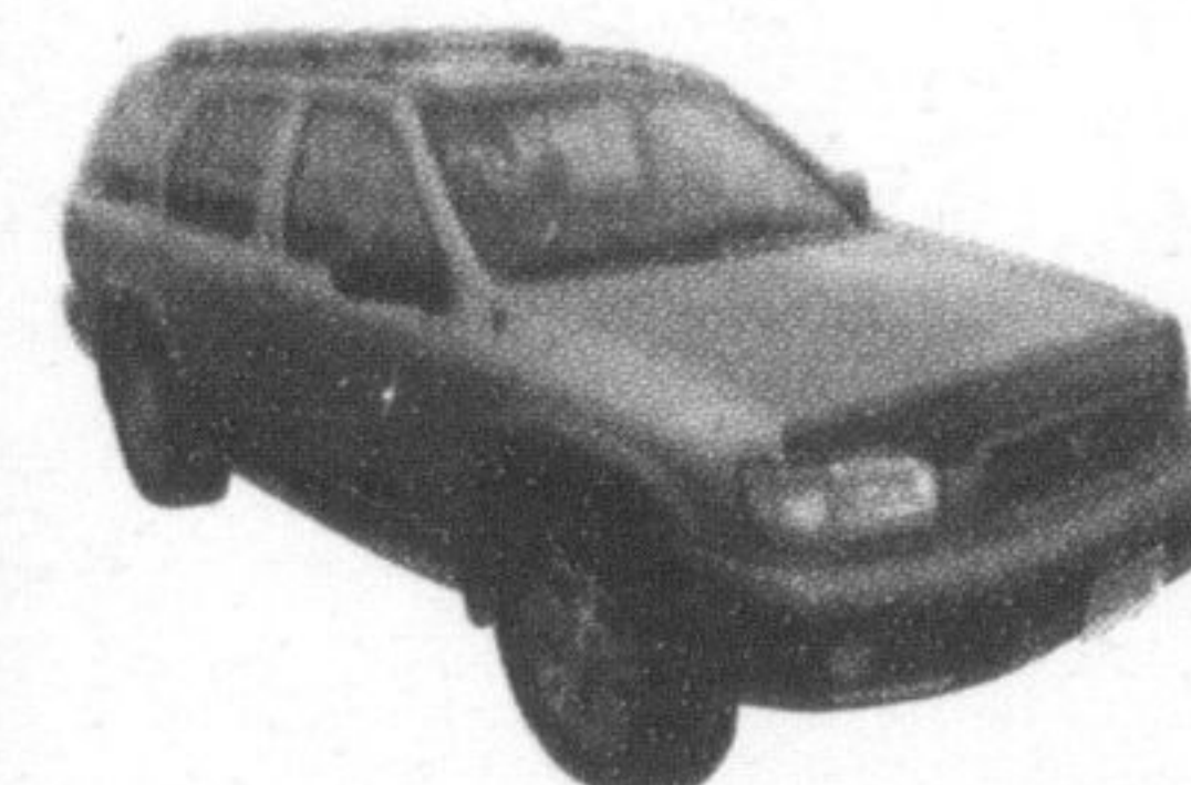
2001 NISSAN PATHFINDER SE

Leather, Power windows/lock, with DVD and Navigation System, 81,000Kms.