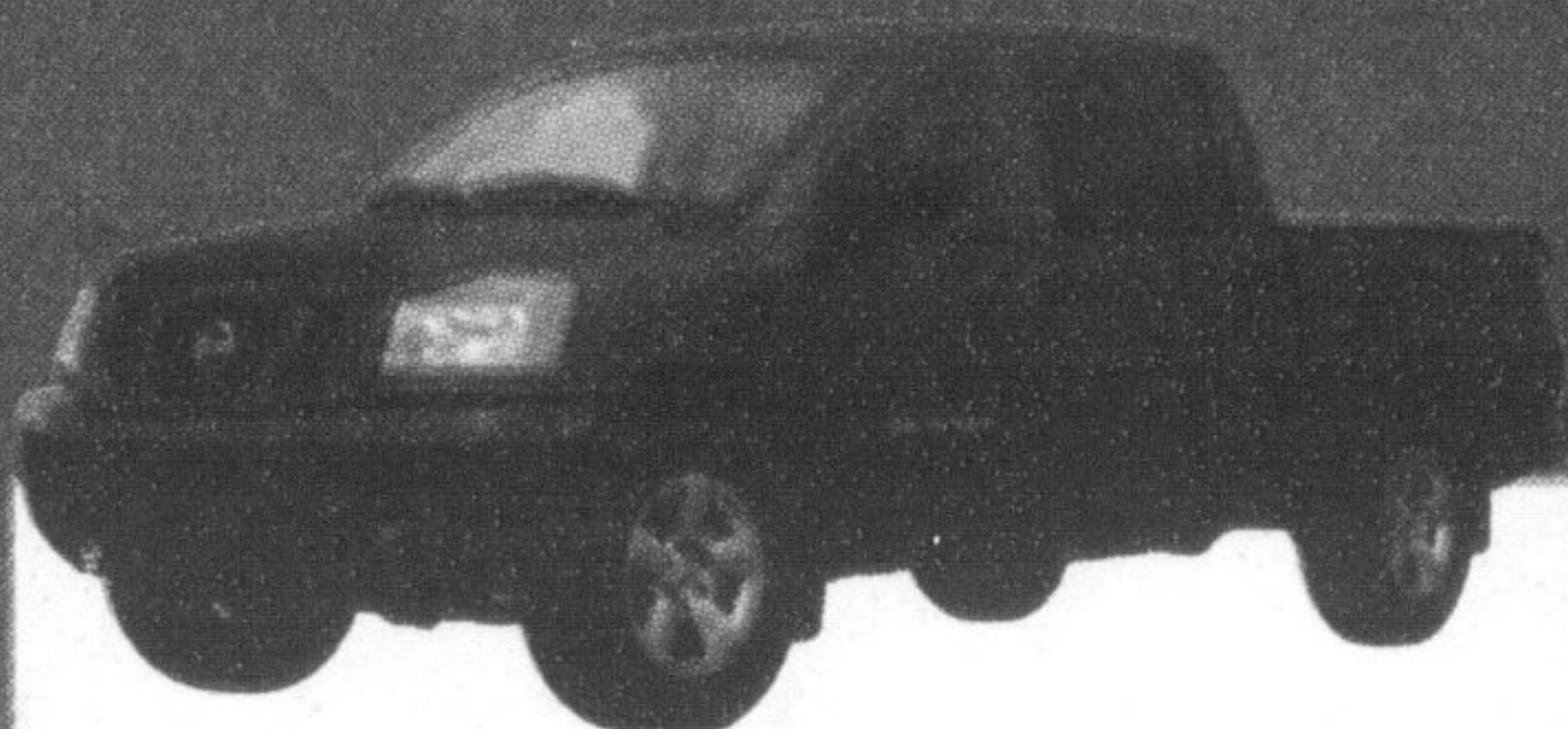
ALL NEW 2008 TITAN