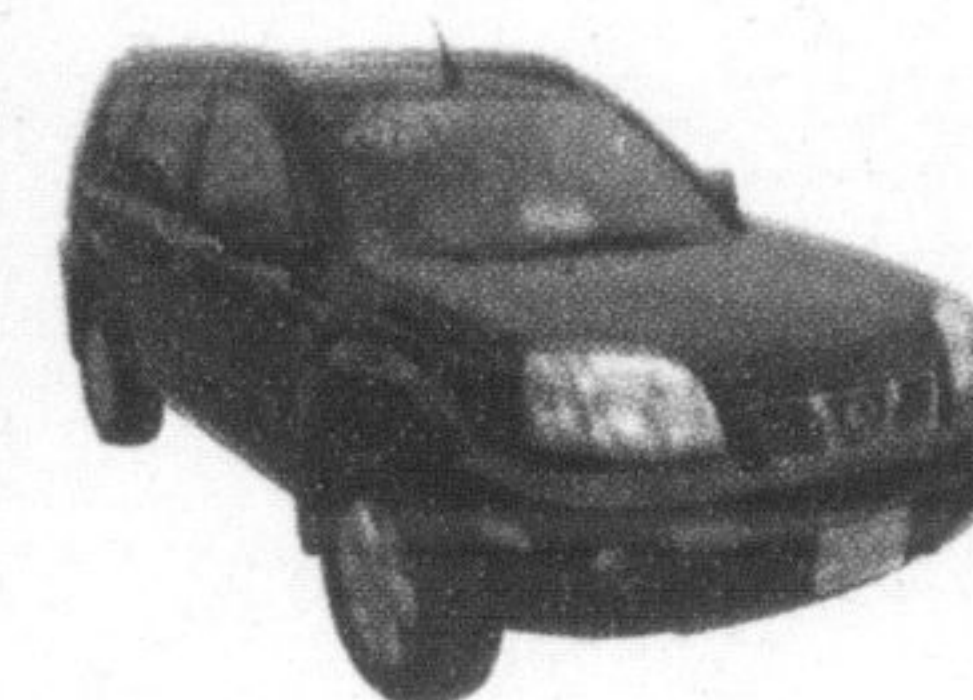
2006 NISSAN XTRAIL SE

3.5L V6, Power locks/windows/Roof, Fog lights, Leather Pkg.