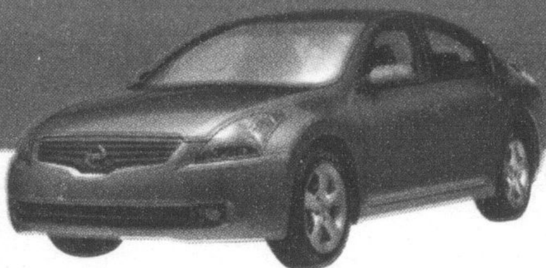
ALL NEW 2008 ALTIMA