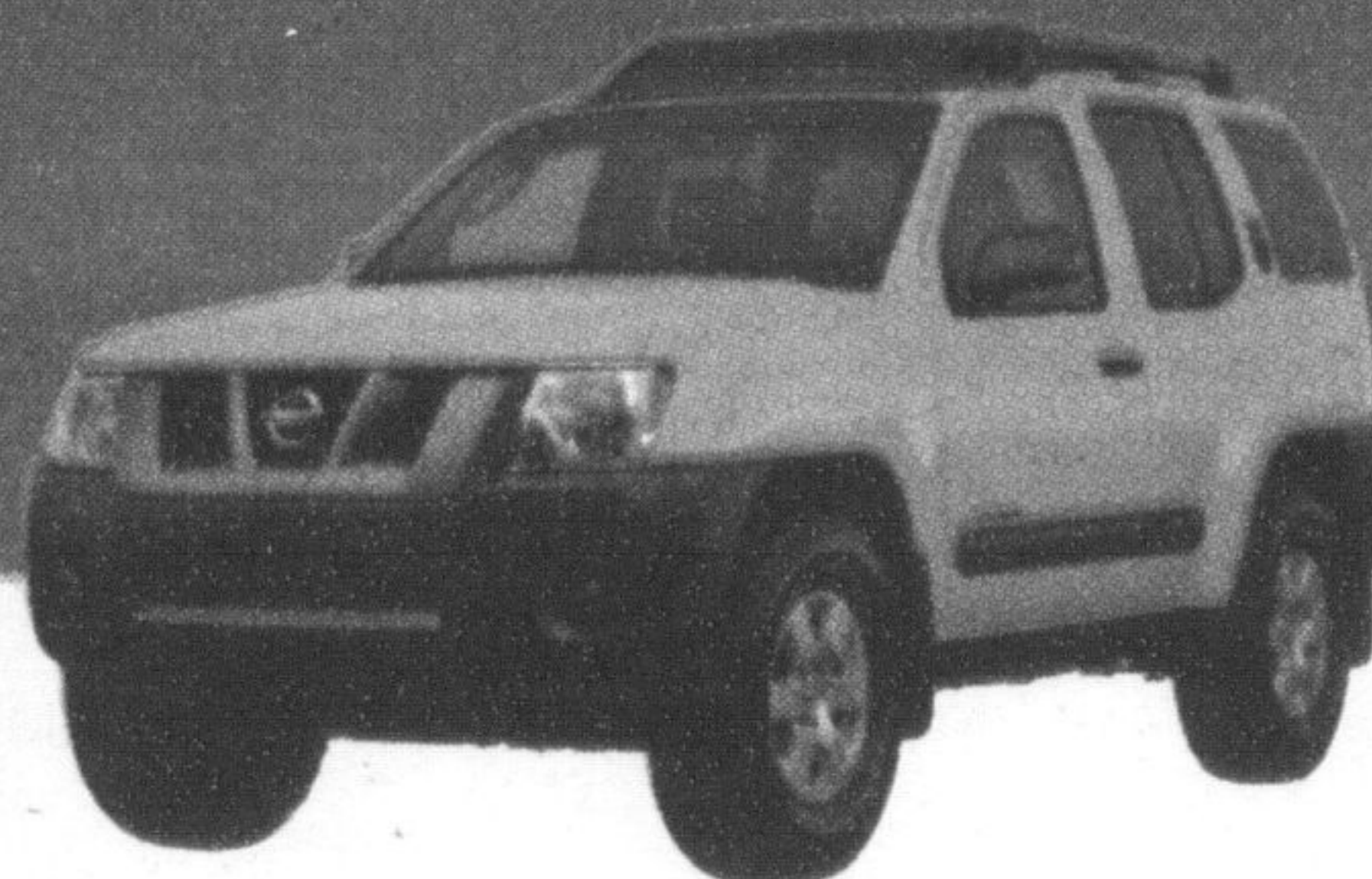
ALL NEW 2008 XTERRA

SAVING OF $6303 Executive Demos from $36,490*