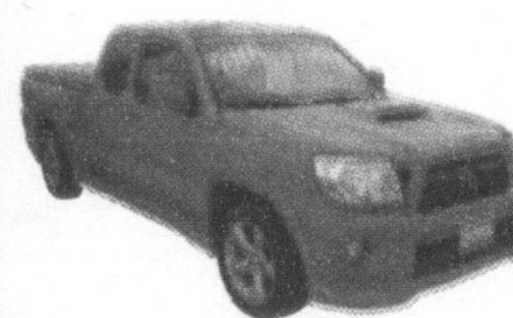
2006 TOYOTA TACOMA X-RUNNER

2.5L, 4 Cyl, Auto, 2WD, Heated seats, Power roof, Fog lights, 61,000Kms